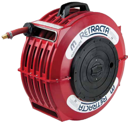
T-TWHWR1215 (Hot Wash Reel and Hose)