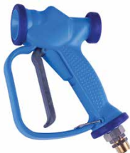
T-TWSGV65SVL (Trigger Gun)