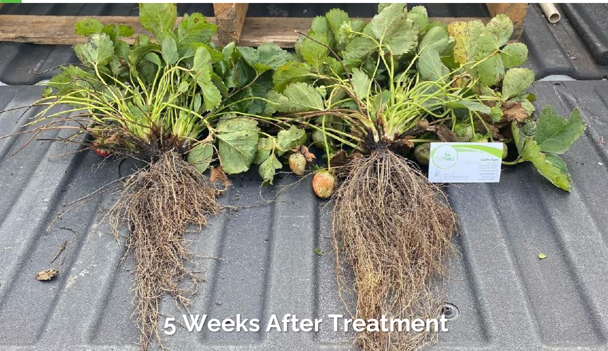
5 Weeks After Treatment