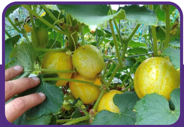
Bright Flower Farms, Gladstone, MI

Available in: 1 Gallon Jugs 1 Quart Jugs