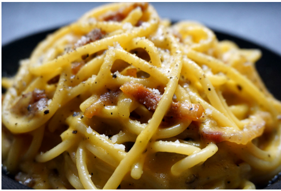
A bunch of pepper