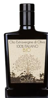
Extra Virgin Olive Oil variety Coratina Organic