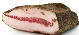
Guanciale - Cured Pork cheek