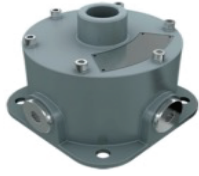
1. Junction Box