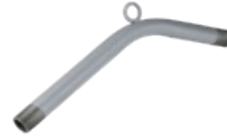
3. Bended Pipe