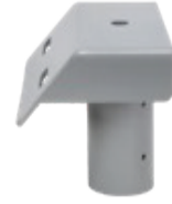
4. Slip Fitter Mount