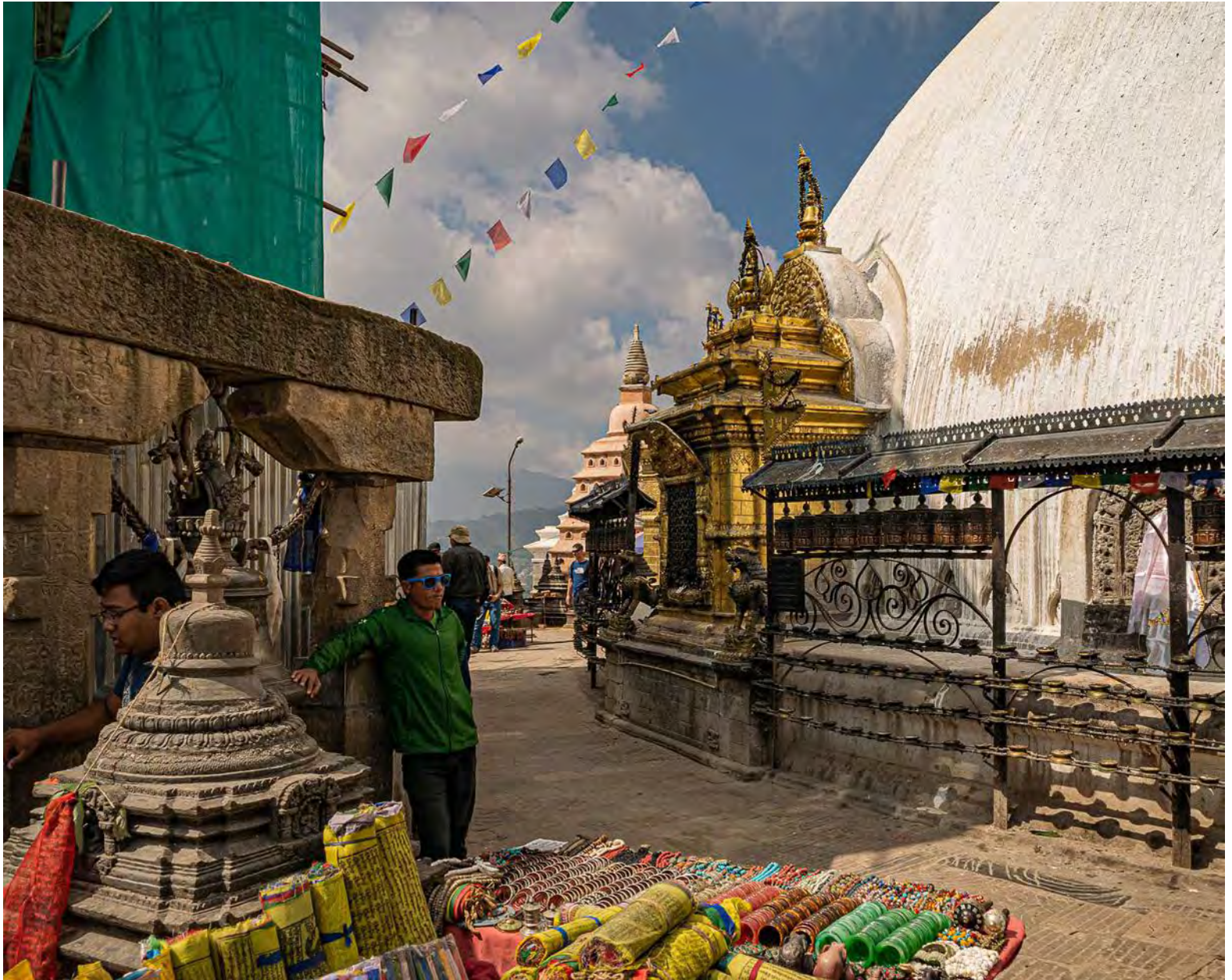
Vendor selling souvenirs outside of the Monkey Temple