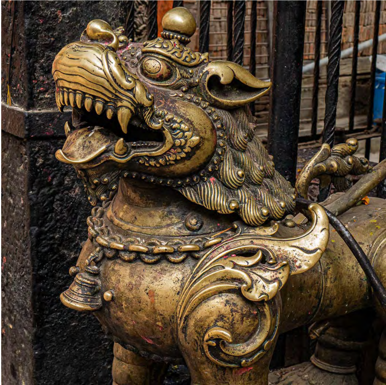
Bronze lion guardian