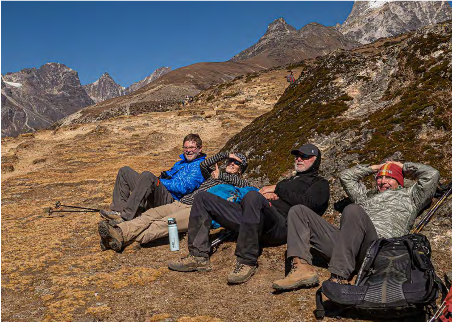
Waiting for the porters to catch up to us above Dingboche