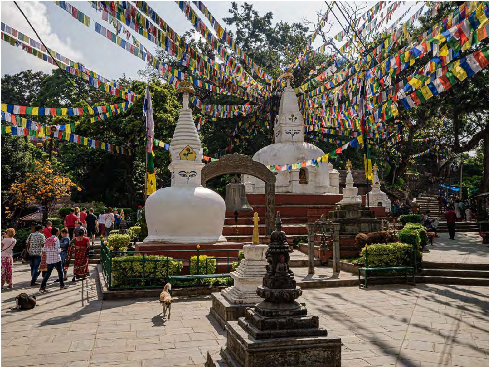
The entrance to Swayambhu