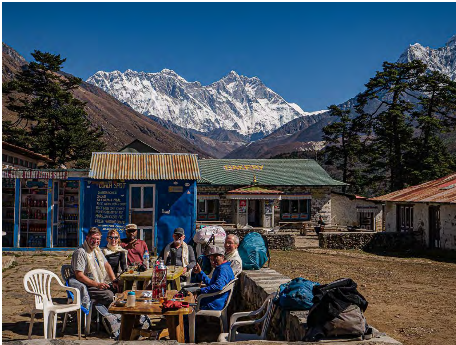
At Tengboche on our way home