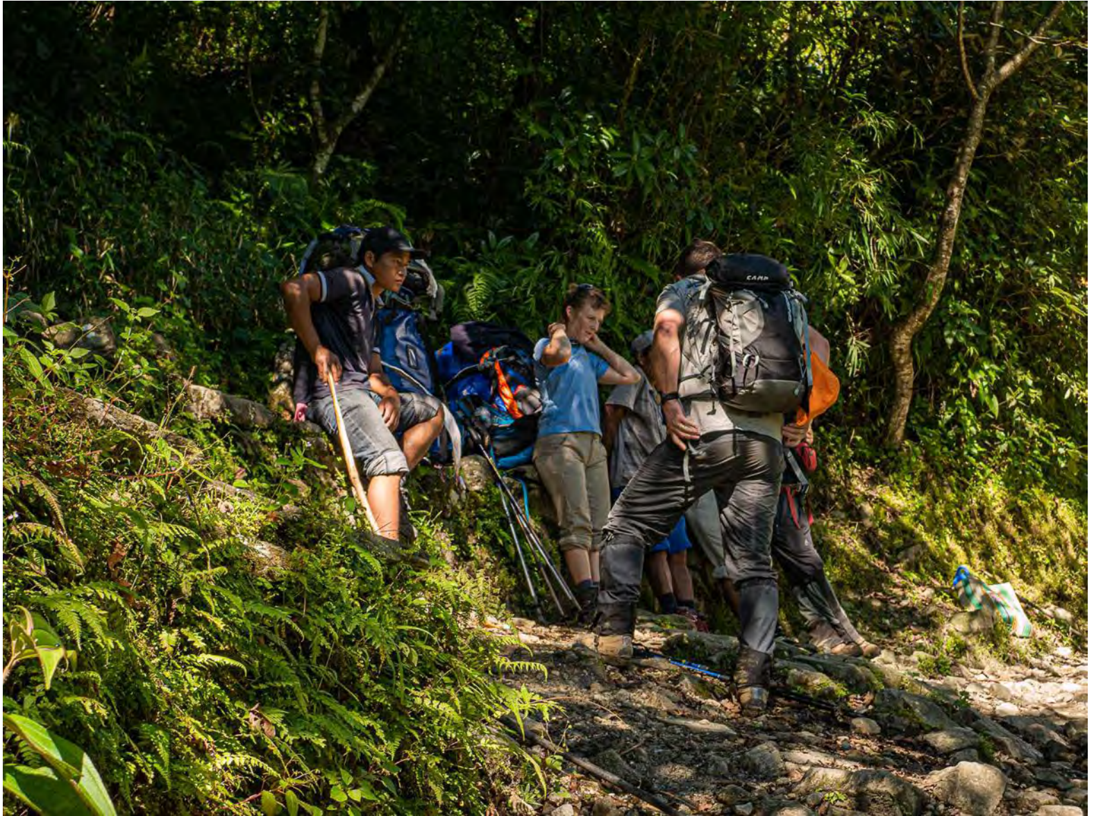
Resting in the shade in the hot sun