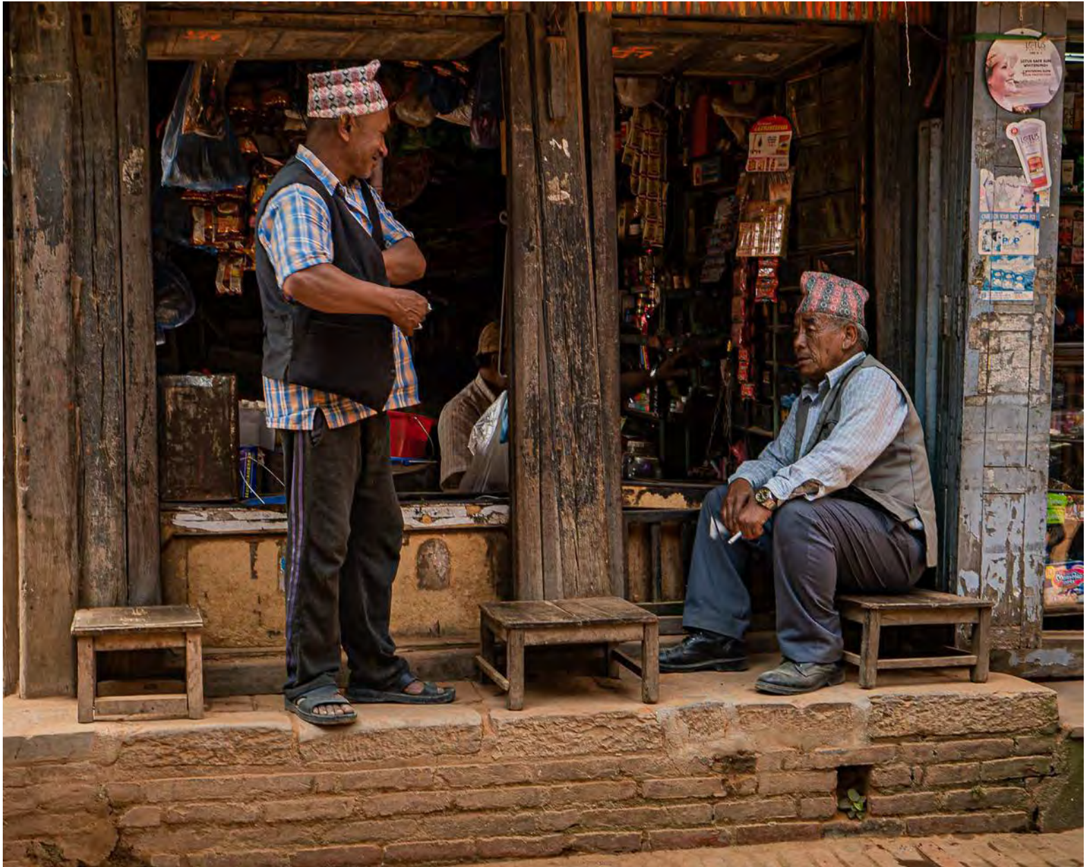
Shop keepers minding business