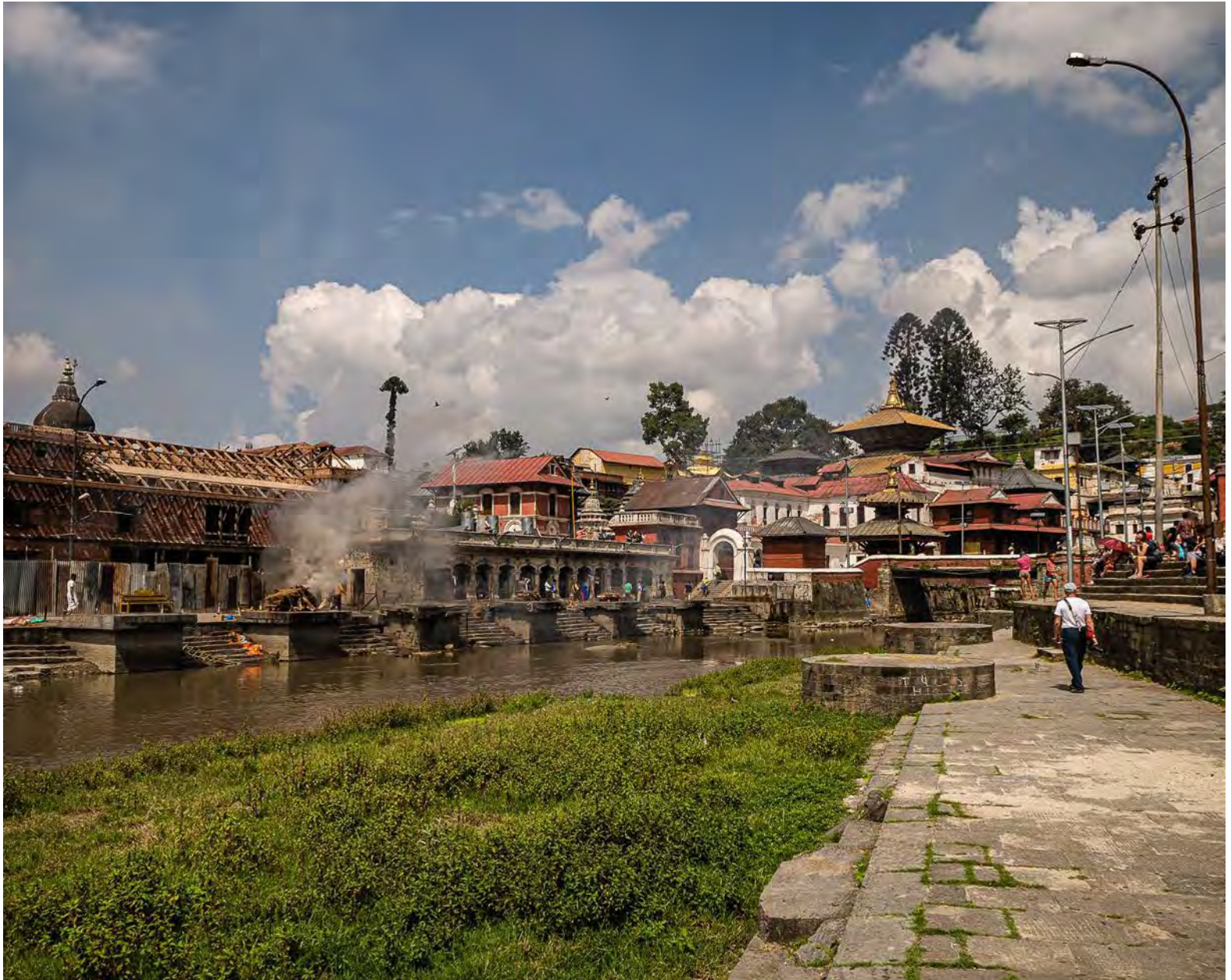
The crematoria area at Pasupatinath