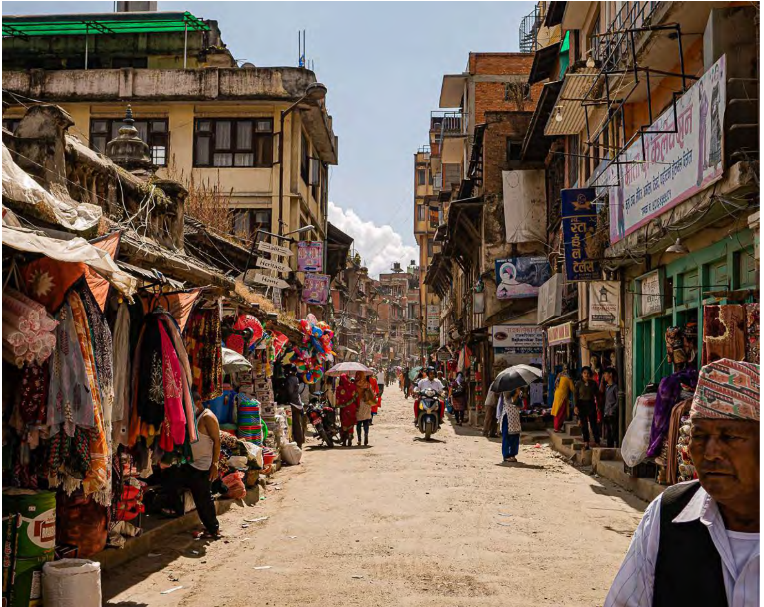
The streets of Kathmandu