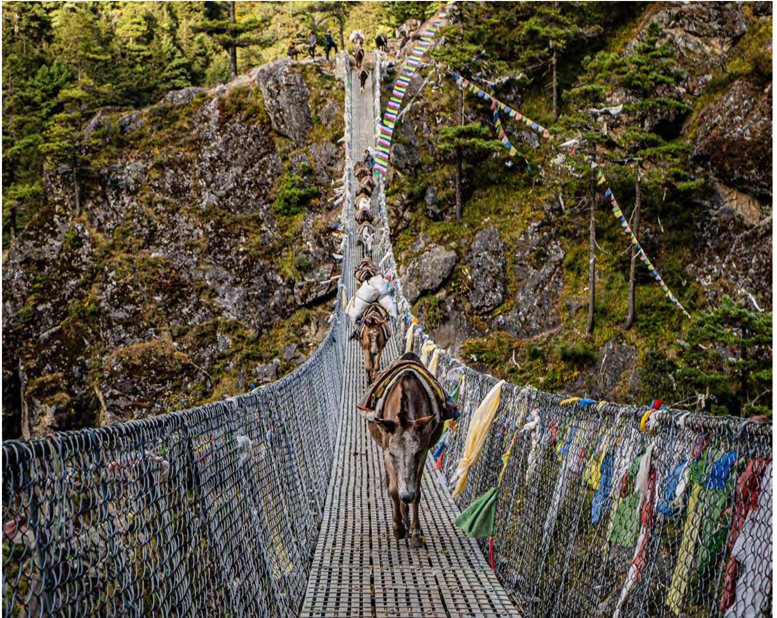
Waiting to cross the suspension bridge