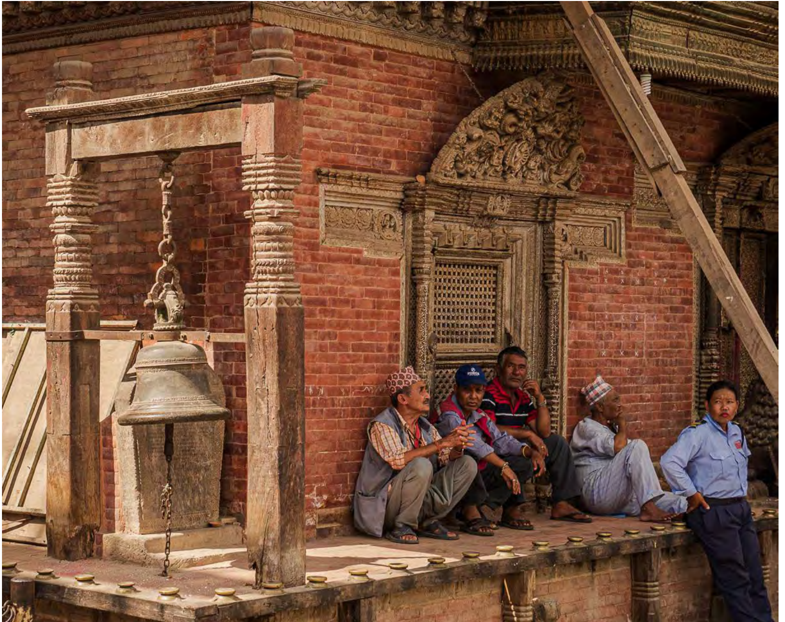
Getting out of the sun