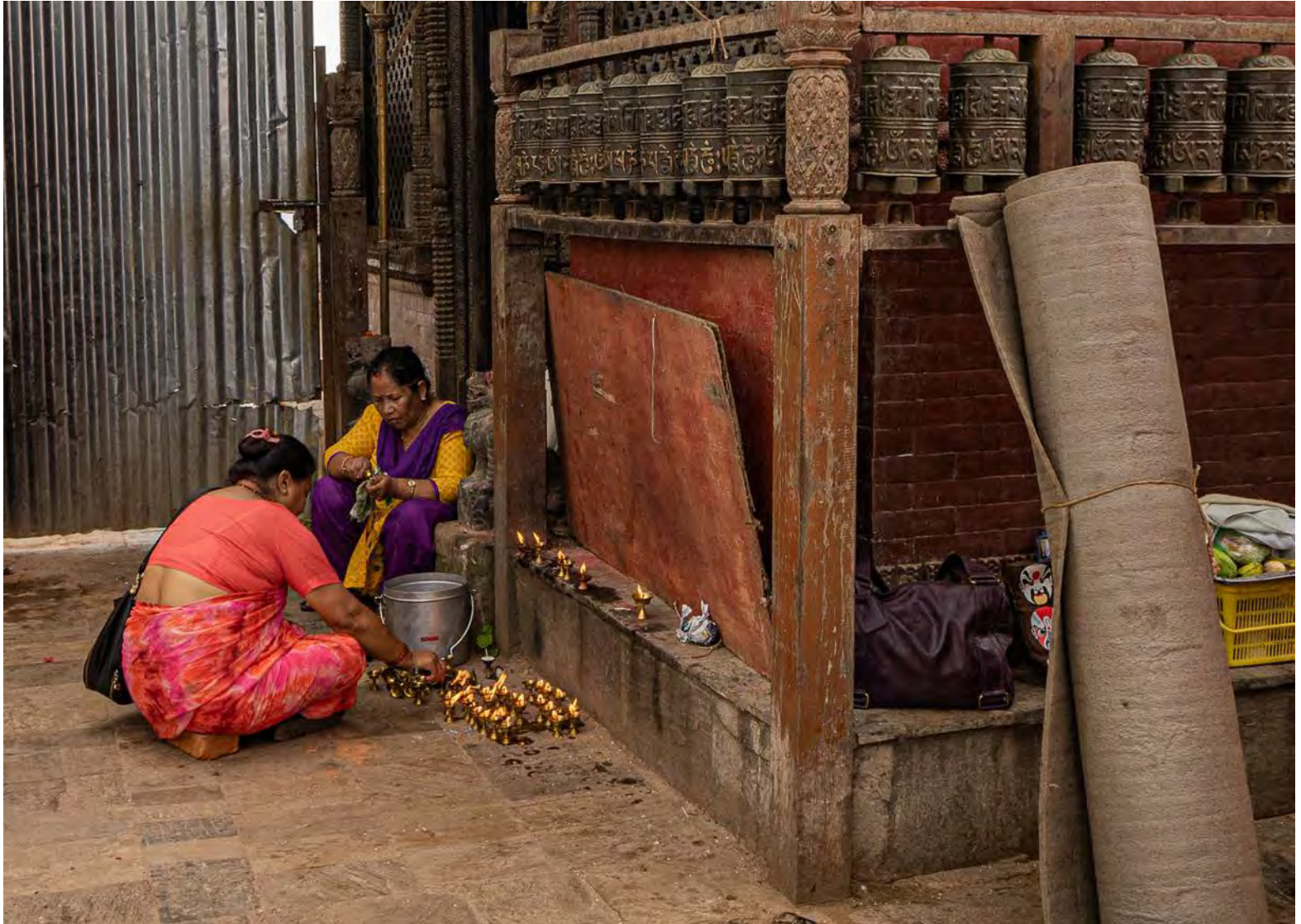
Two women making butter lamps