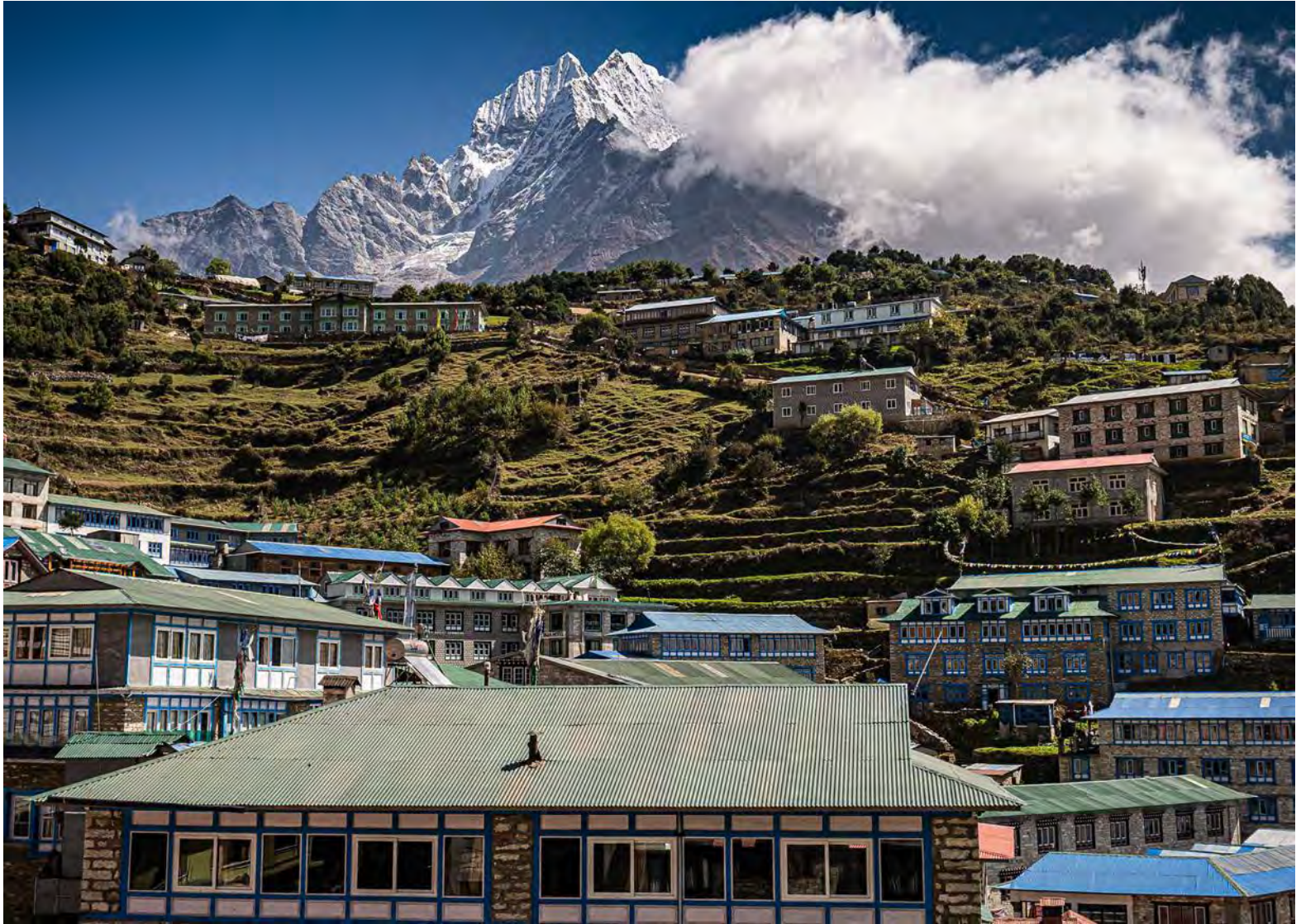
The mountains above Namche Bazaar