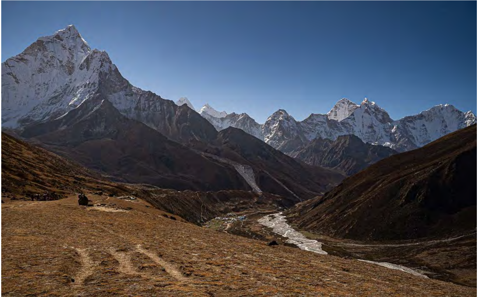
Ama Dablam and Pheriche