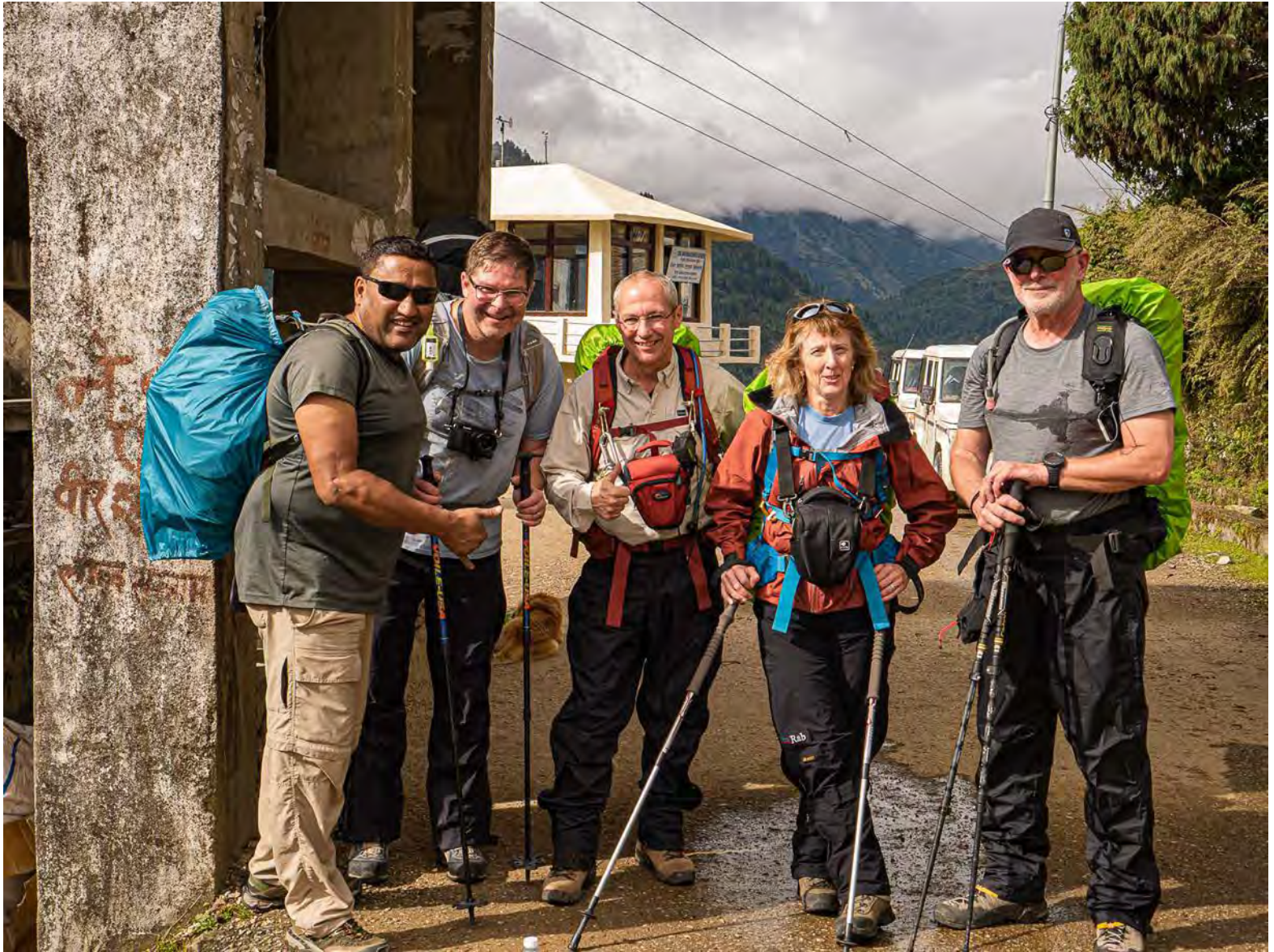
Starting the trek in Phaplu