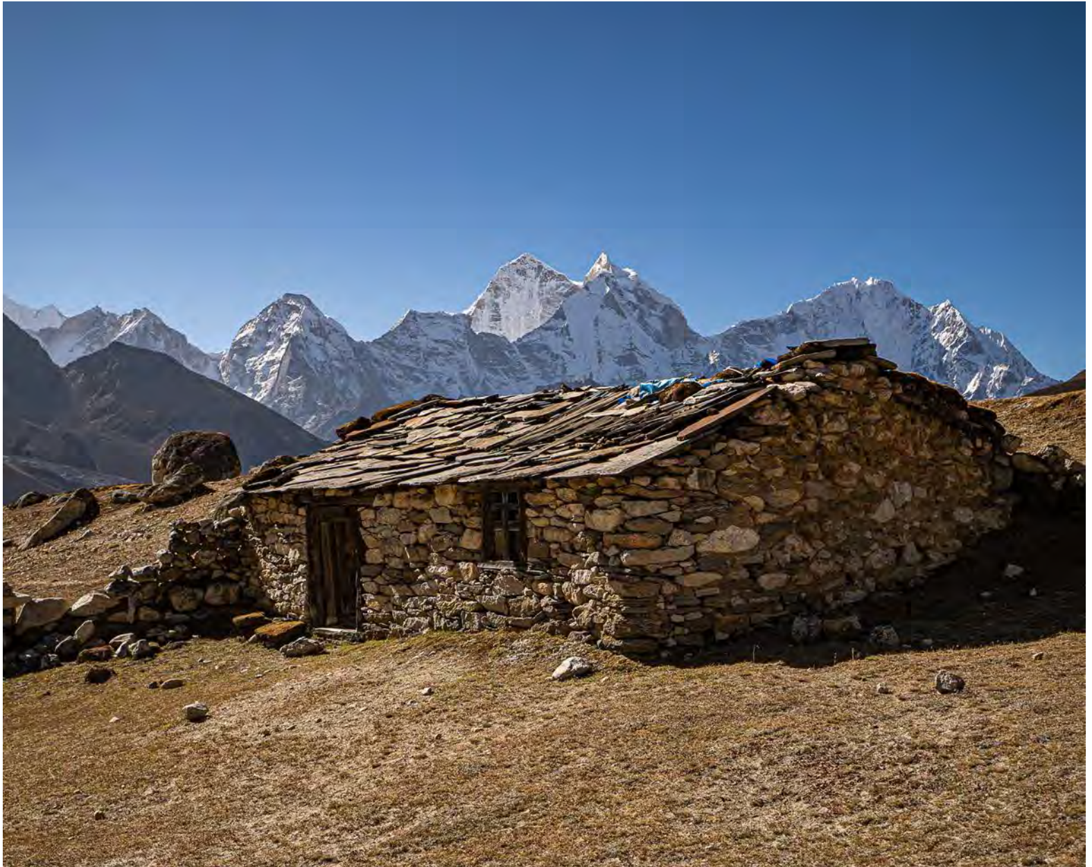
An old stone house at Dusa