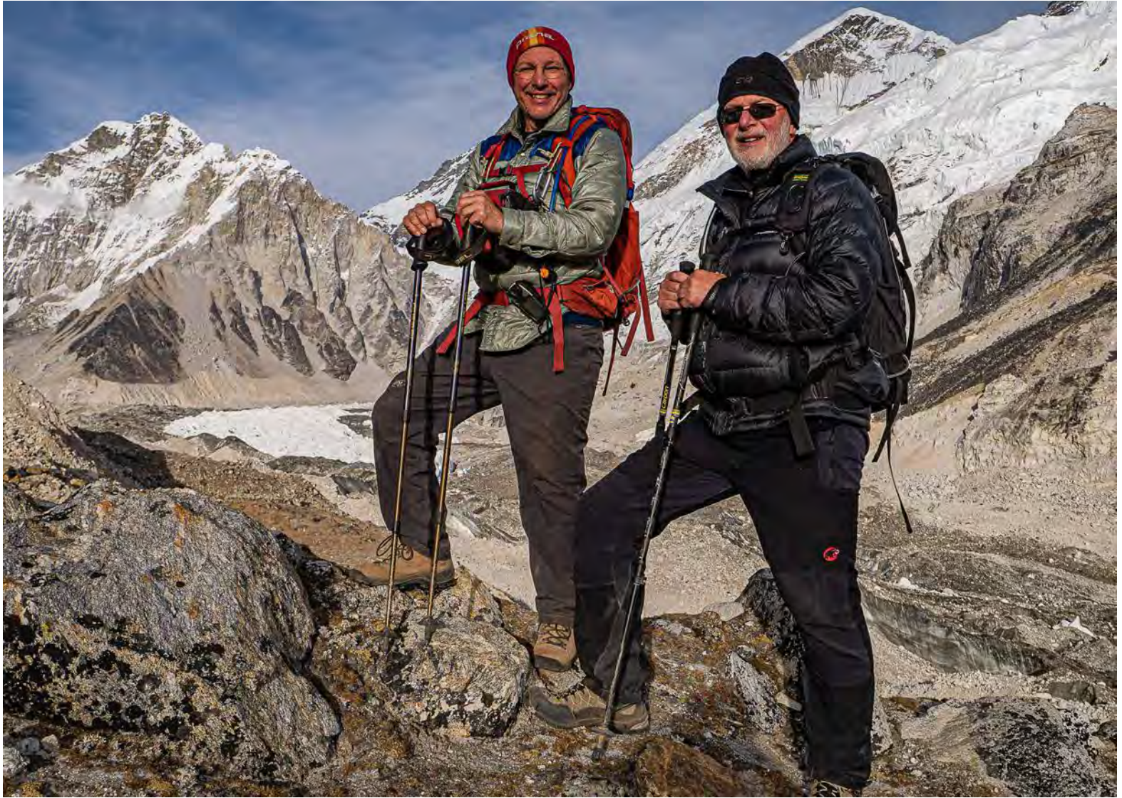
The end of the trek above Khumbu glacier