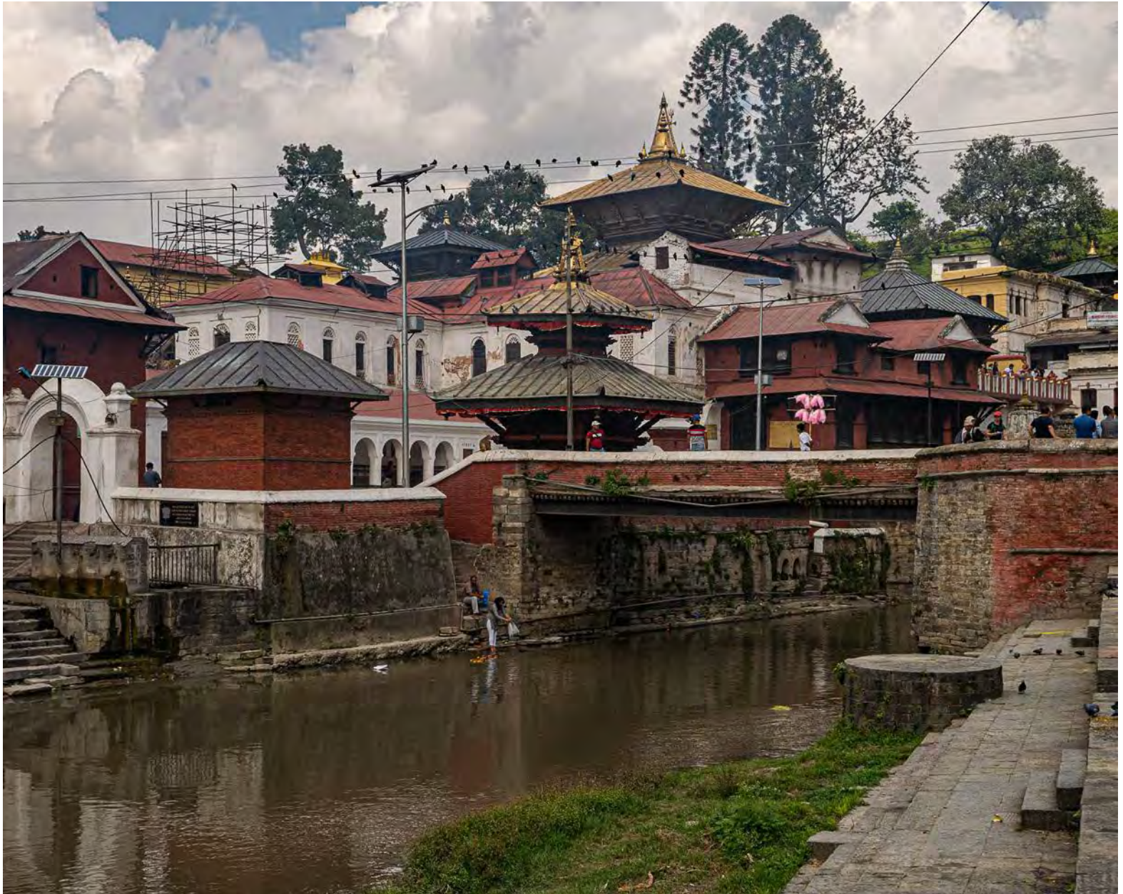
Pashupatinath Temple complex