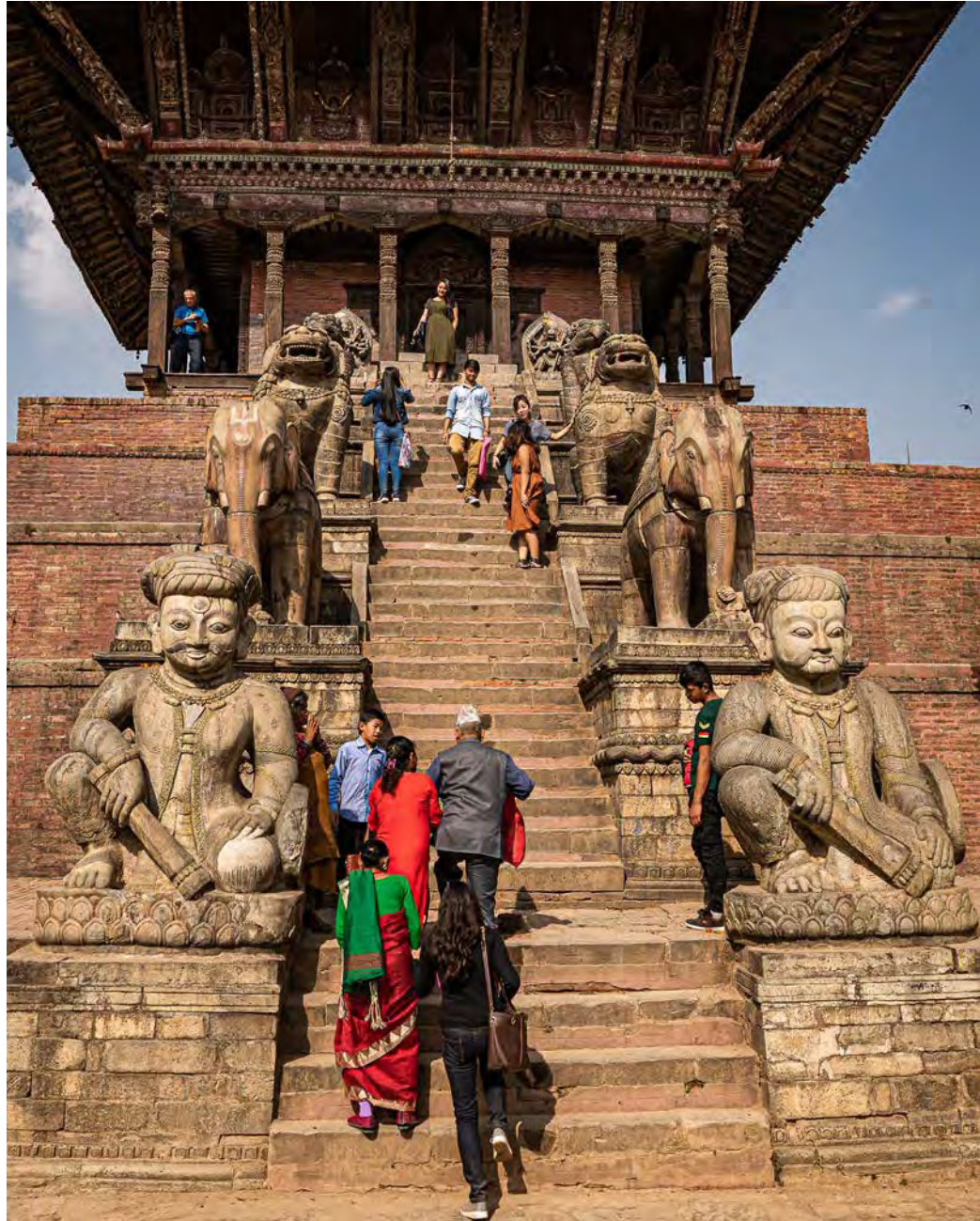
Nyatapola Temple Taumadhi Square in Bhaktapur