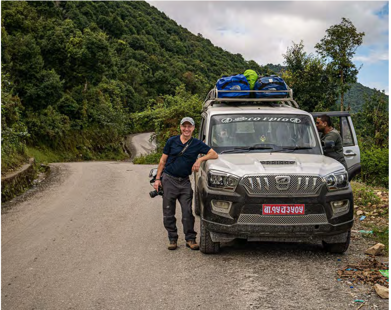
Our ride from Kathmandu to Phaplu