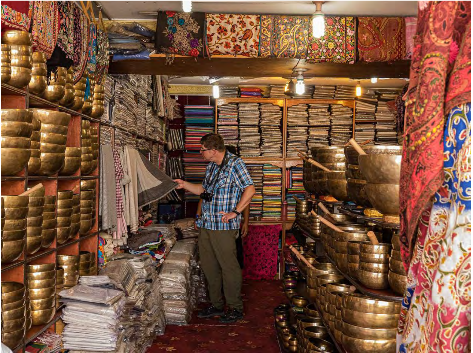
Shopping for scarves