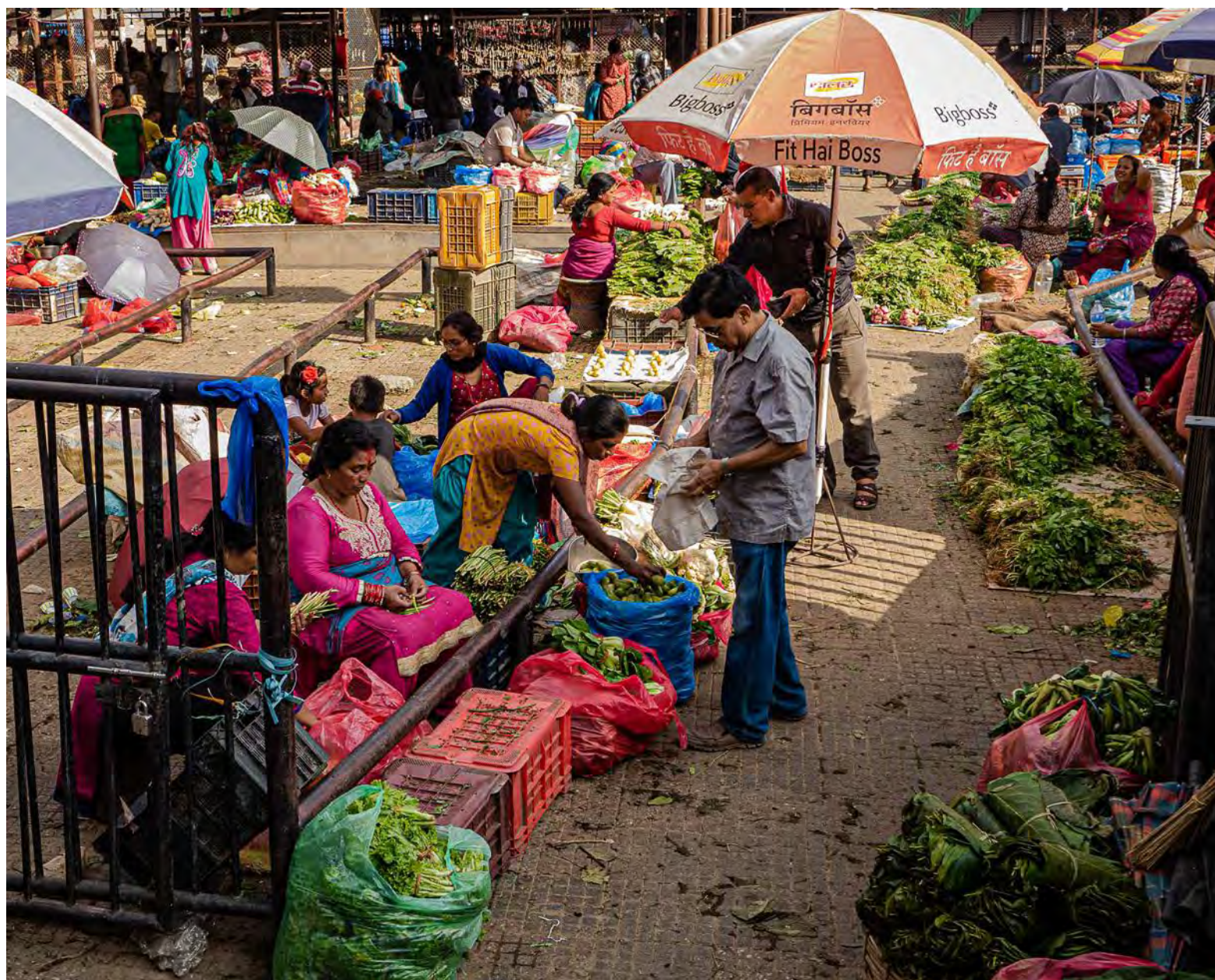
Open market in Kathmandu