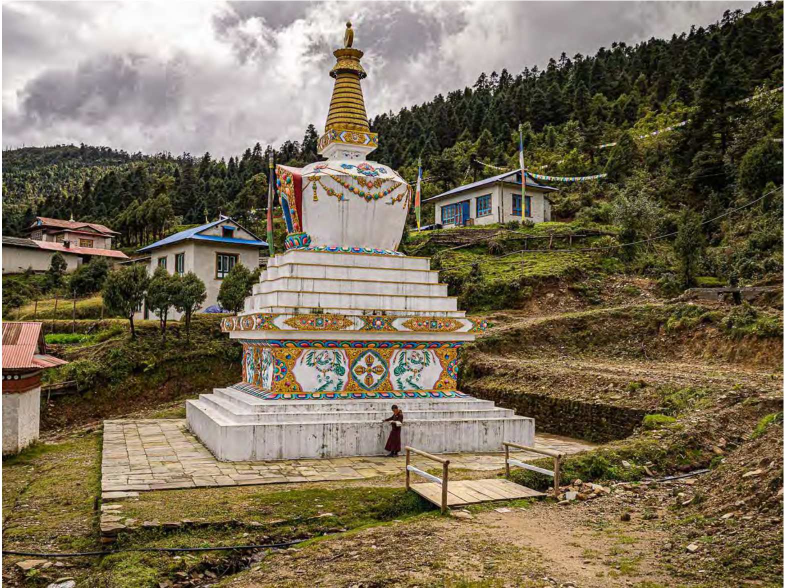
A young monk doing his devotions