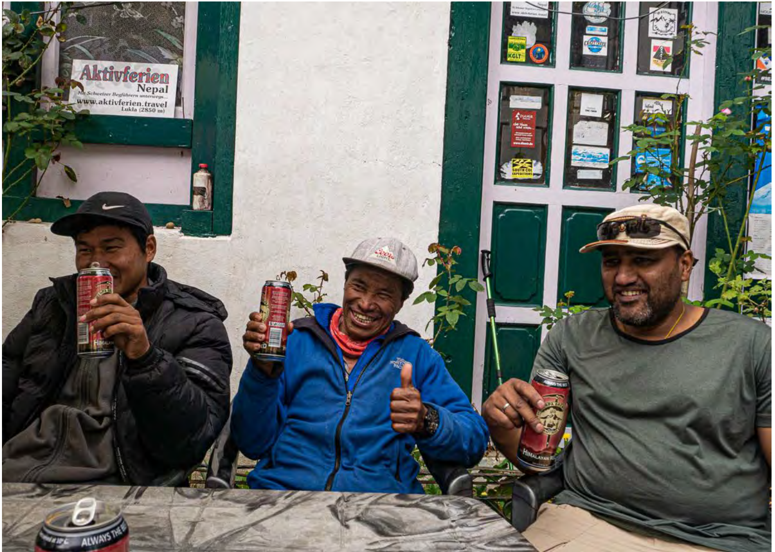
Our support team