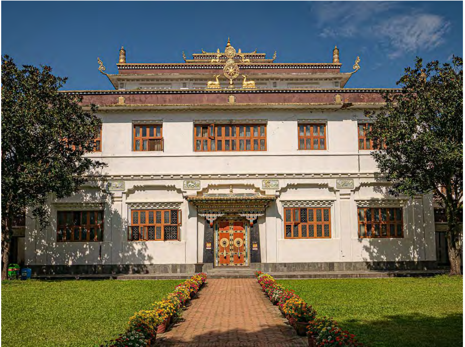
Monastery in Kathmandu