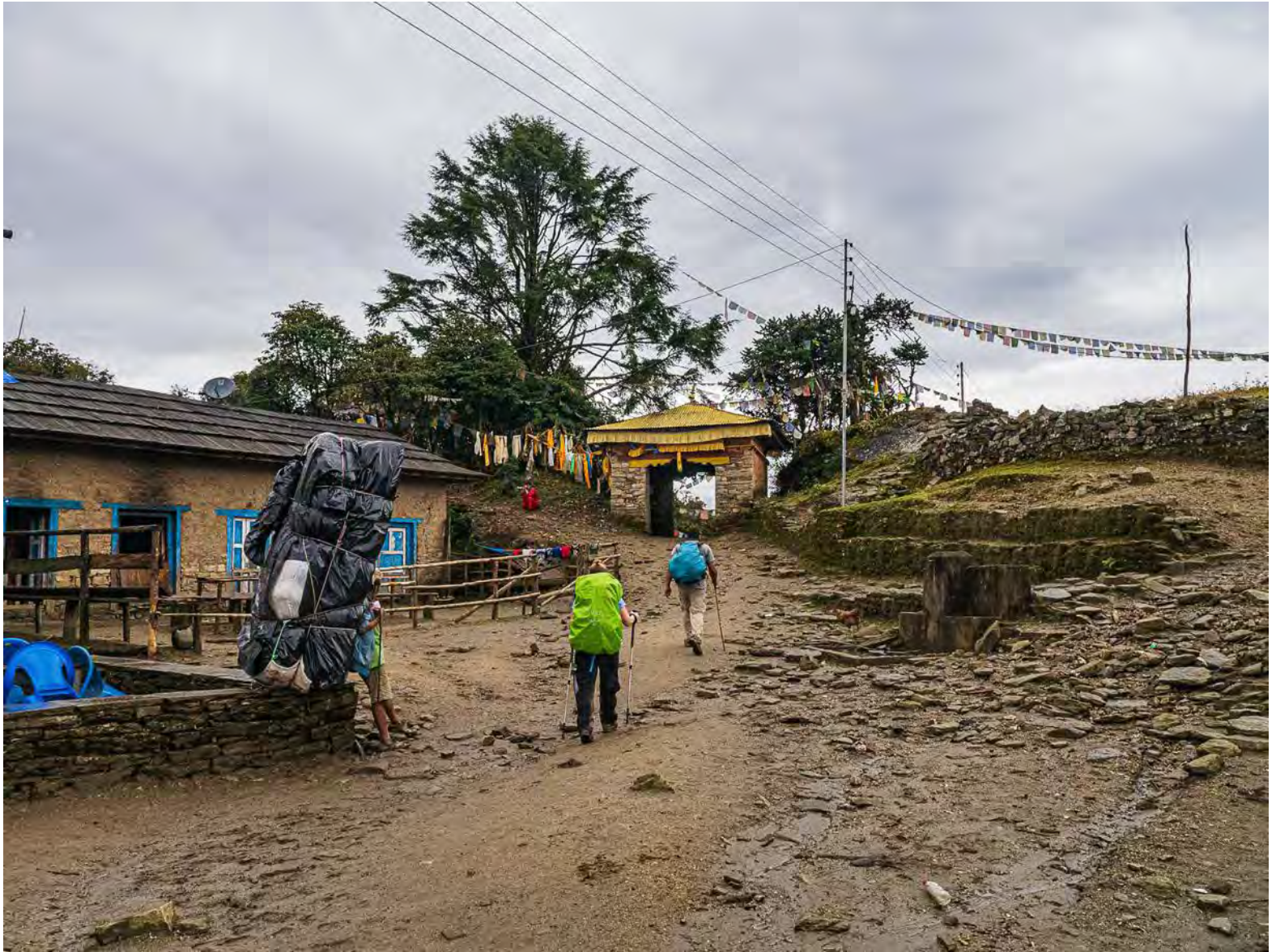
The gate at Taksindu La