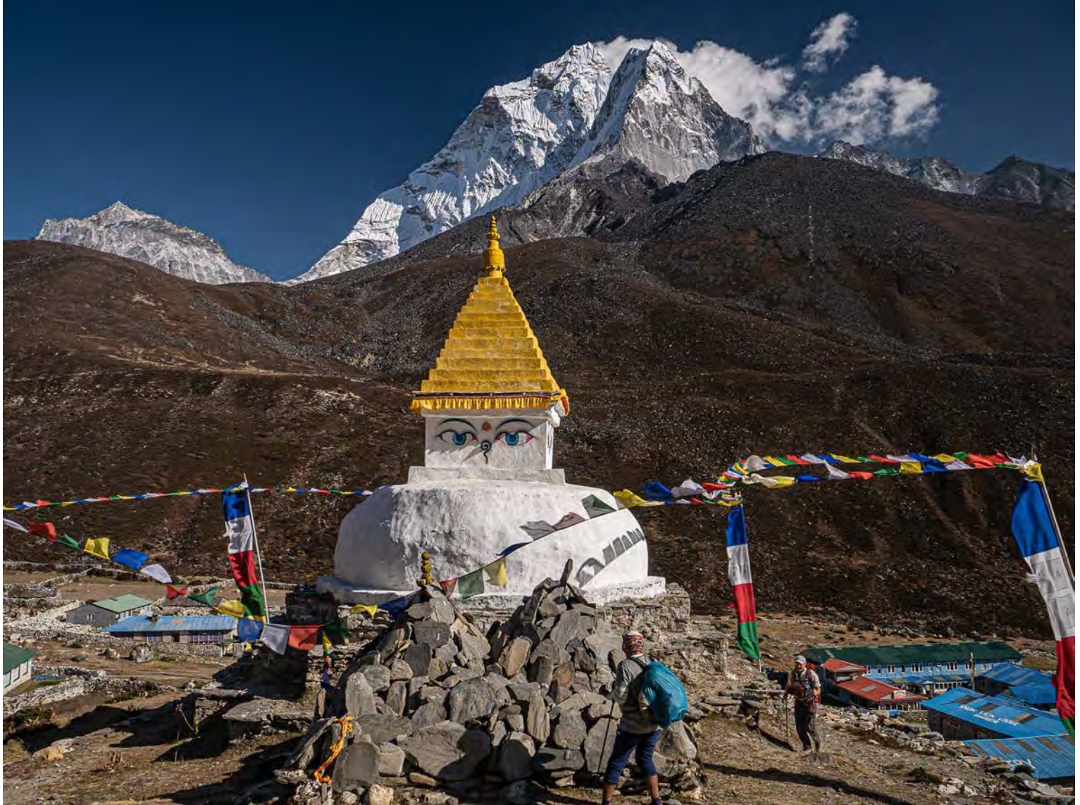
Stupa at Dingboche