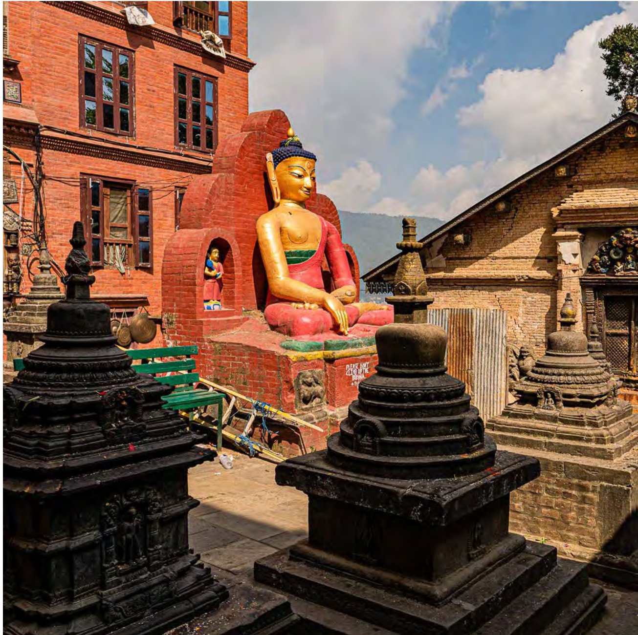
Buddha Statue at Swayambhunath