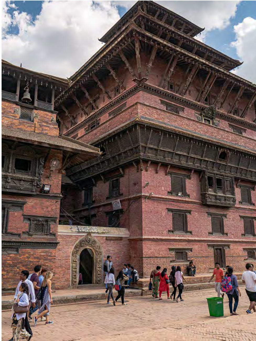
Basantapur Durbar Square