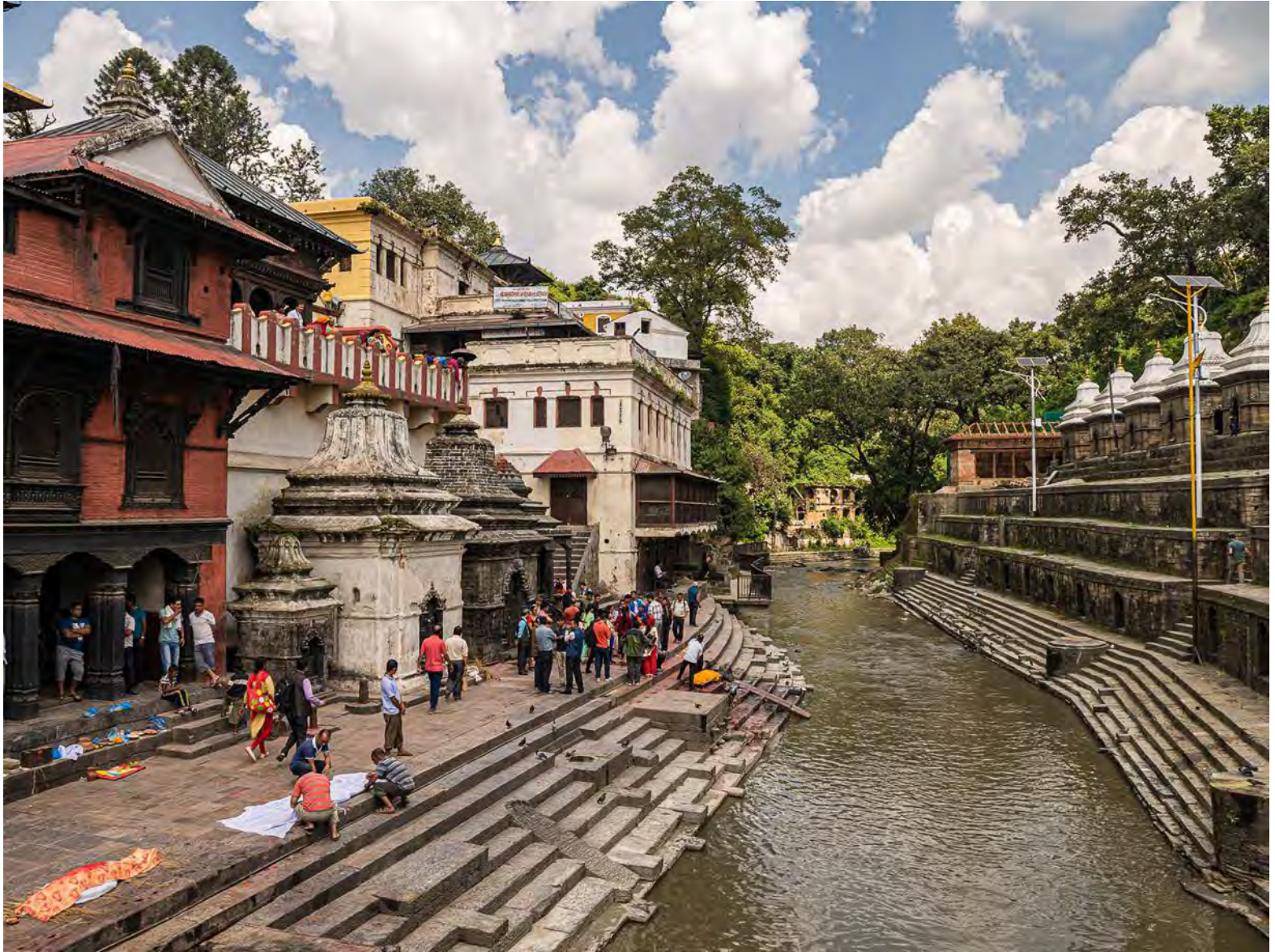
Pashupatinath Temple and the Bagmati River