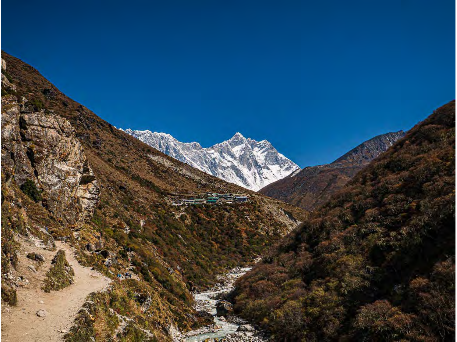
Imja Khola river and Orsho