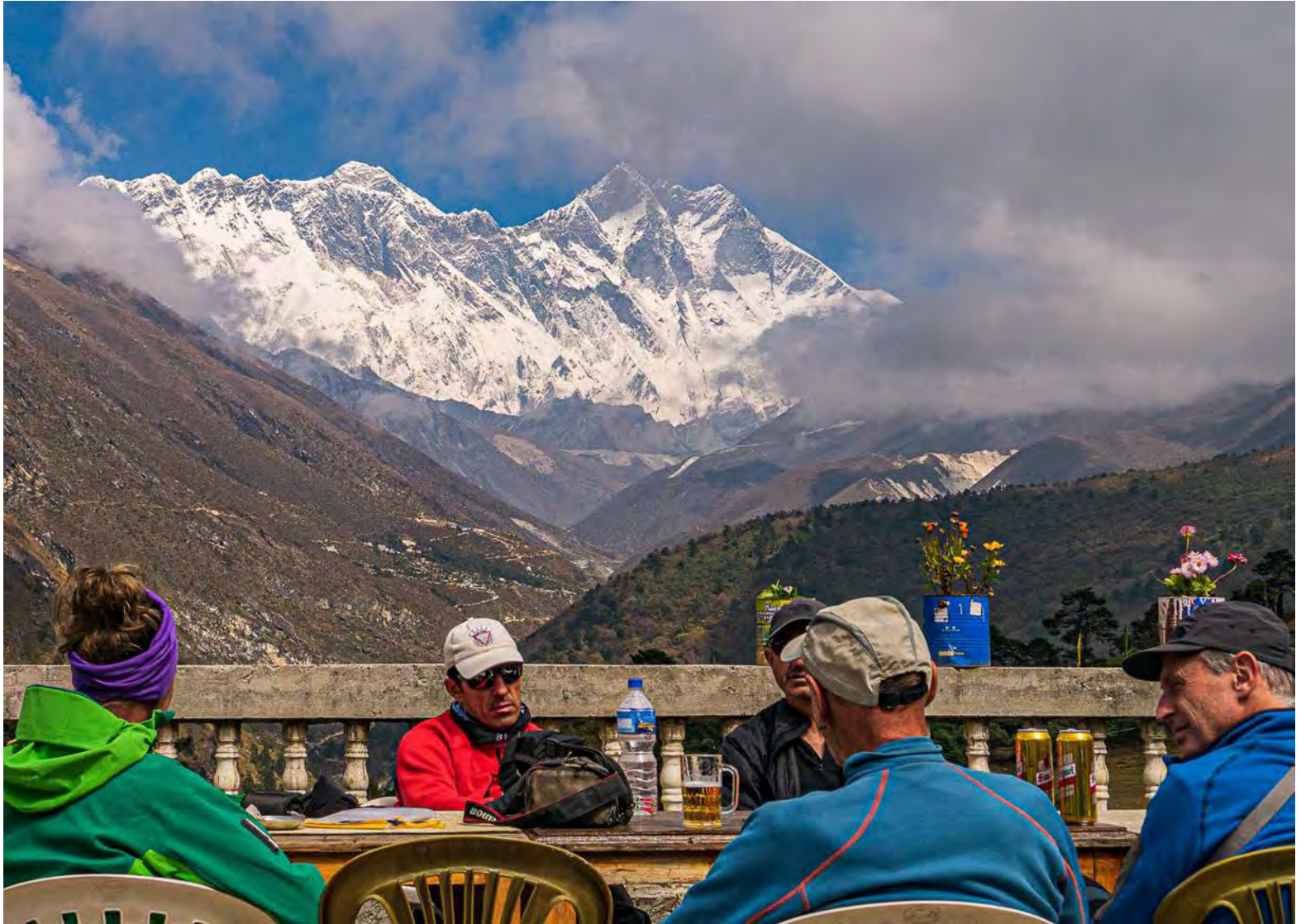
The view from the terrace at Hotel Himalaya in Tengboche