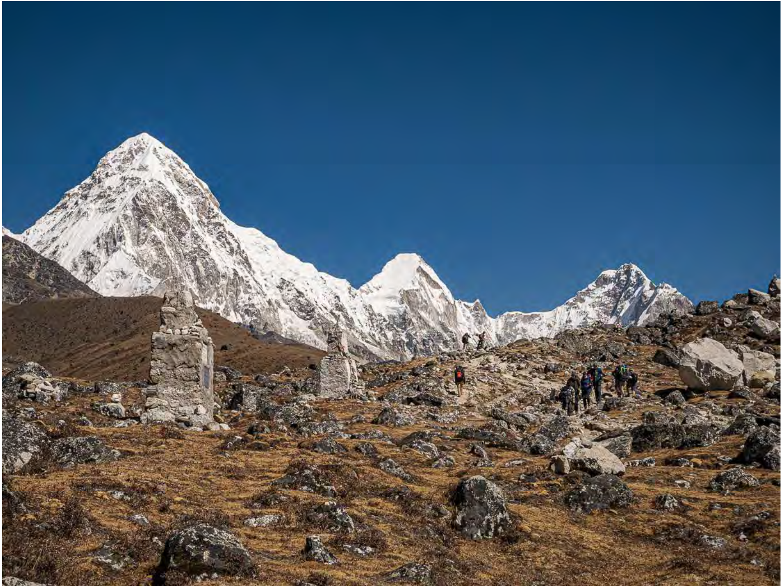
Memorials and tombstones for those that died on Everest