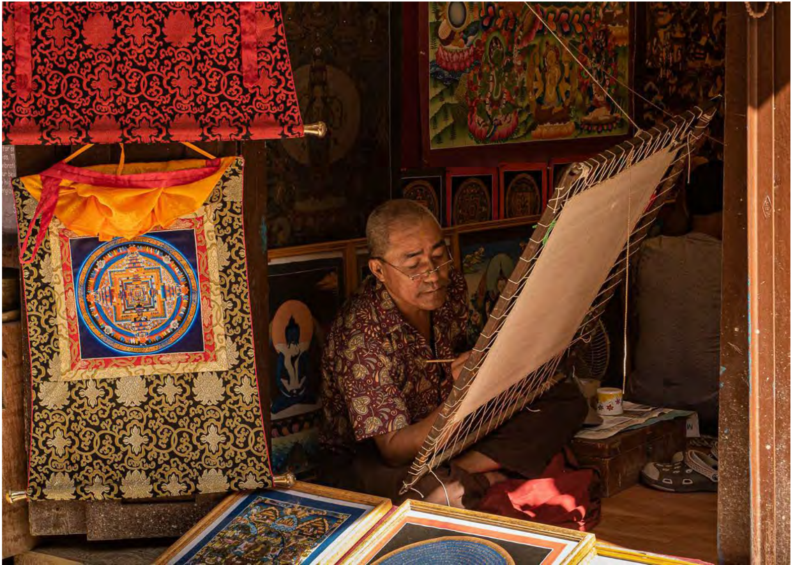
Painting a mandala