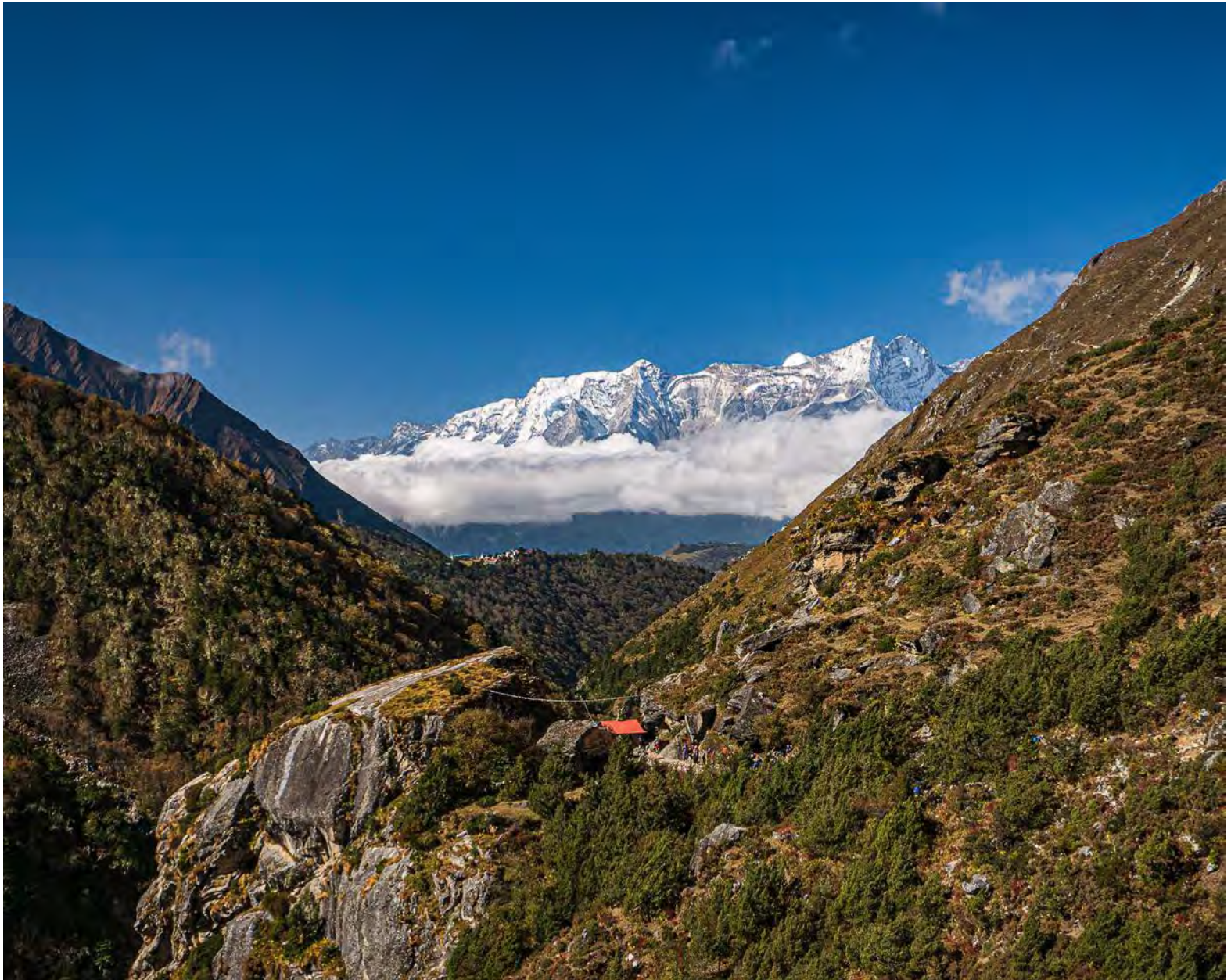
Looking back at Tengboche