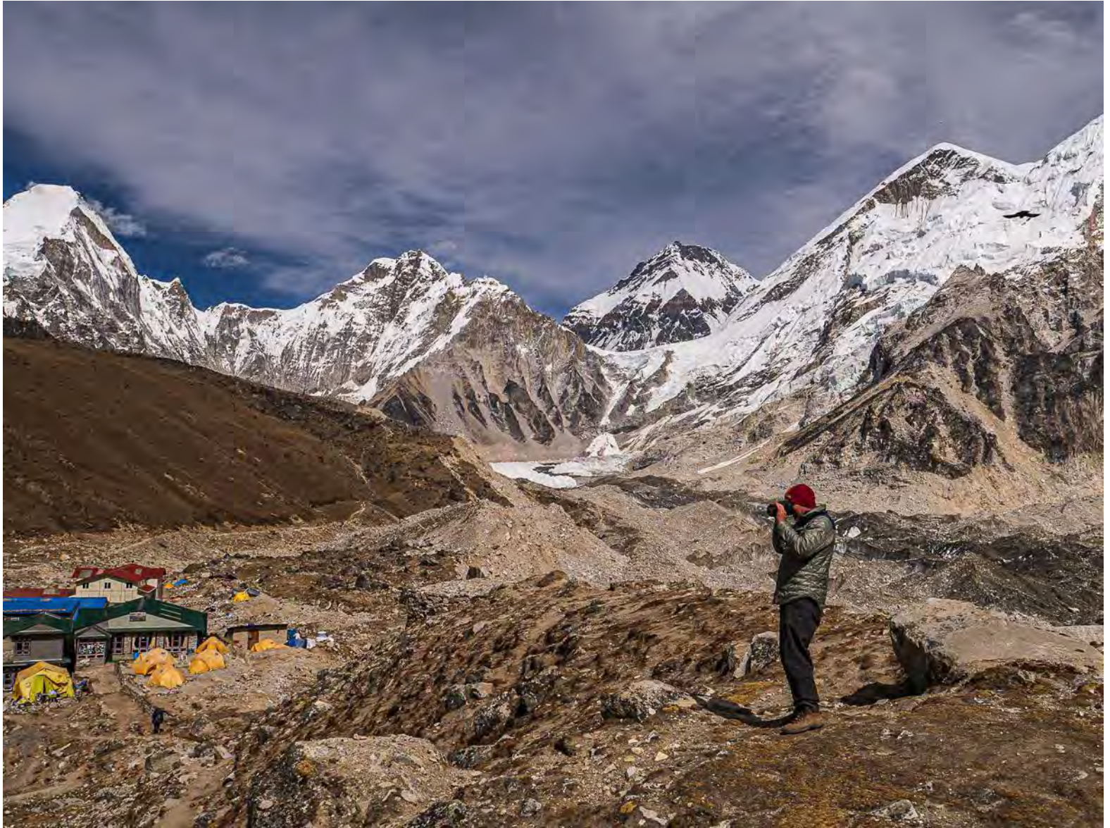
Gorak Shep and Lho La