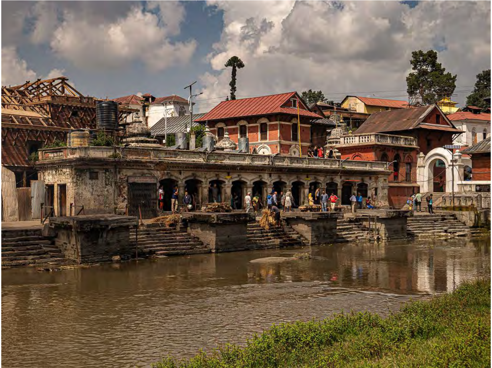
Preparing for a cremation ceremony