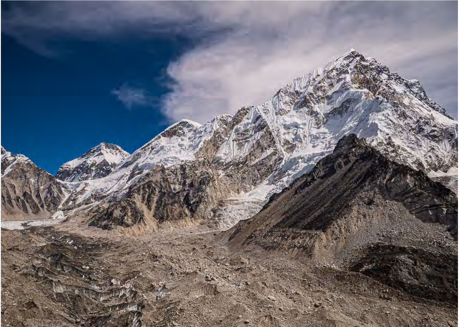
Nuptse and Lho La