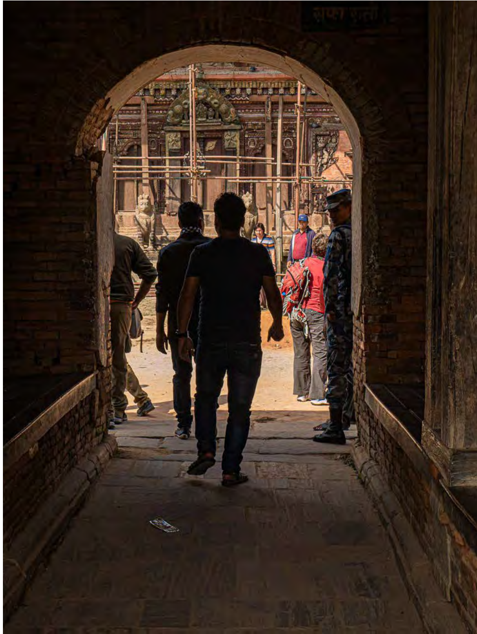
Entrance to Changu Narayan