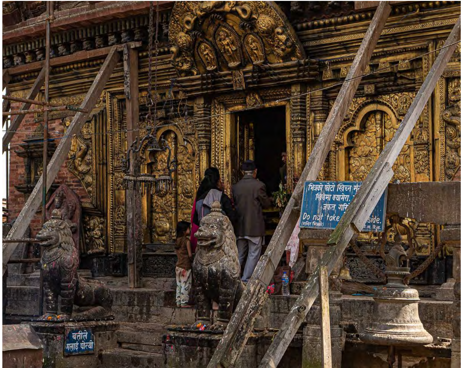
Changu Narayan Temple