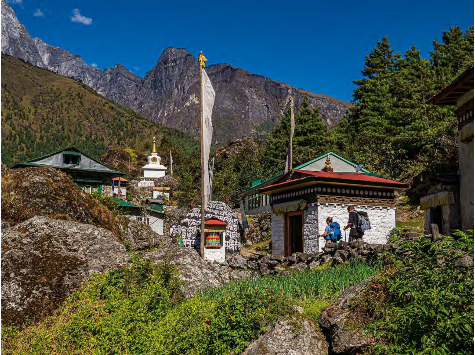
Prayer wheel and painted prayer stones at Chhuthawa