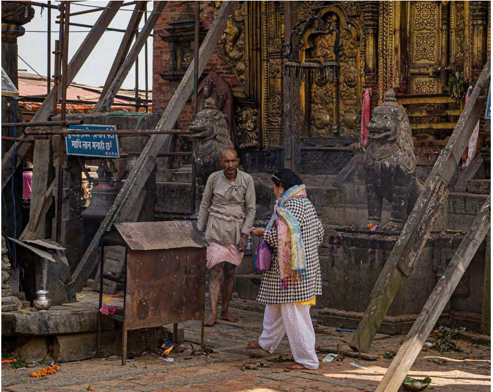
Changu Narayan Temple