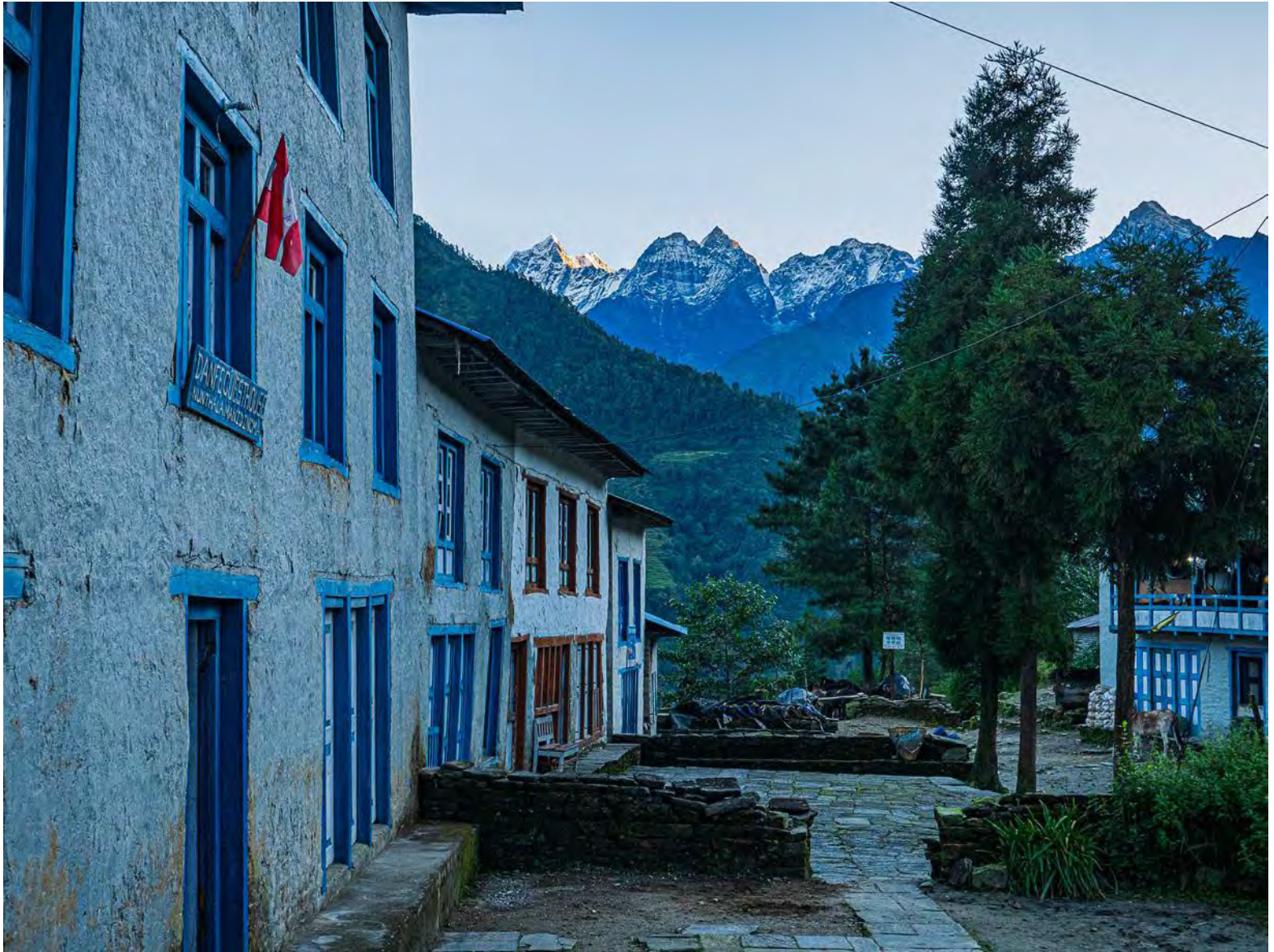
Early morning at Manidingma