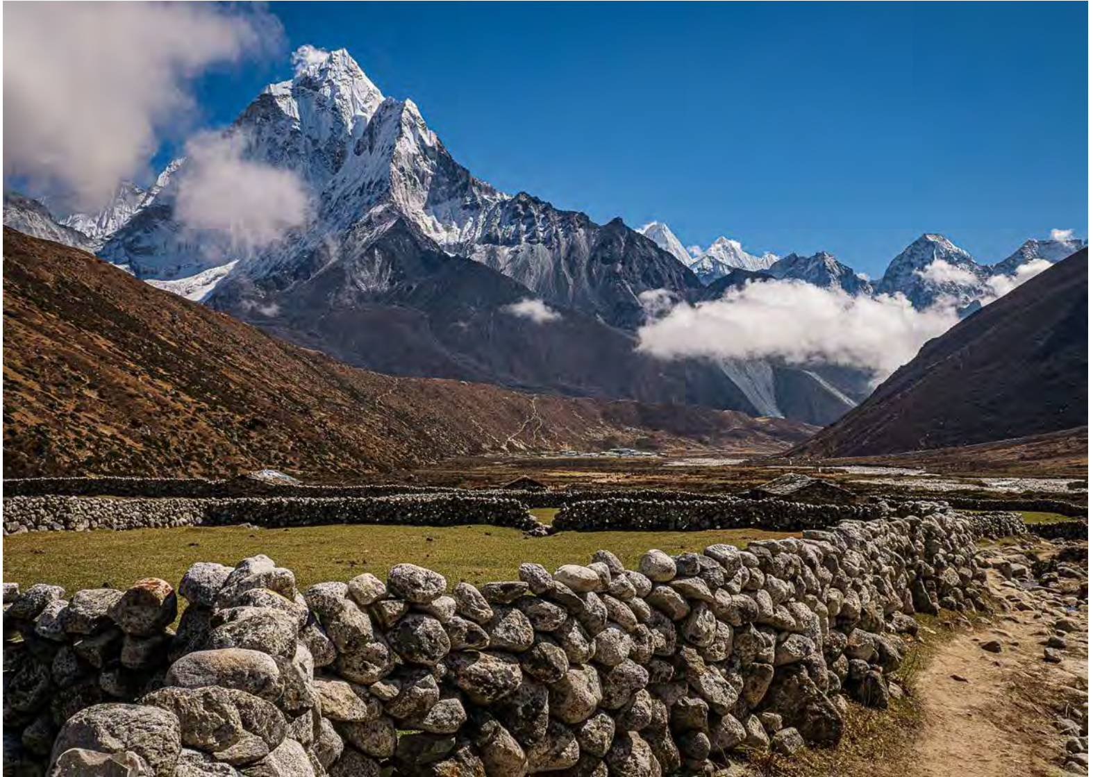
Ama Dablam and Pheriche