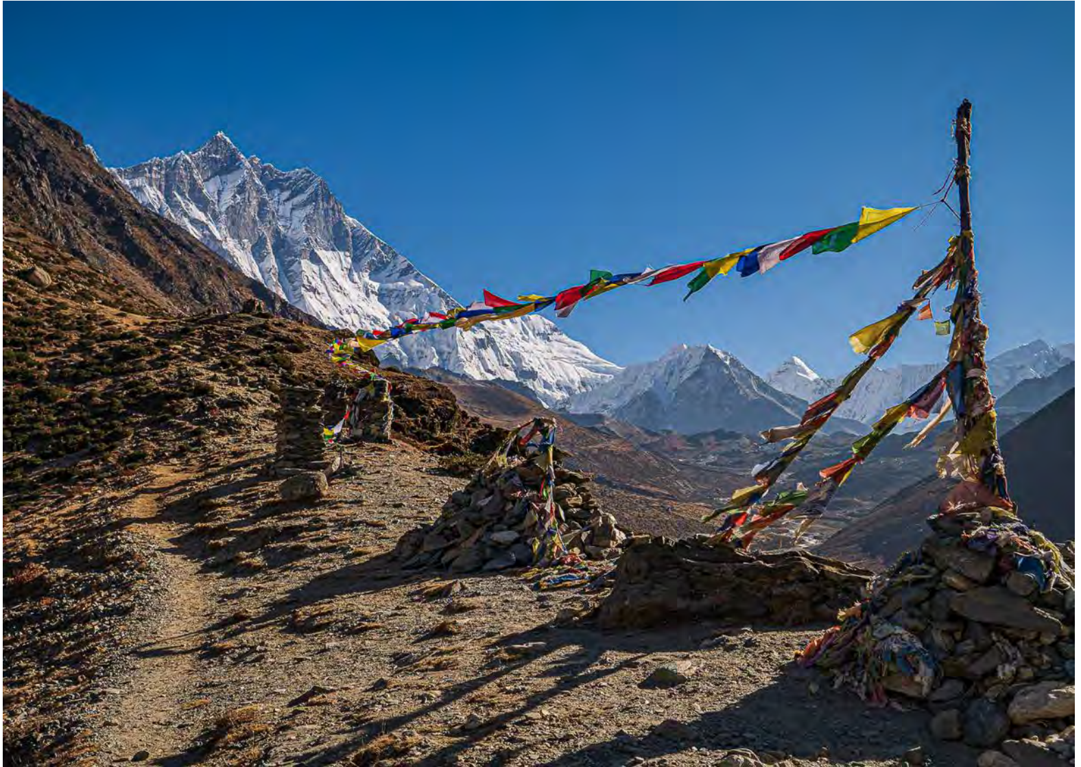
Above Dingboche looking towards Island Peak