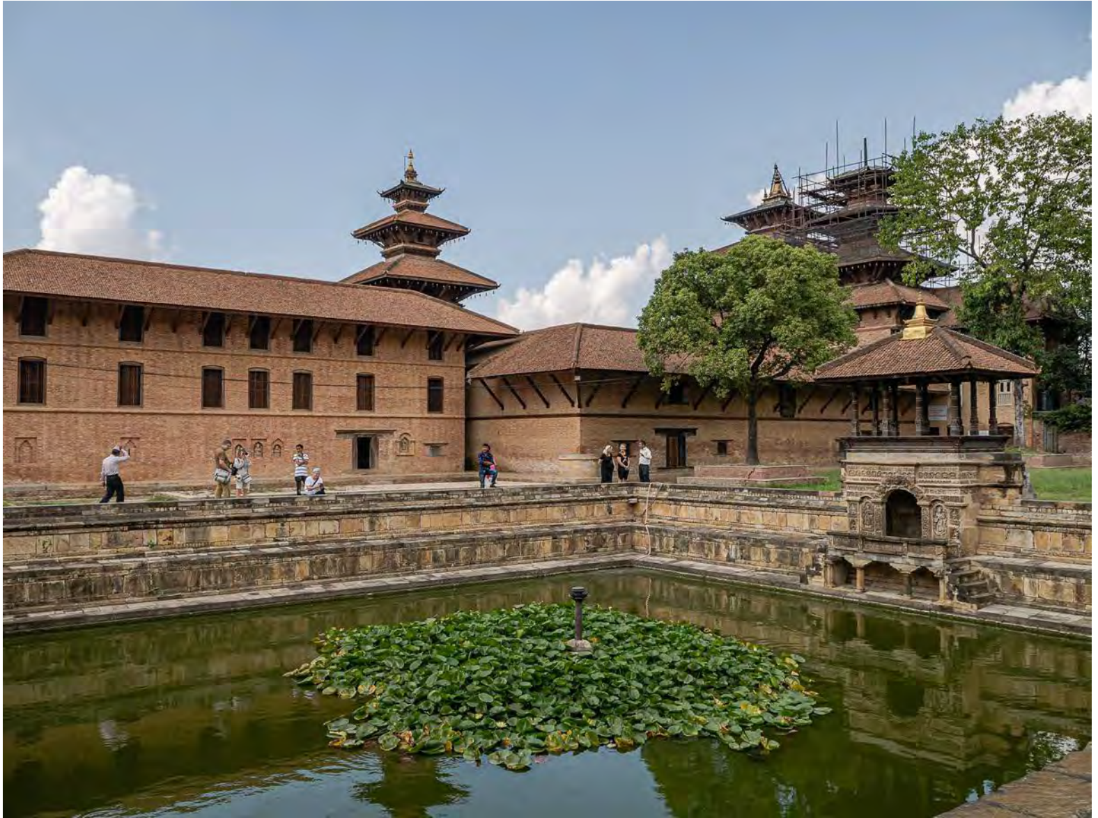
Bhandarkhal Garden and Water Tank