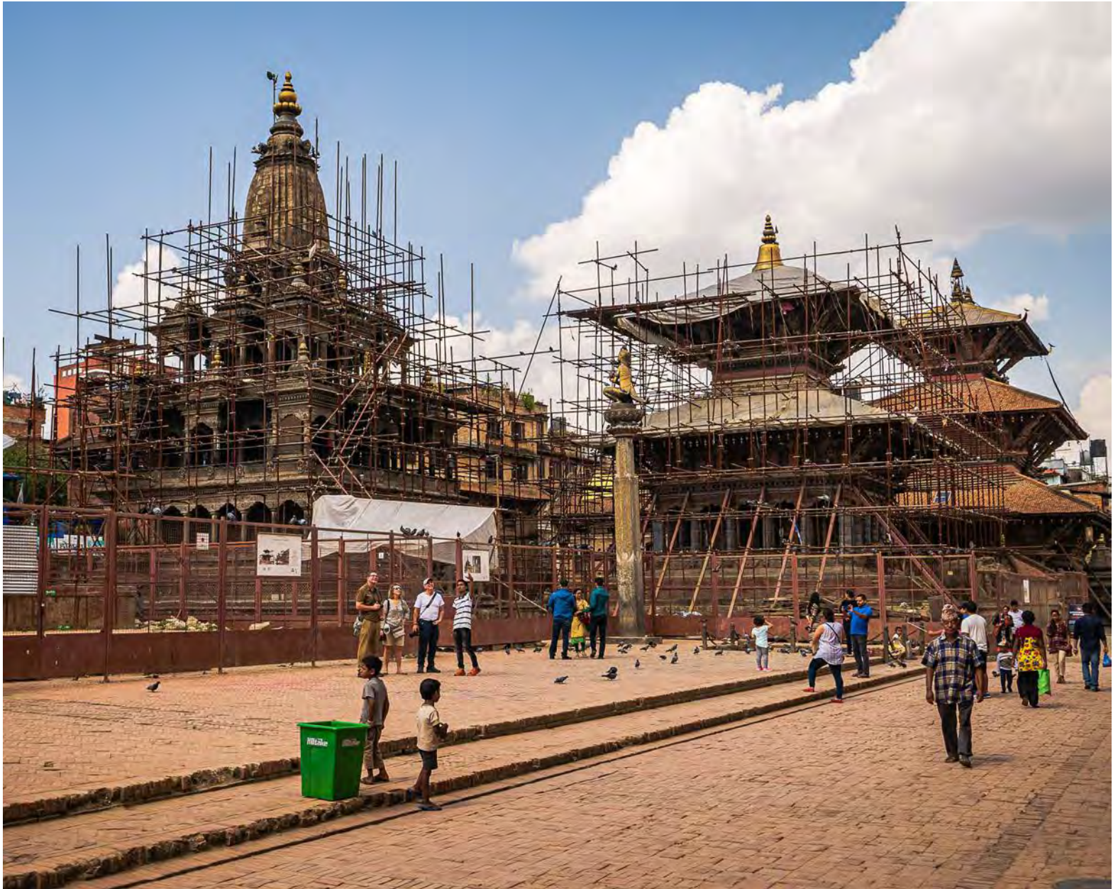
Durbar Square showing the repair of Krishna Mandir and Bhimsen Temple following the 2015 earthquake