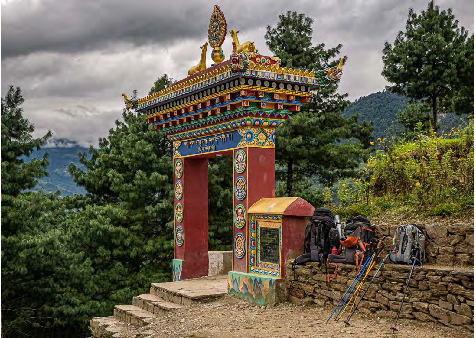
The entrance to the monastery at Kharikhola