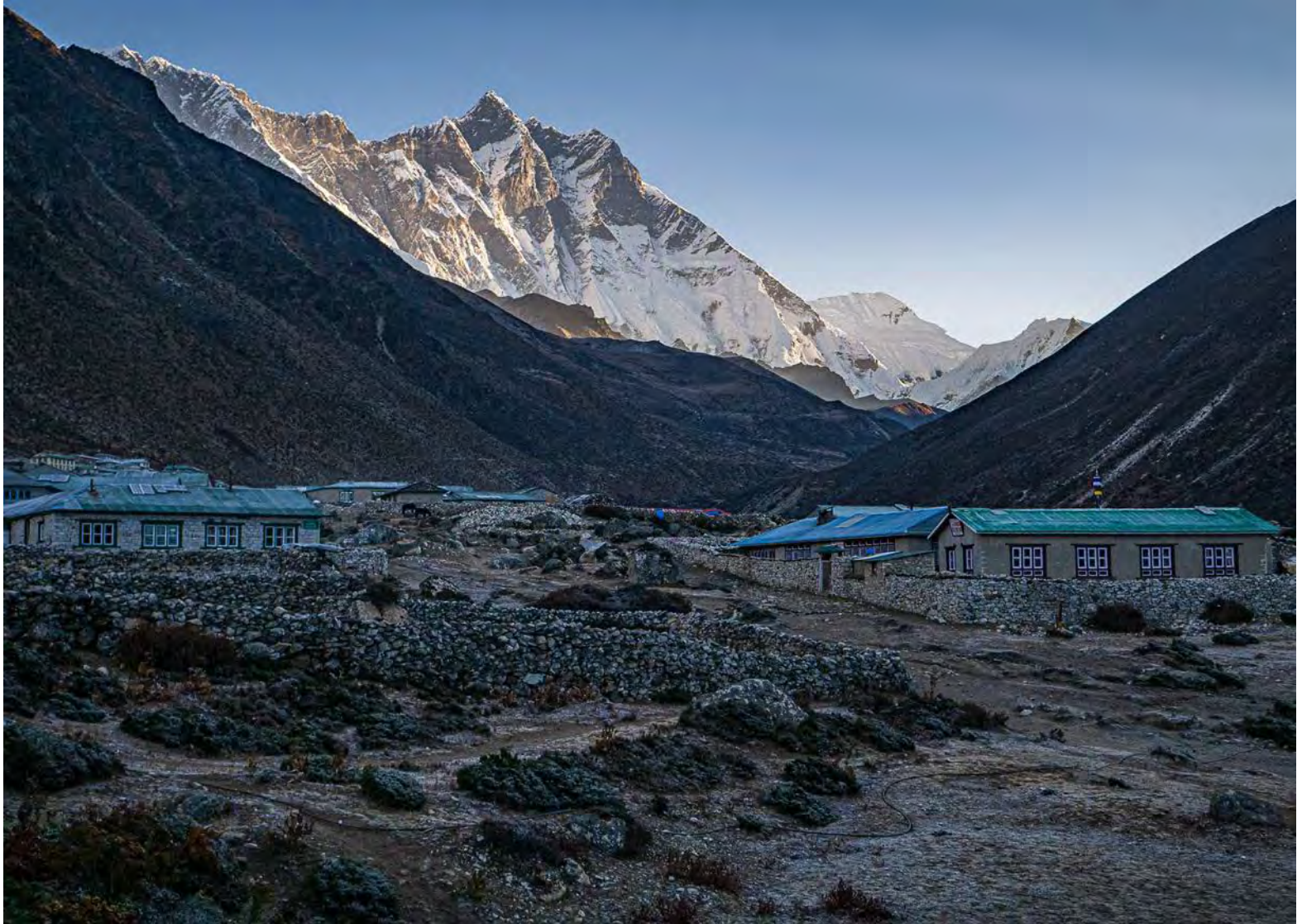
Sunrise at Dingboche