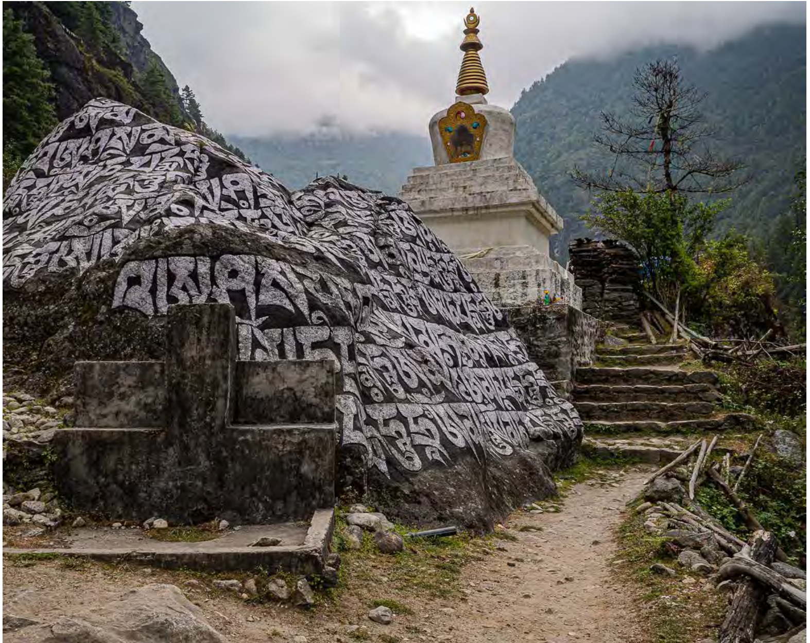
Prayer stone and Stupa