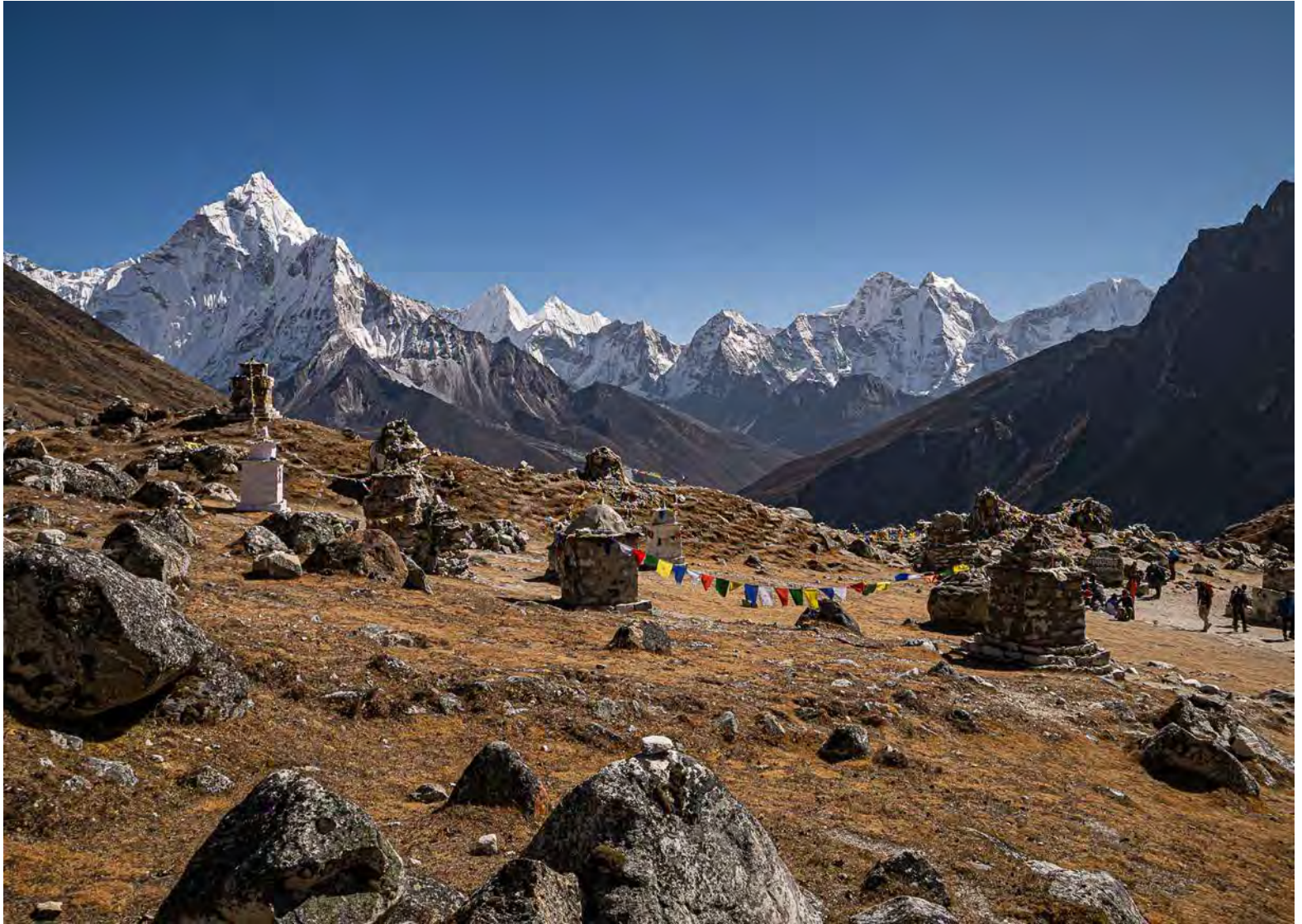
Memorials and tombstones above Thukla