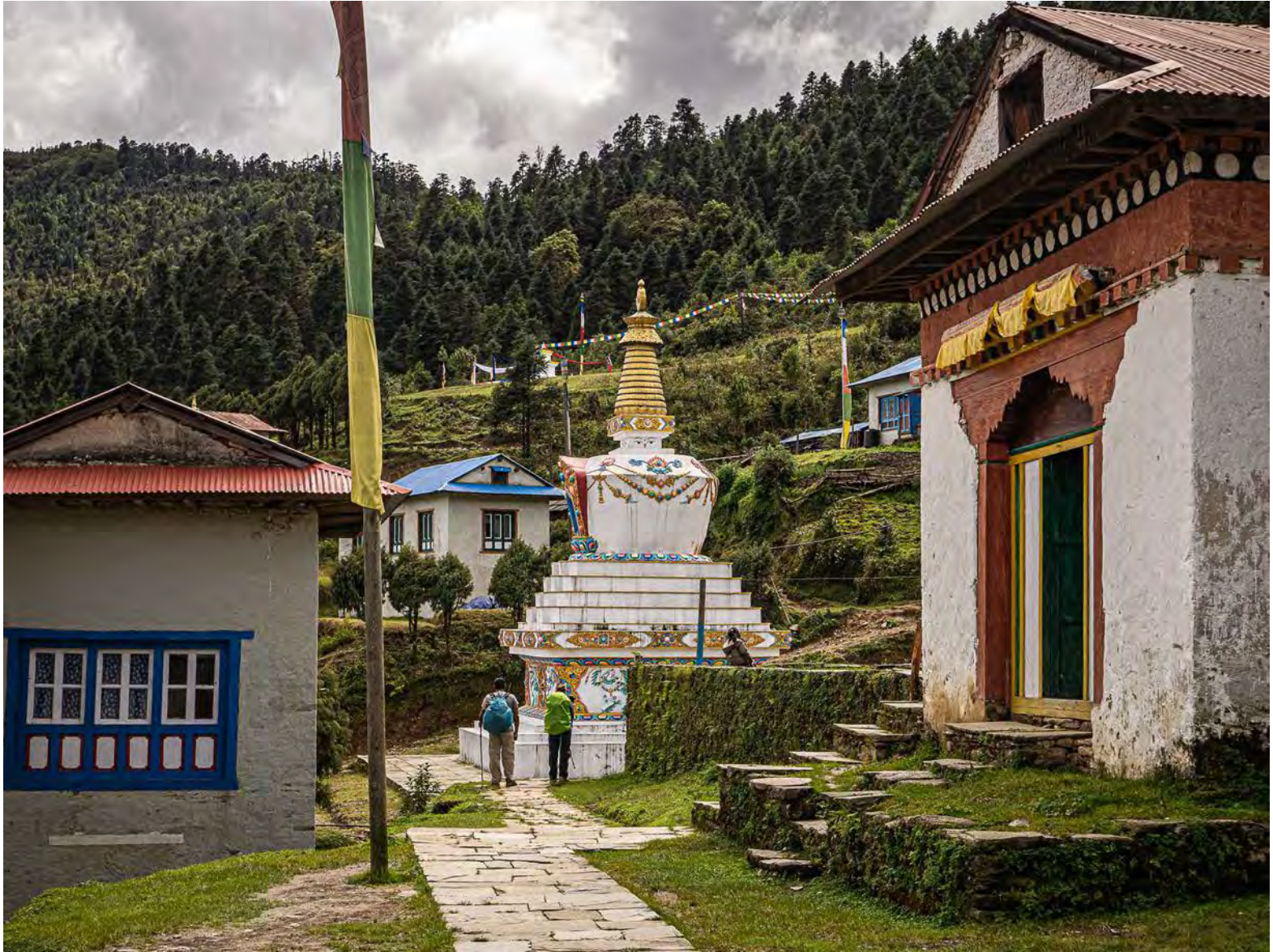
The monastery at Taksindu