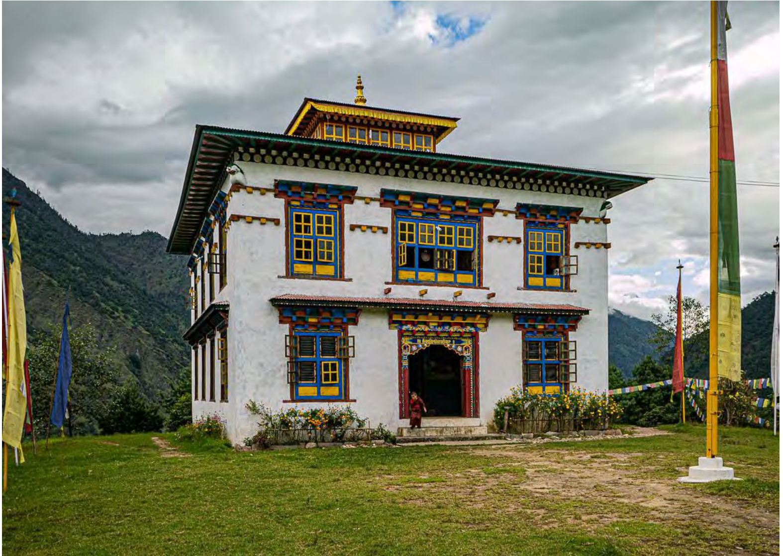
The monastery at Kharikhola