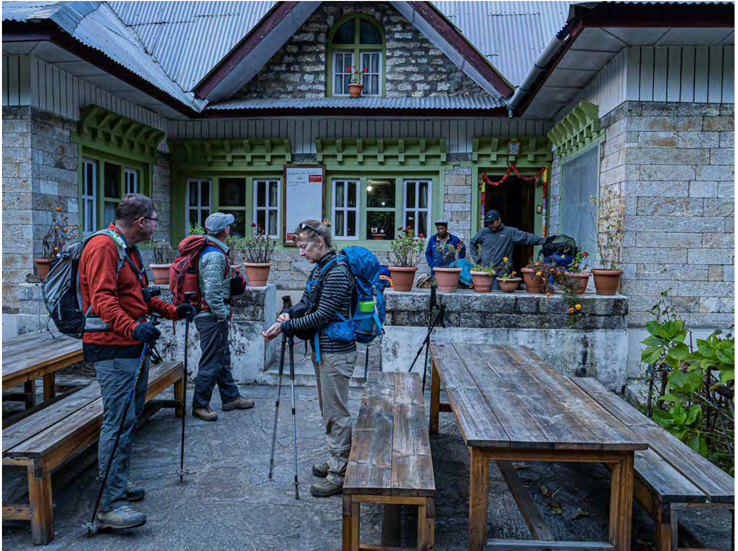
Early morning at Nirvana Lodge in Jorsalle