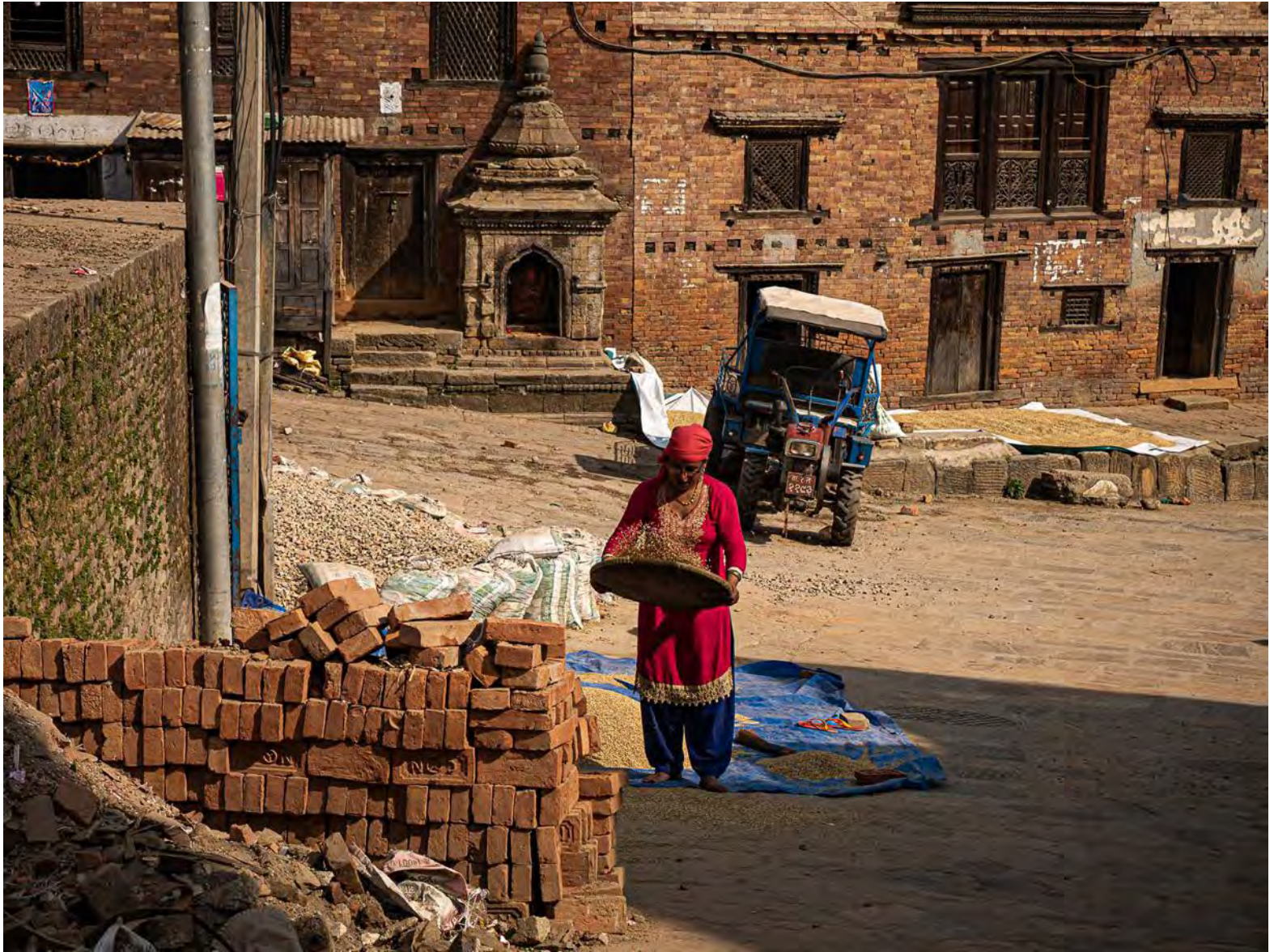
Separating the grain from the chaff