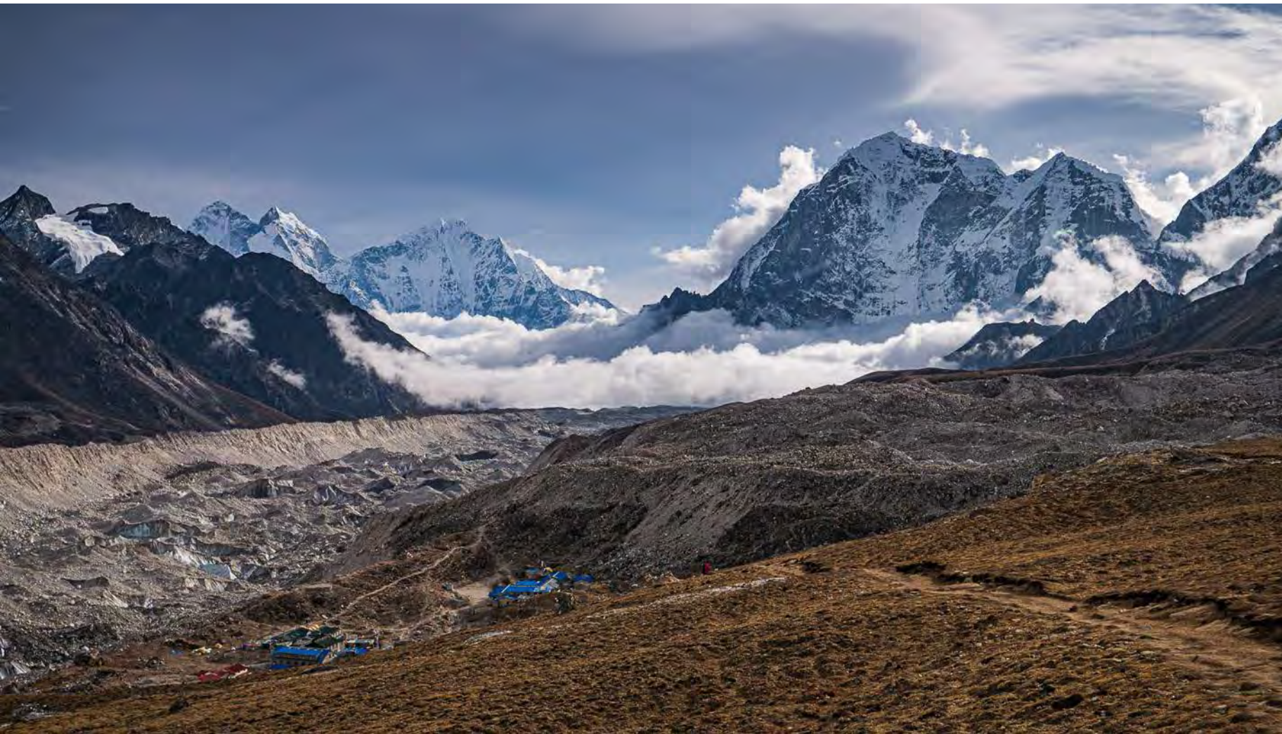
Nepal - Kathmandu and the Trek to Everest Base Camp