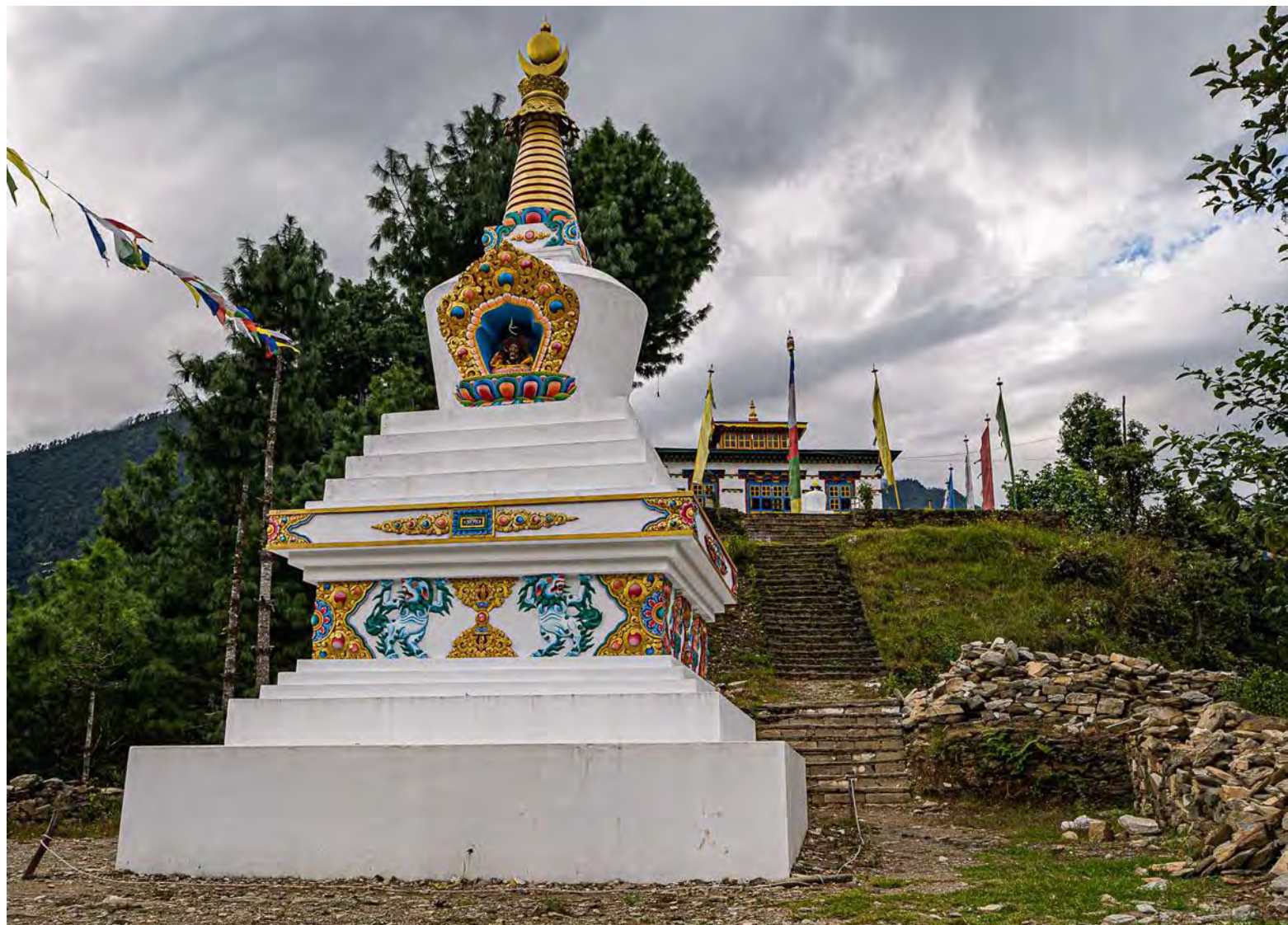
The stupa and monastery at Kharikhola