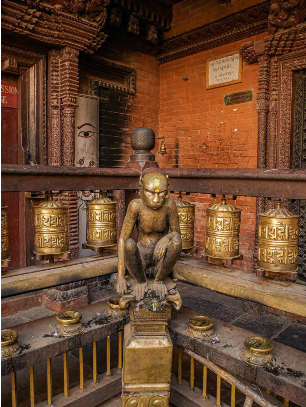
Monkey statue in Patan Golden Temple