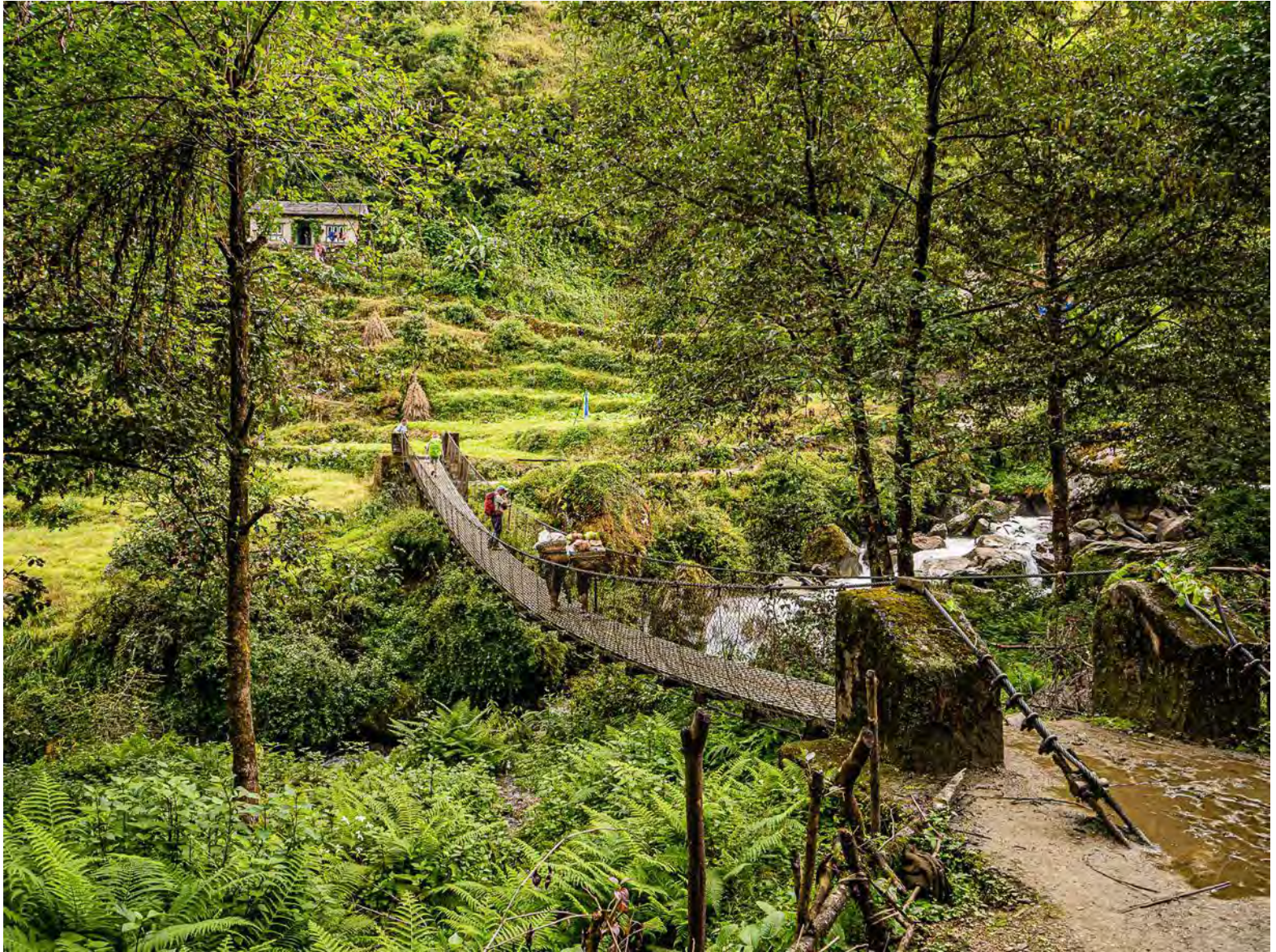
Crossing the Kharikhola on a suspension bridge