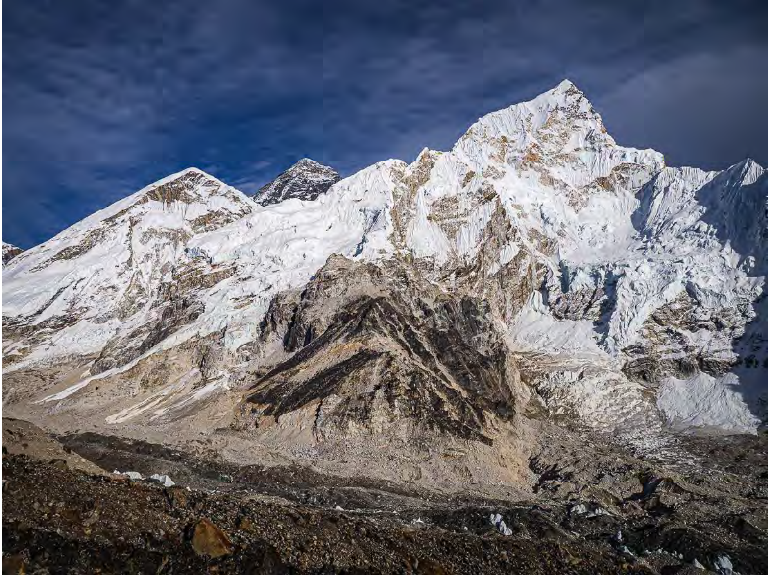
Everest peeking out from behind Nuptse