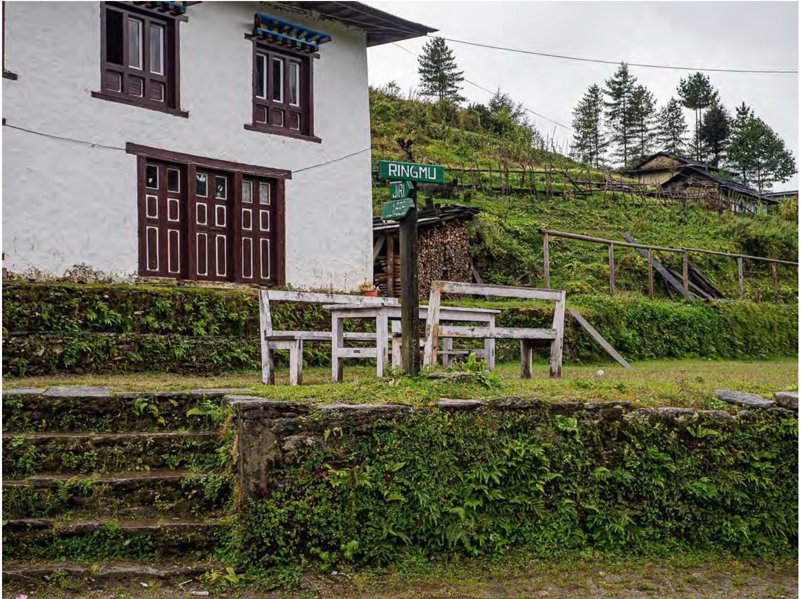
Ringmu sign post