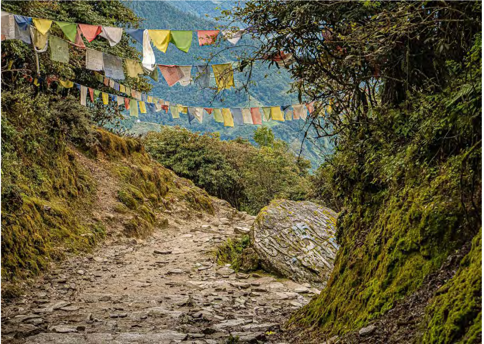
Starting down the pass at Taksindu