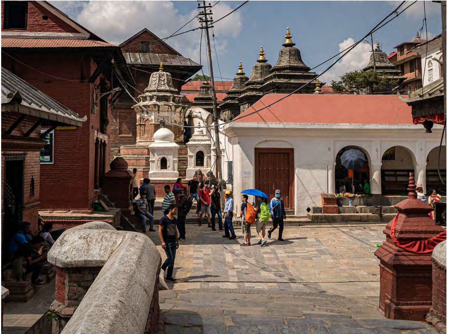
Pashupatinath Temple complex