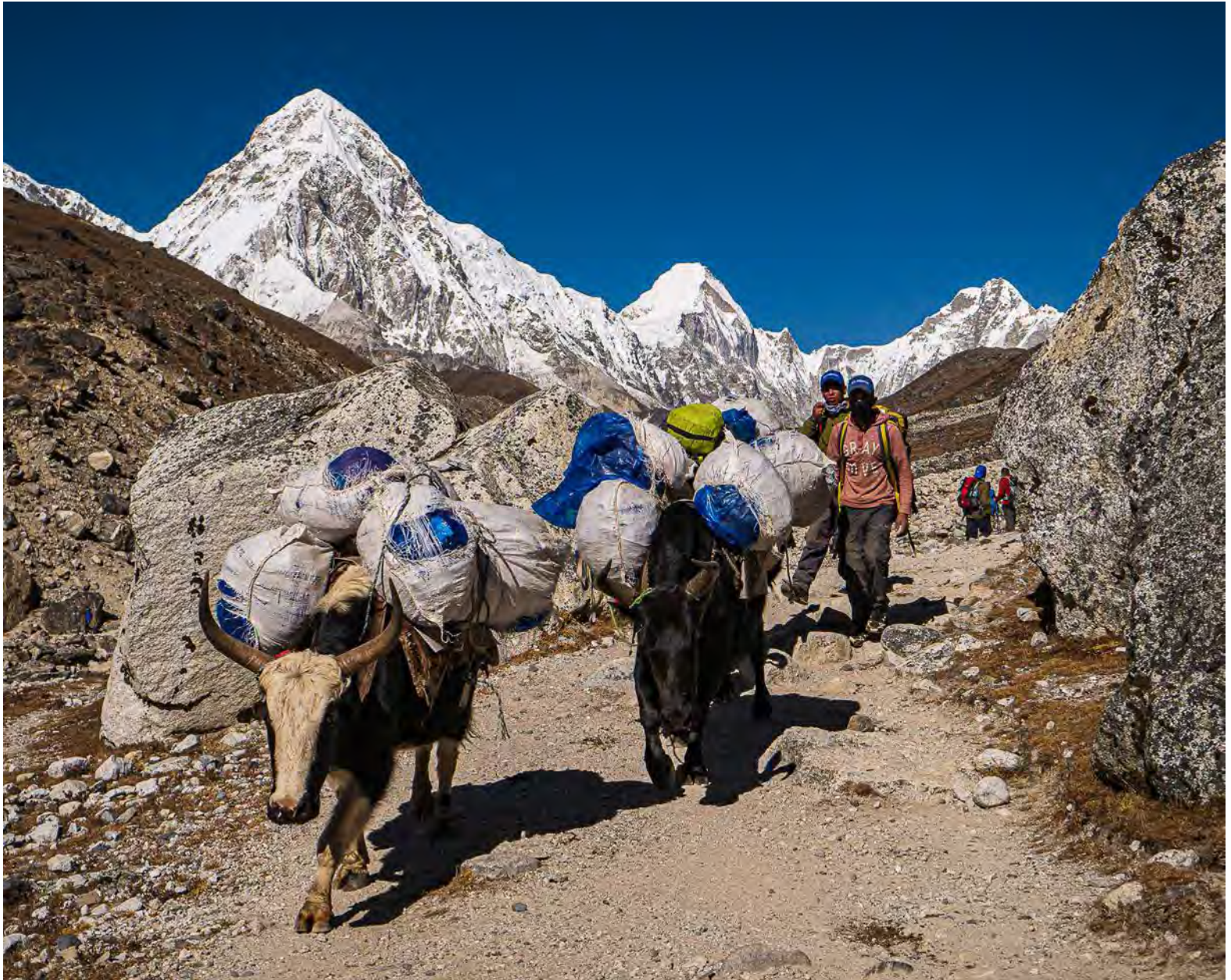
Yaks coming down from the Khumbu valley