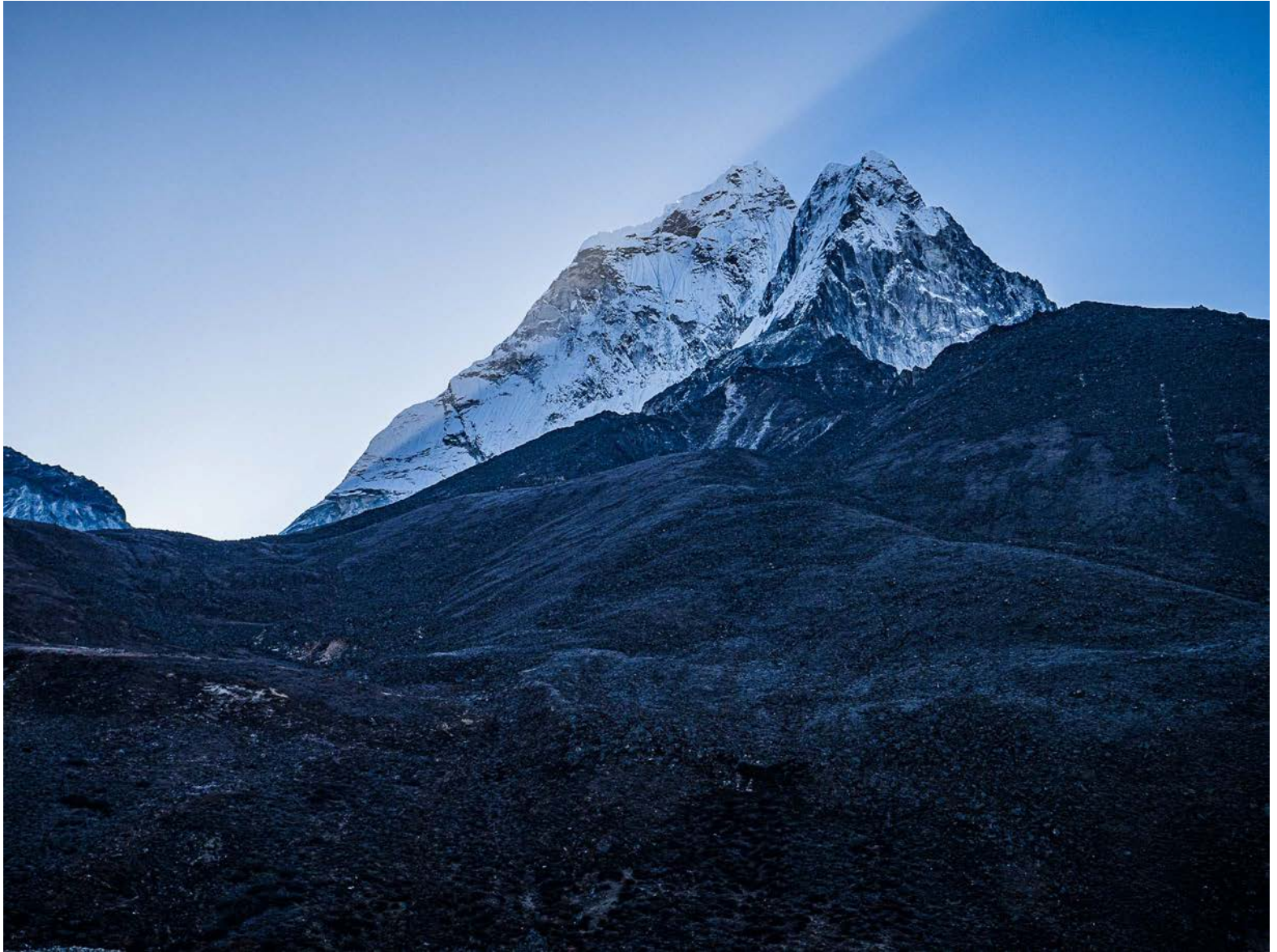
Early morning at Dingboche