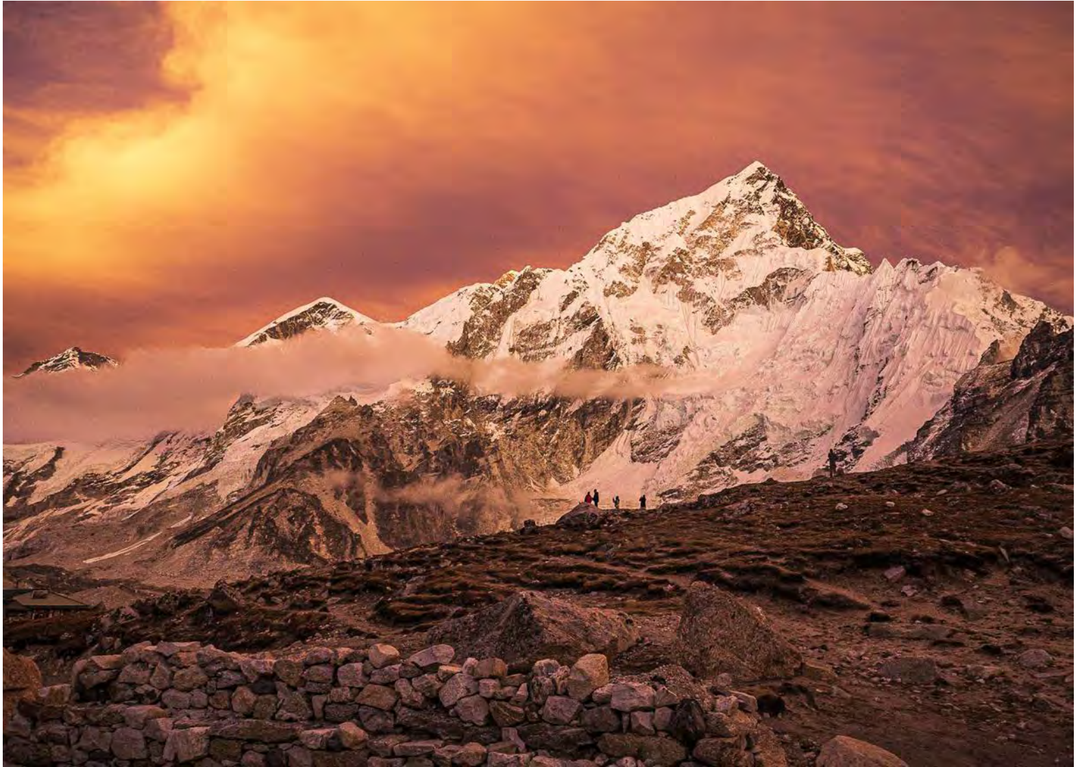
Fantastic sunset over Nuptse at Gorak Shep