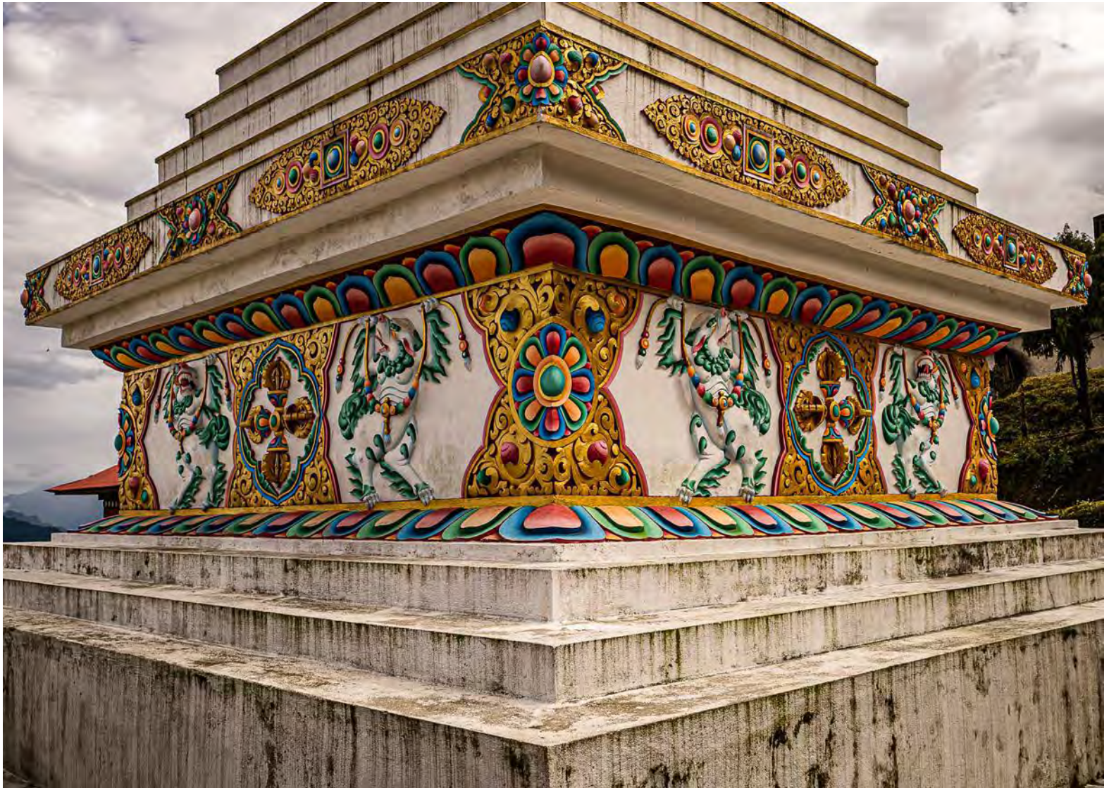
The stupa at Taksindu