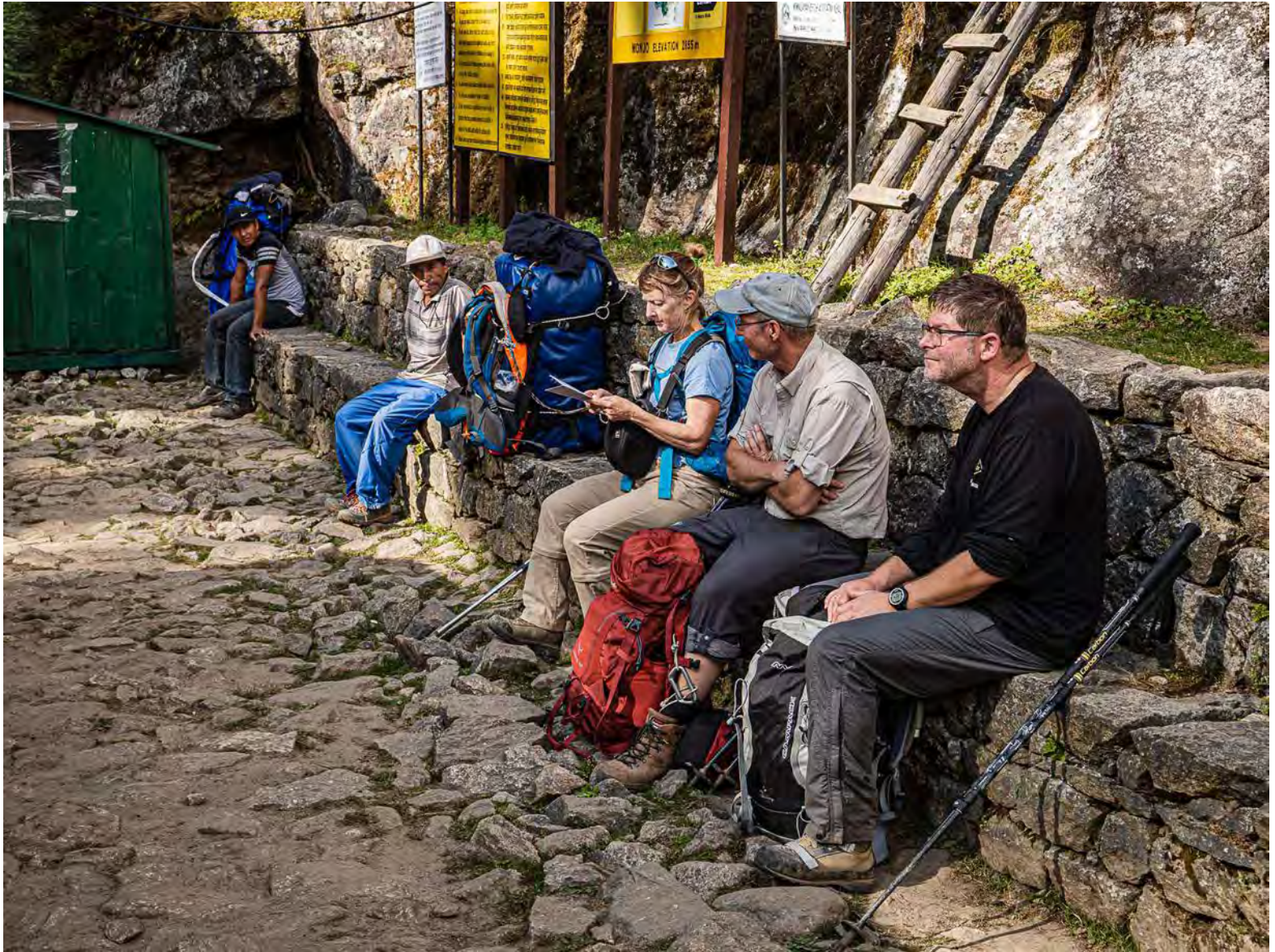
Waiting for our permits at Sagarmatha Park entrance