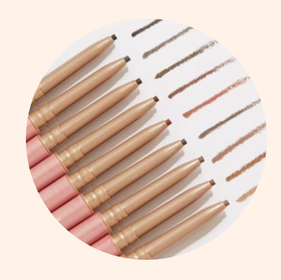
quality & performance

Discover our selection of inclusive shades, often overlooked by other brands.