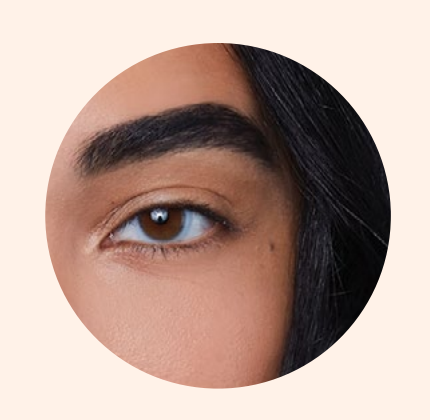
wide-range of shades

Our color-matching guides make it easy to find the perfect shade to enhance your look.