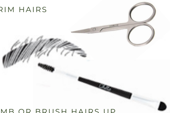
COMB OR BRUSH HAIRS UP

3. Next, use the Chella Slanted Tip Tweezers to gently remove any unwanted hairs below the Brow Map. Simply pull the skin taught and tweeze out hairs in the direction of the natural hair growth.