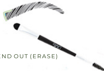
BLEND OUT (ERASE)

4. Finally, blend out (erase) the front area of the Brow Map, that you created with a brow pencil, as shown in blue in the picture below. You can use the Dual Blending Brush pictured below or your finger to blend it away.