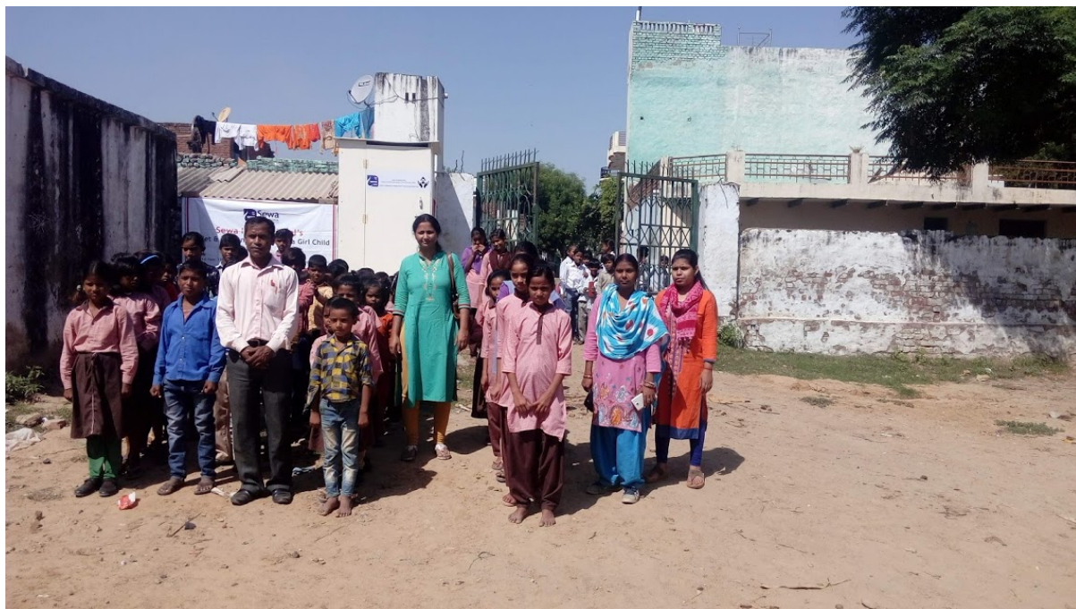
Figure 1: Inauguration of bio-toilet at Upper Primary Government School, Nai ki Saray, Rambagh

During construction, the materials were stolen and sold by a member of the school management. Sewa team managed to get the materials replaced. Also, the villagers and local government bodies helped us ensure strict action against the guilty.