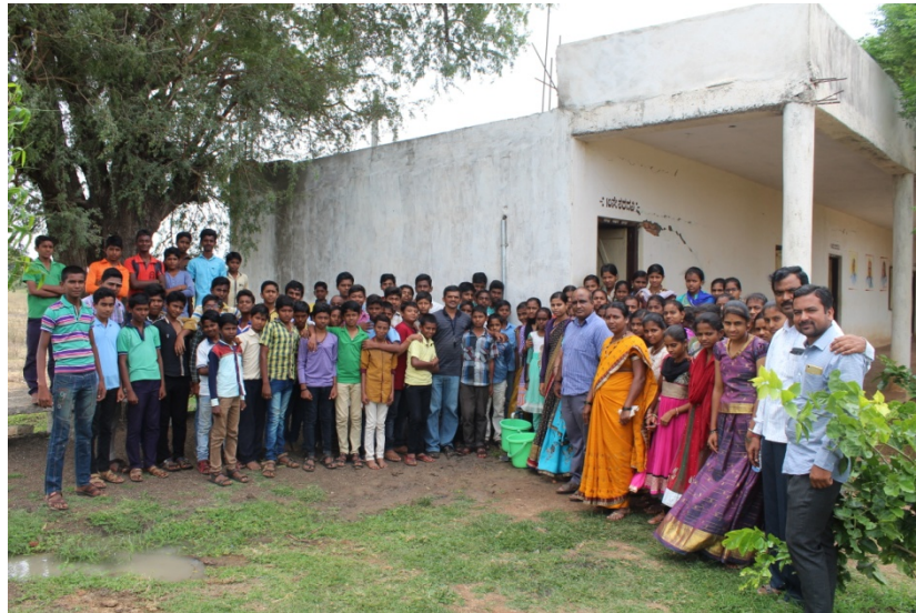
Figure 3: Students and staff of Government School, Navalgund, Karnataka

We have completed the construction of two bio-toilets at Navalgund, Karnataka (See Figure 3 ). These bio-toilets were inaugurated by Jayanthi Ramanan. The students appreciated the efforts of Sewa team and the donors (See Figure 4 ). Before the water connection, children had to walk 1 km to get water from a local railway station. The existing toilets were non-functional. The children are very pleased to have access to sanitation and water facilities.