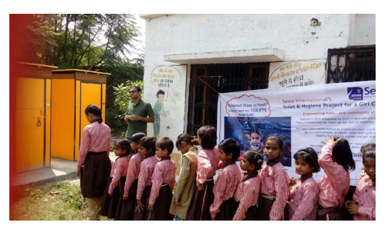
Figure 2: Girls queuing up in front of toilets at a Government School in Vibhuti Khand, Lucknow Rural, UP, India.