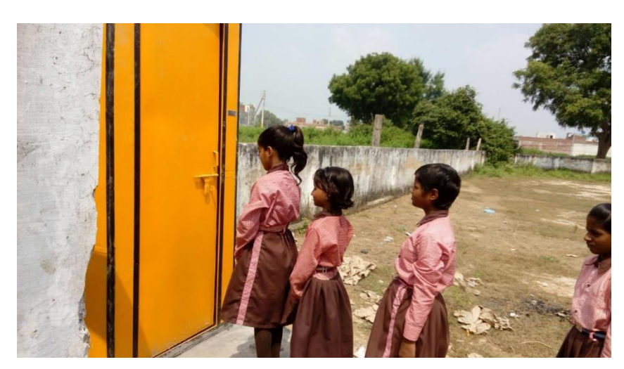
Figure 3: Girls queuing up in front of toilets in Government Schools of

We found that all schools lacked operational toilets and some do not have toilets at all. They are in desperate need of toilets. Rural Lucknow schools are far away from main city, some even 35 kilometers away. It will Chinhut, Lucknow Rural, UP, India. be a challenge to install toilets in