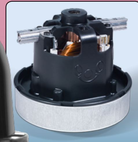
Numatic high efficiency long life motor