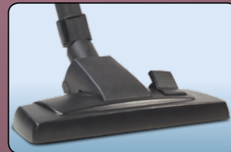
ProFlo high efficiency combination floor tool