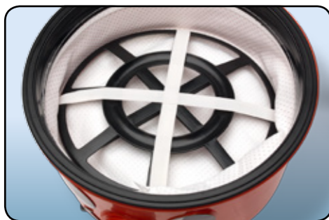
TriTex and HepaFlo high efficiency filtration system