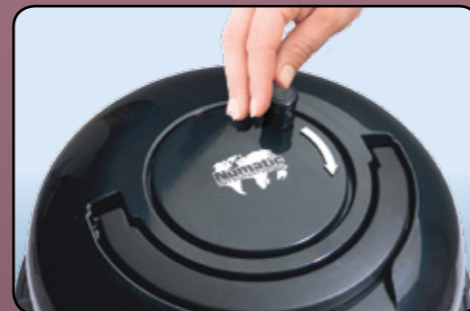
10m cable rewind and storage system