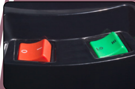
2 Speed performance system