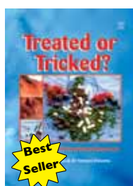
"Treated or Tricked: Alternative Health Therapies Diagnosed" (Book, E-Book, DVD)

The above resources are available, along with resources on other cults and spiritual deceptions, from our secure web shop. Bible Studies without a cult bias are also available - please inquire for details. There are also a variety of articles of interest, plus prayer guidelines for breaking cult and other curses for free download.