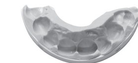
Finished Splint Ready for Wear

Replace QuickSplint® on patient's teeth and ensure there is a stable fit and retention to the teeth to avoid possible displacement with use. QuickSplint is now ready for use!