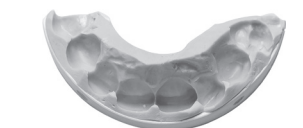
Finished Splint Ready for Wear

Trim any excess material with a sharp blade. Use the tray as your guide.