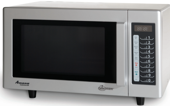
Model RMS10TS shown