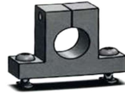
DETAIL 3 STANCHION