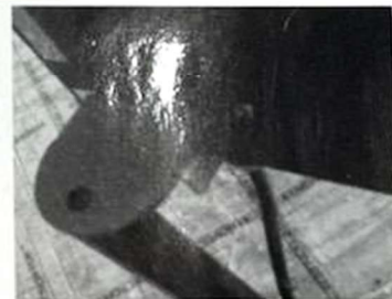
DETAIL 1 LIGHT BRACKET ASSEMBLY