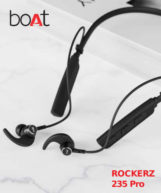
ROCKERZ 235 Pro