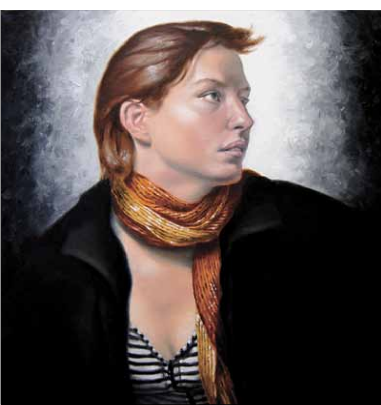
The Lightning, oil on canvas, 20 x 20" (50 x 50cm)