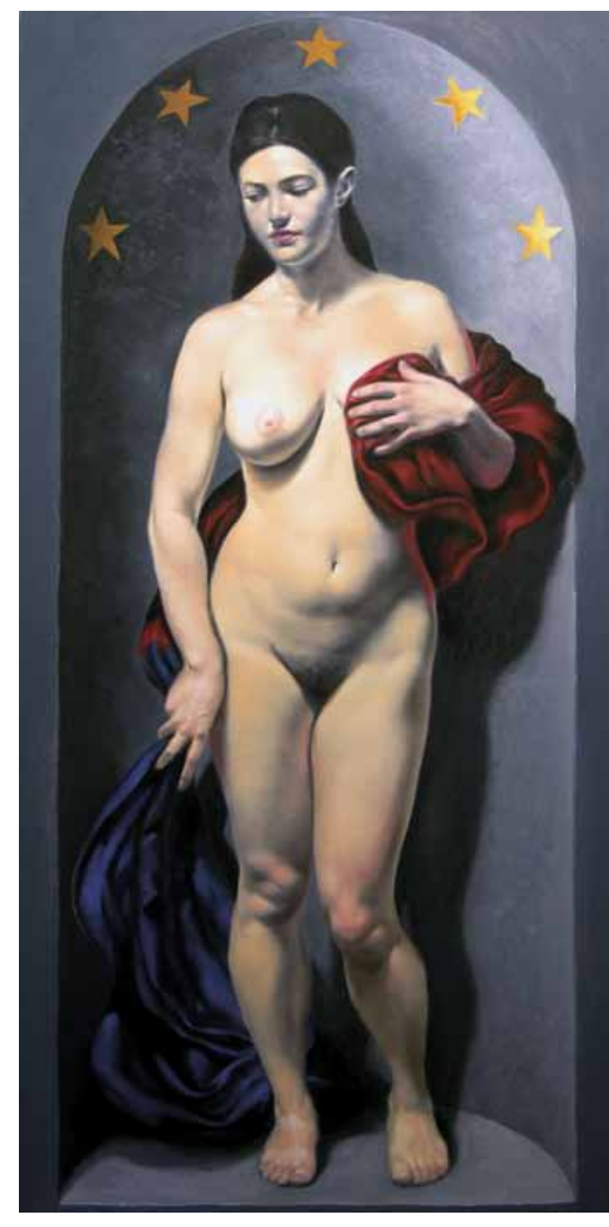
Our Lady of the Five Stars, 72 x 36" (183 x 91cm) Images of this painting in progress appeared in the first and second articles in this series. I finally finished the enormous background area — I find painting backgrounds much less fun because there is no model to chat with.