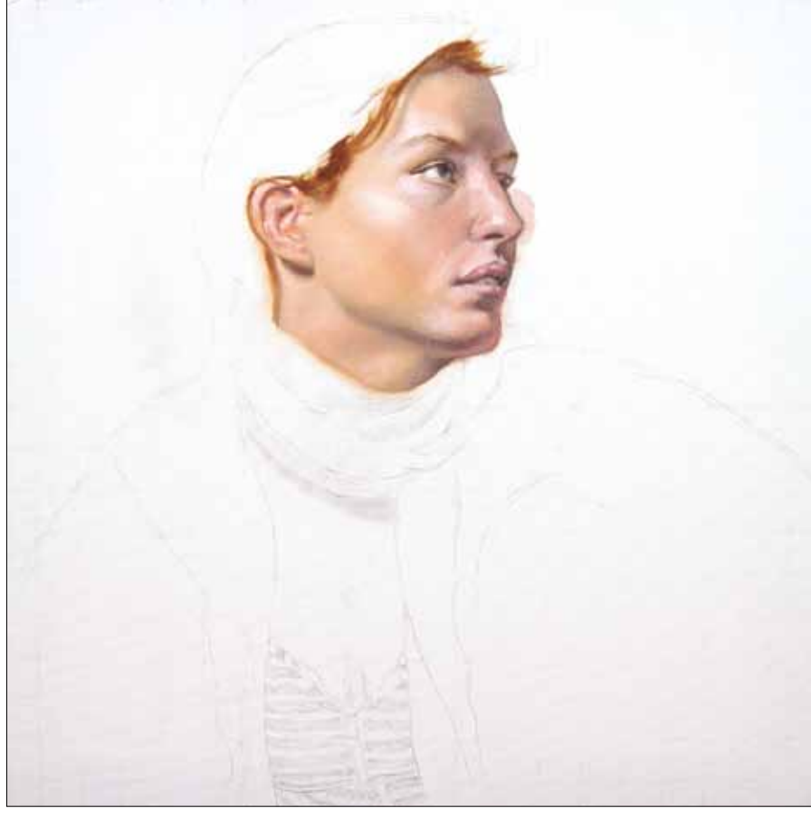
The Lightning, after the first sitting.