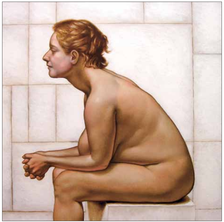
Integrity, oil on canvas, 36 x 36" (91 x 91cm)

That wraps it up for this series. It's been a pleasure and an honor spending a little time with you, and I hope we'll meet up again sometime, somewhere along the way. □