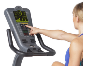
PATENTED CaloriePUMP™ MONITOR