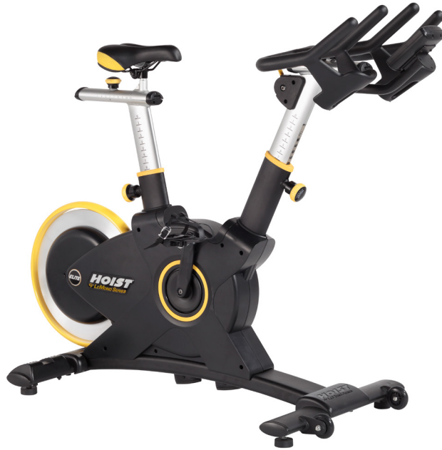
BUILT-IN CONSOLE WITH CaloriePUMP™