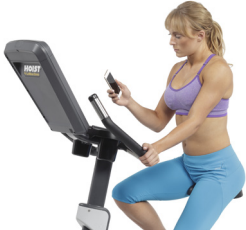
BLUETOOTH LE ENABLED CONSOLE