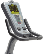
BLUETOOTH LE ENABLED CONSOLE