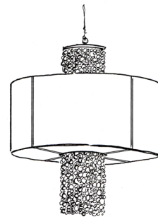
ROUND CHANDELIER 5009