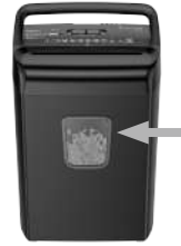
Empty wastebasket when the window is filled