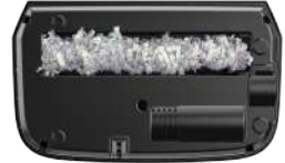
If the wastebasket becomes full and is not emptied, it will cause the paper to clog the machine's output