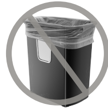
No Trash bag

If using a plastic bag to line the wastebasket, please remove it. This may cause the shredder not to operate properly