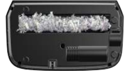
If the wastebasket becomes full and is not emptied, it will cause the paper to clog the machine's output