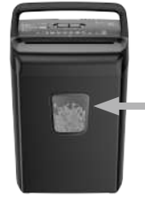
Empty wastebasket when the window is filled