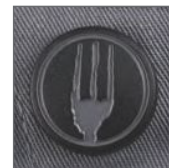
Branded top snap