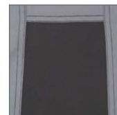
Cool Vent™ back detail

Item: VSSS-GBC (gray w/ black contrast) Sizes: S-2XL