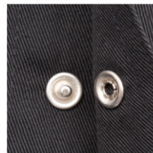
Hidden metal snaps