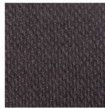
Cool Vent™ back yoke