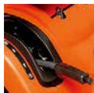
Gas-assisted mower lift lever