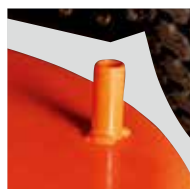
Deck cleaning pipe for connecting water hose