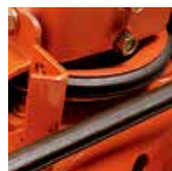
Ultra-durable, long-life hexagonal belt (Actual belt is covered.)