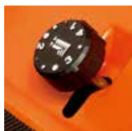
Easy reach cutting height adjustment dial