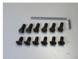
Steering mounting bolt

(Already installed in the boss body) (Already installed in the boss body) (Already installed in the boss body)