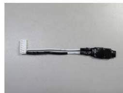
Air back canceller low head bolt M6x12