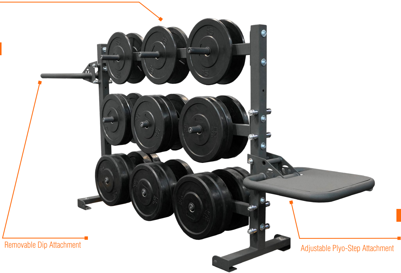
Removable Dip Attachment

Eighteen fully welded solid steel weight shafts with molded nylon sleeves hold 45 lb weight plates in every position