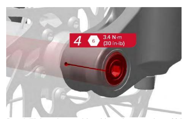
Step 4: Tighten the non-drive side wedge expander to 30 in-lb (3.4Nm).