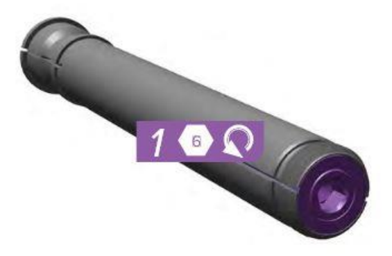
Step 1: Turn the non-drive side wedge expander counter clockwise until it no longer clicks.

1.3 Next, secure the front wheel into the front suspension dropouts with included 20mm through axle.