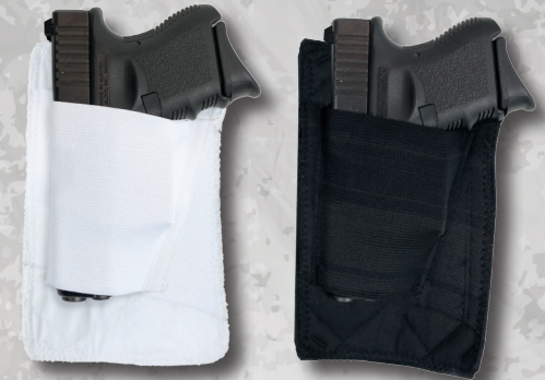
AVAILABLE IN BLACK OR WHITE, RIGHT OR LEFT-HANDED