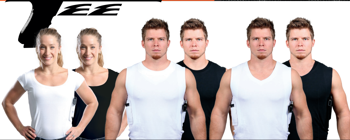
WOMEN'S SCOOP NECK