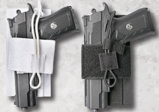
NEW UNIVERSAL HOLSTERS