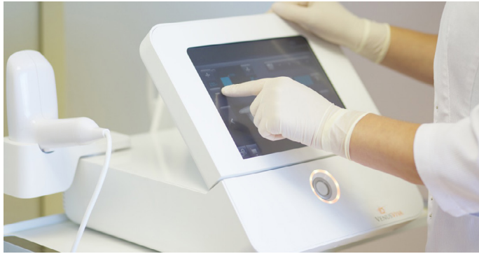
Venus Viva skin resurfacing system. One device. All skin types. All skin resurfacing.

That's not to say we don't offer any EBTs to our clients. We offer a mild form of Radio Frequency called Venus Viva , fantastic for its collagen stimulation and efficacy at skin resurfacing. To some degree, there is a touch of skin tightening, but what Venus Viva is best at is tending to skin pigmentation.