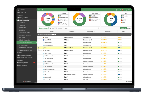
Visibility with FOS Application Signatures