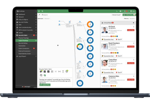
Intuitive easy to use view into the network and endpoint vulnerabilities