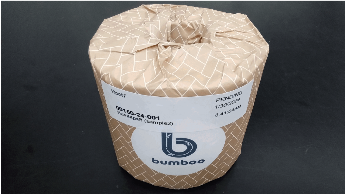
Figure 1. Login Sample Photos Bumbtp48 (sample2)