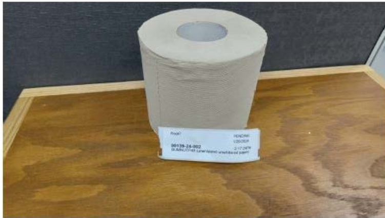
Figure 2. Login Sample Photos BUMNUTP48 (unwrapped unwhitened paper)