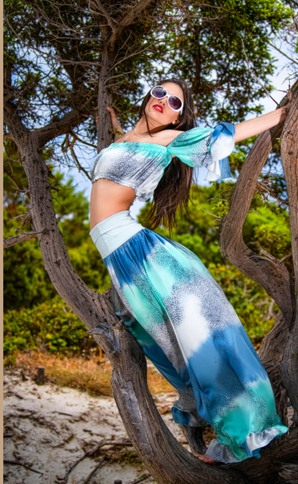
RIGHT: the Emerald Outfit