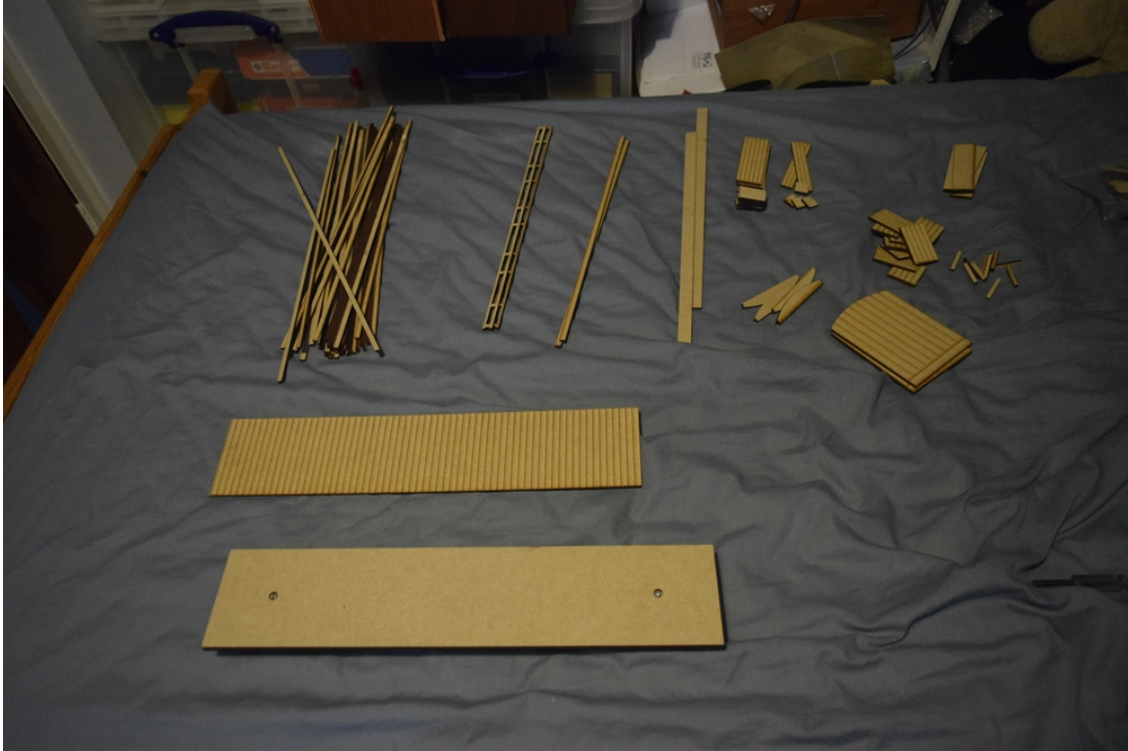
The Kit as you will receive it.