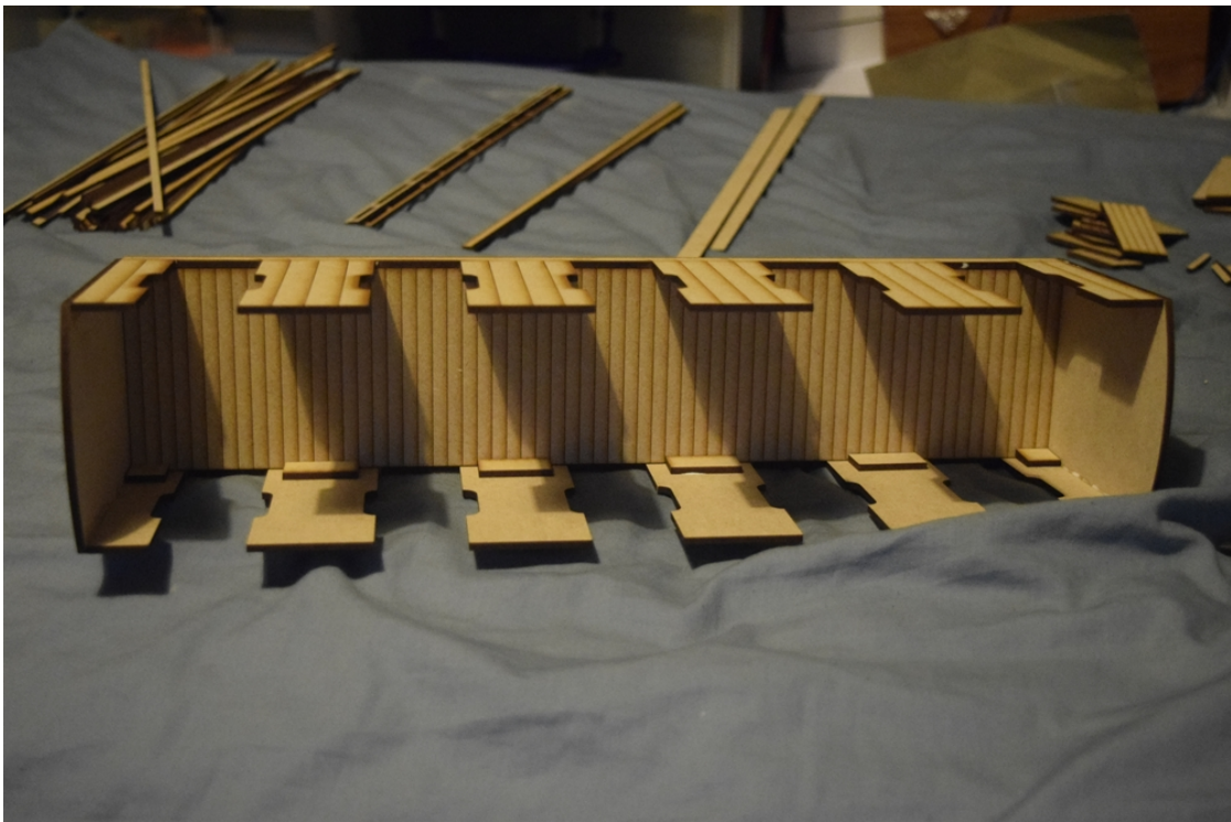
Next step is start on the interior. Start by gluing the seat supports into the coach. The small ones go into the corners formed by the sides/ends while the longer ones go between the door openings. They should match up with the planking on the floor.