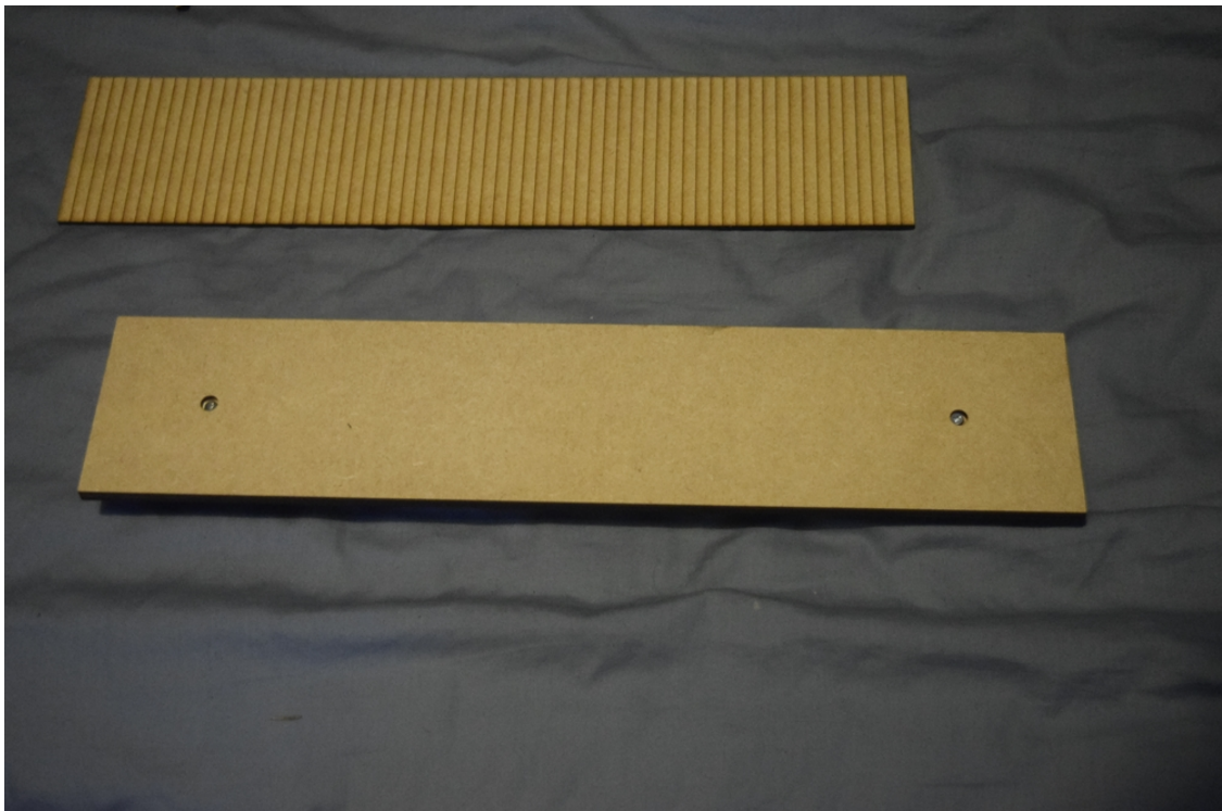
First step is to start the chassis. Start by gluing the two pieces with small holes in on top of each other making sure the holes are clear of glue.