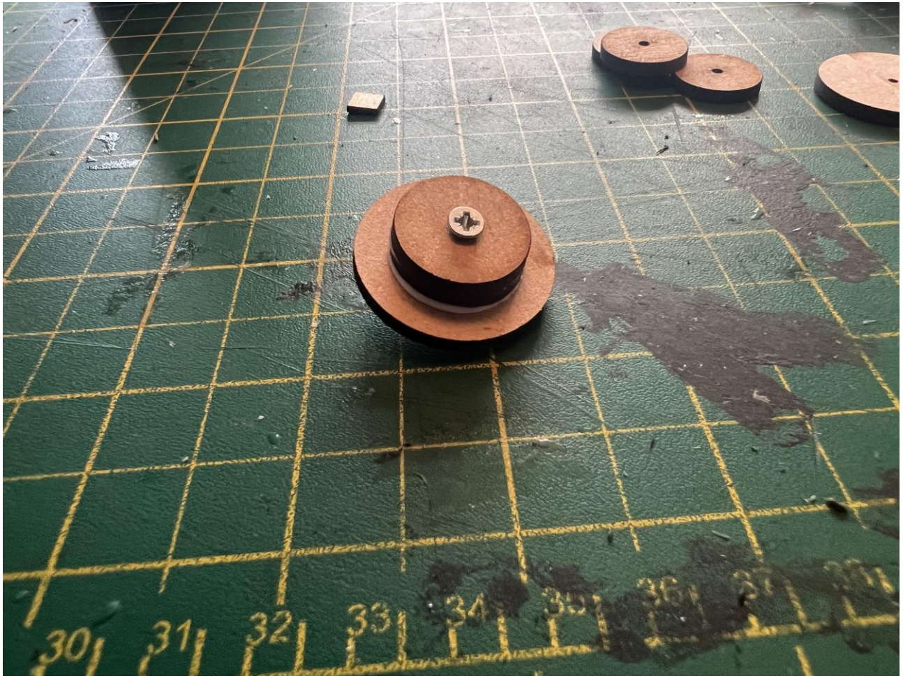
To mount the bogies, glue 2 smaller circles and one larger circle together in a tophat shape. It is recommended that you use the mounting screw to hold them together while they dry to ensure correct alignment.