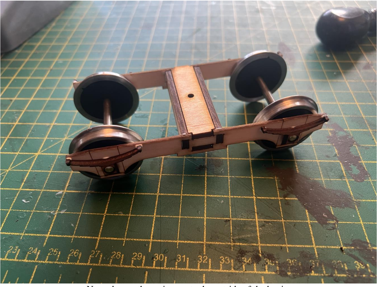
Now glue on the springs onto the outside of the bogie.