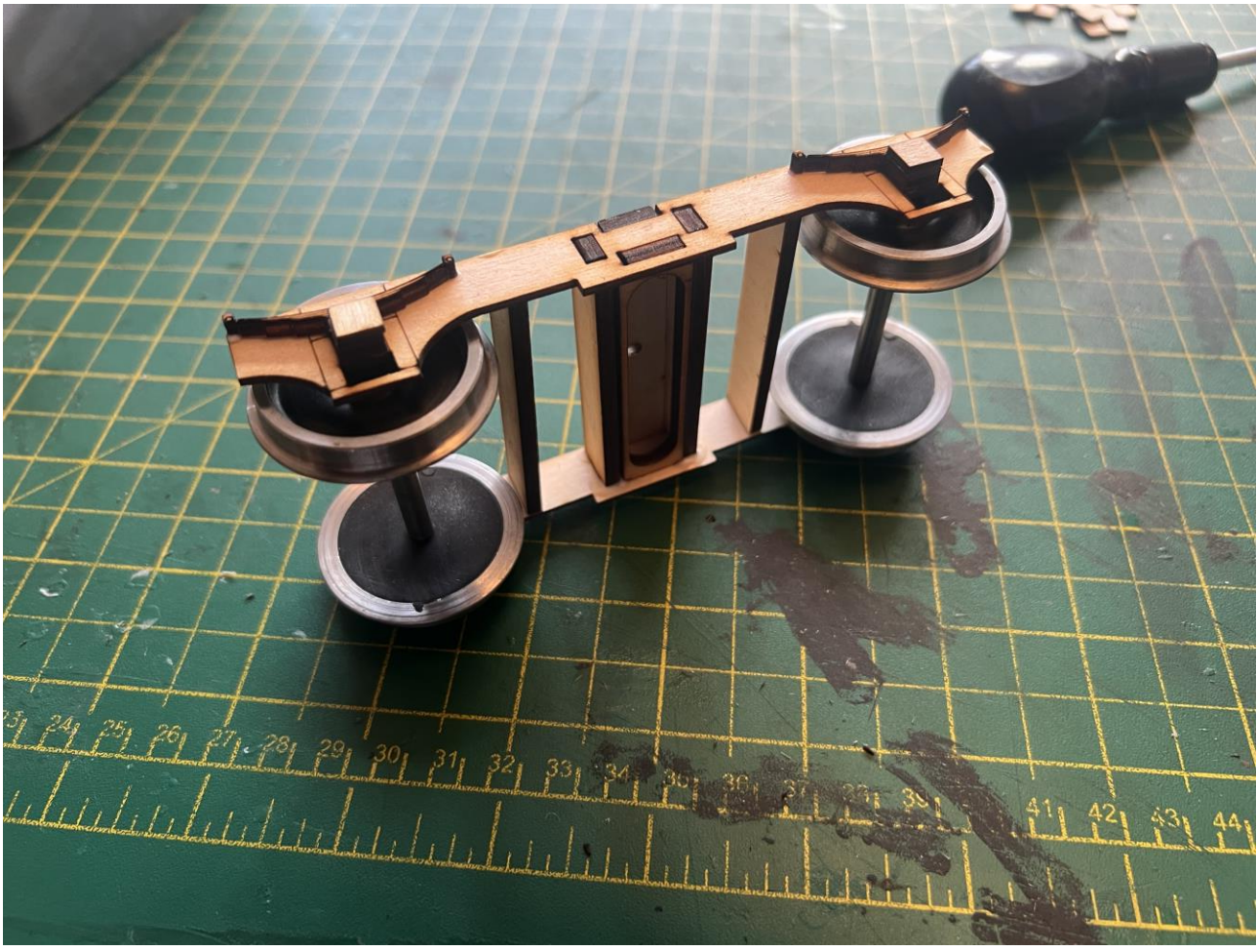
Next glue into place the axlebox covers.