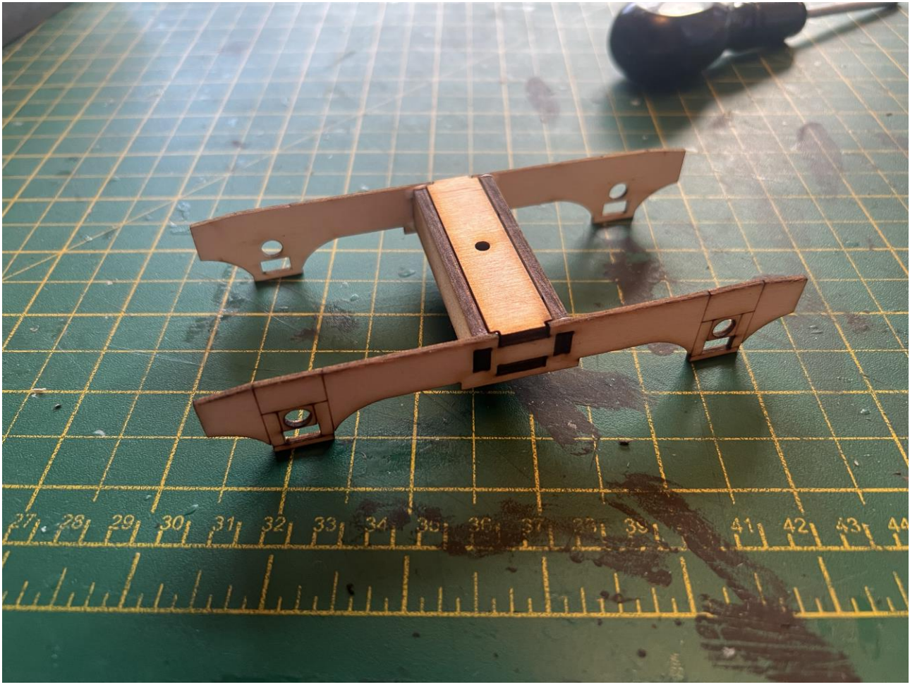
Next, glue into place the core top piece.