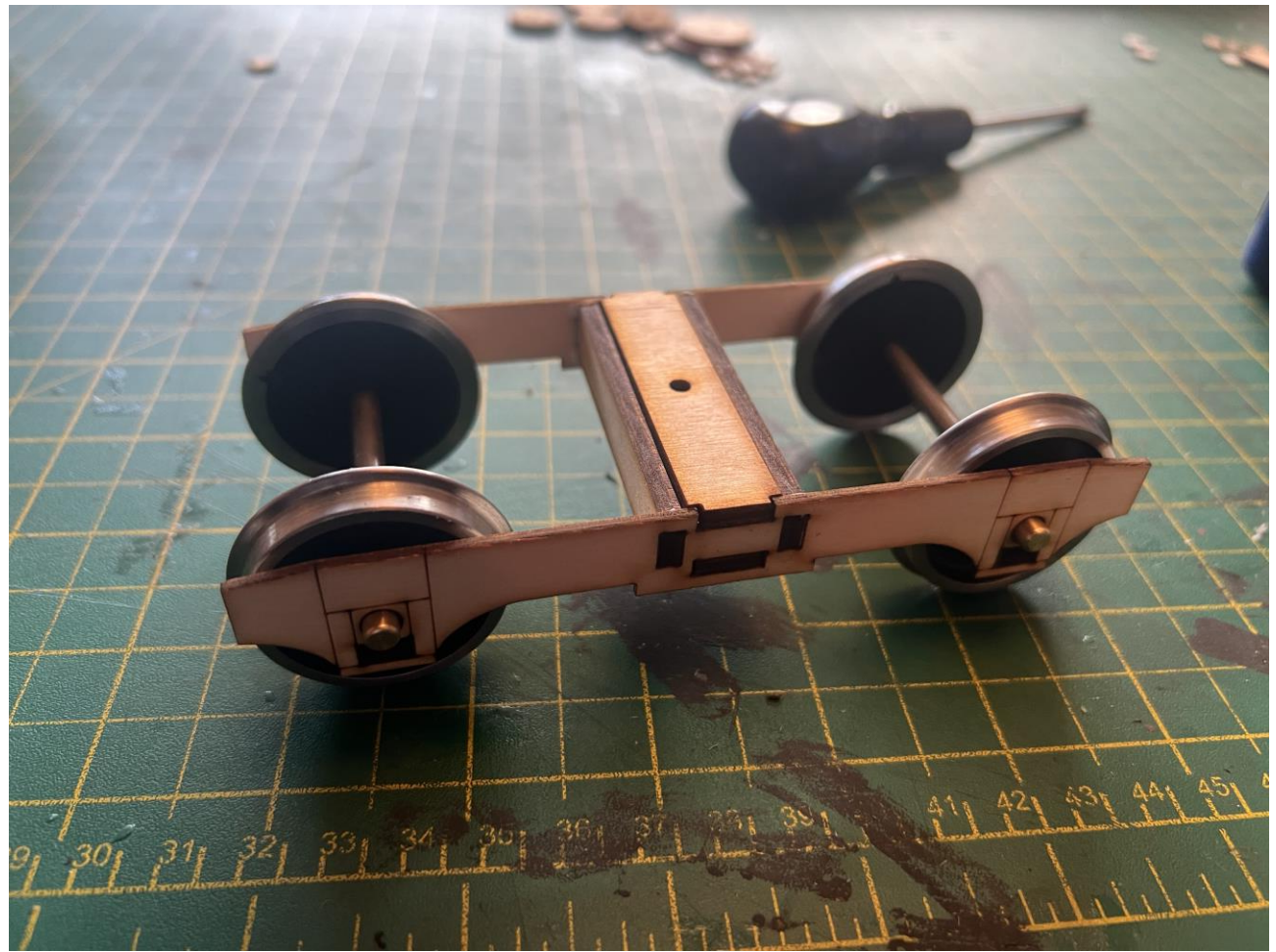
Now slide in the wheels and bearings. There is enough give in the bogie sides to allow for this to happen without any issues.