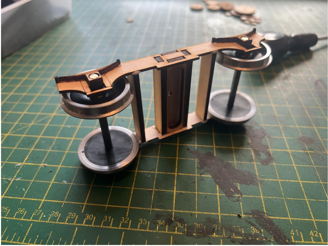
Now, glue into place the bogie stretchers between the wheels and the bogie core as close to the wheels as possible without interfering with the wheel rotation.