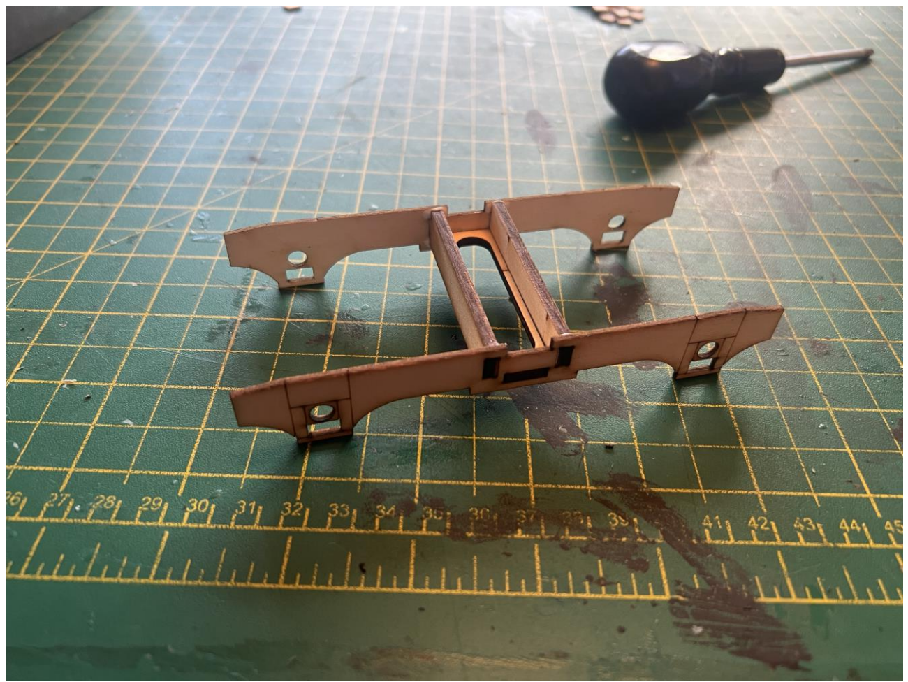
Start by gluing together the bottom and side parts of the bogie core to the bogie sides.