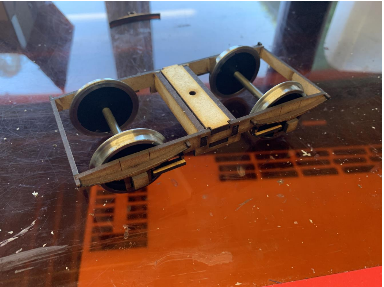
Your bogies are now complete.