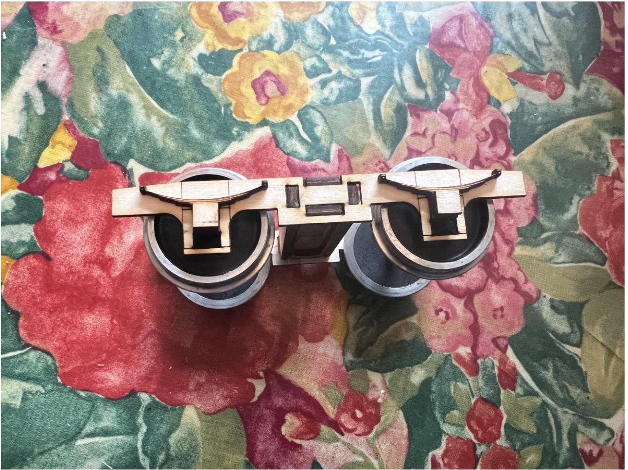
..... followed by the axlebox covers.