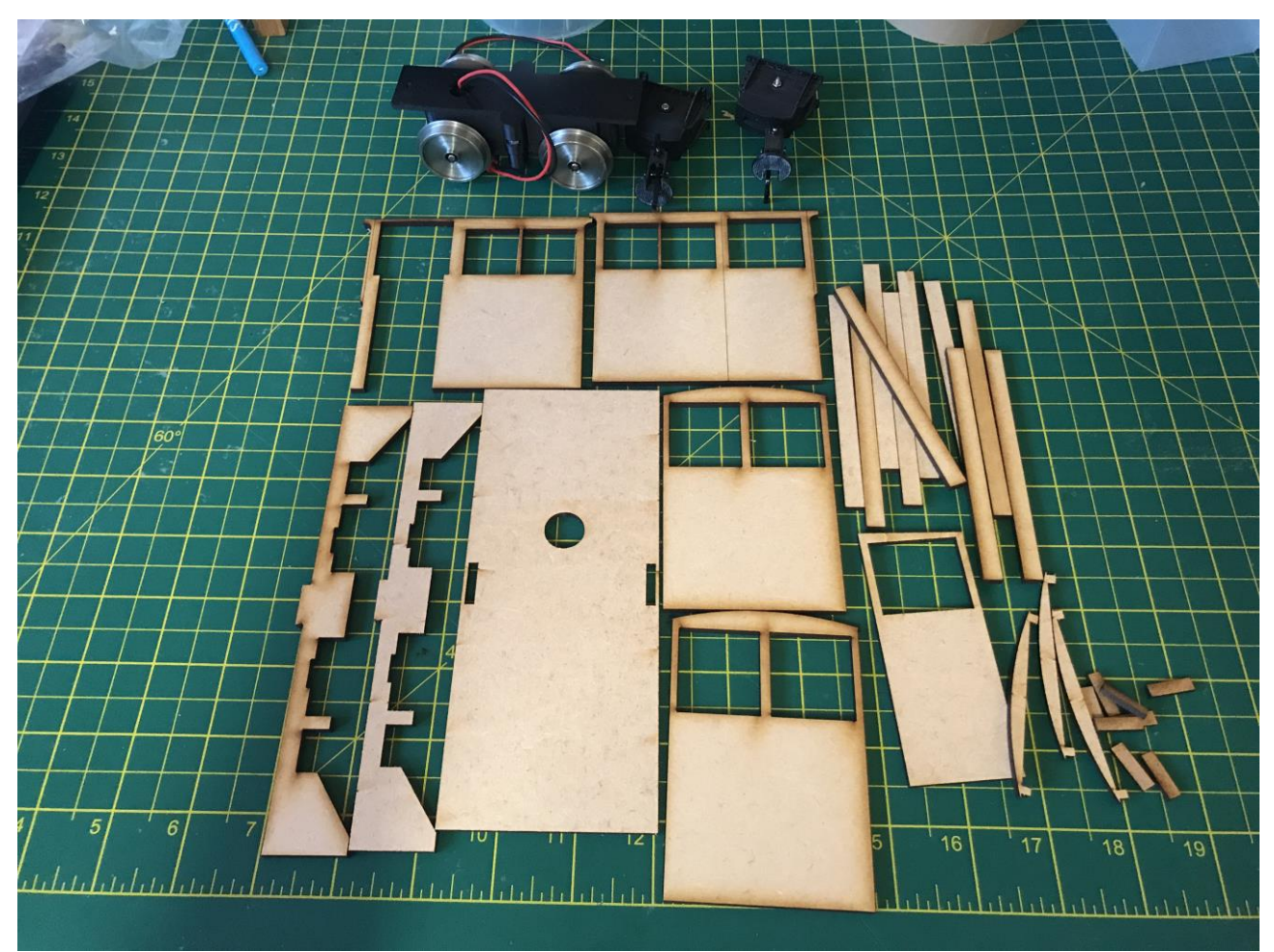
First start by laying out the parts of the kit to check you have everything. Not shown at the bufferbeams or the axle boxes.