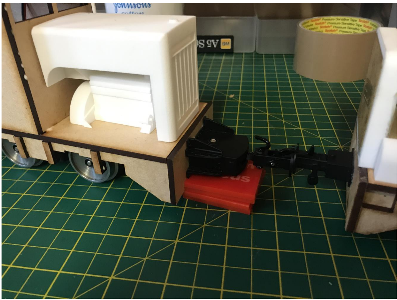
Now attach the couplings. Note shown here at the Bowaters Coupling Blocks coupled to another item of rolling stock to check the fit.

Bar painting and fitting the required electronics, your model is now complete.