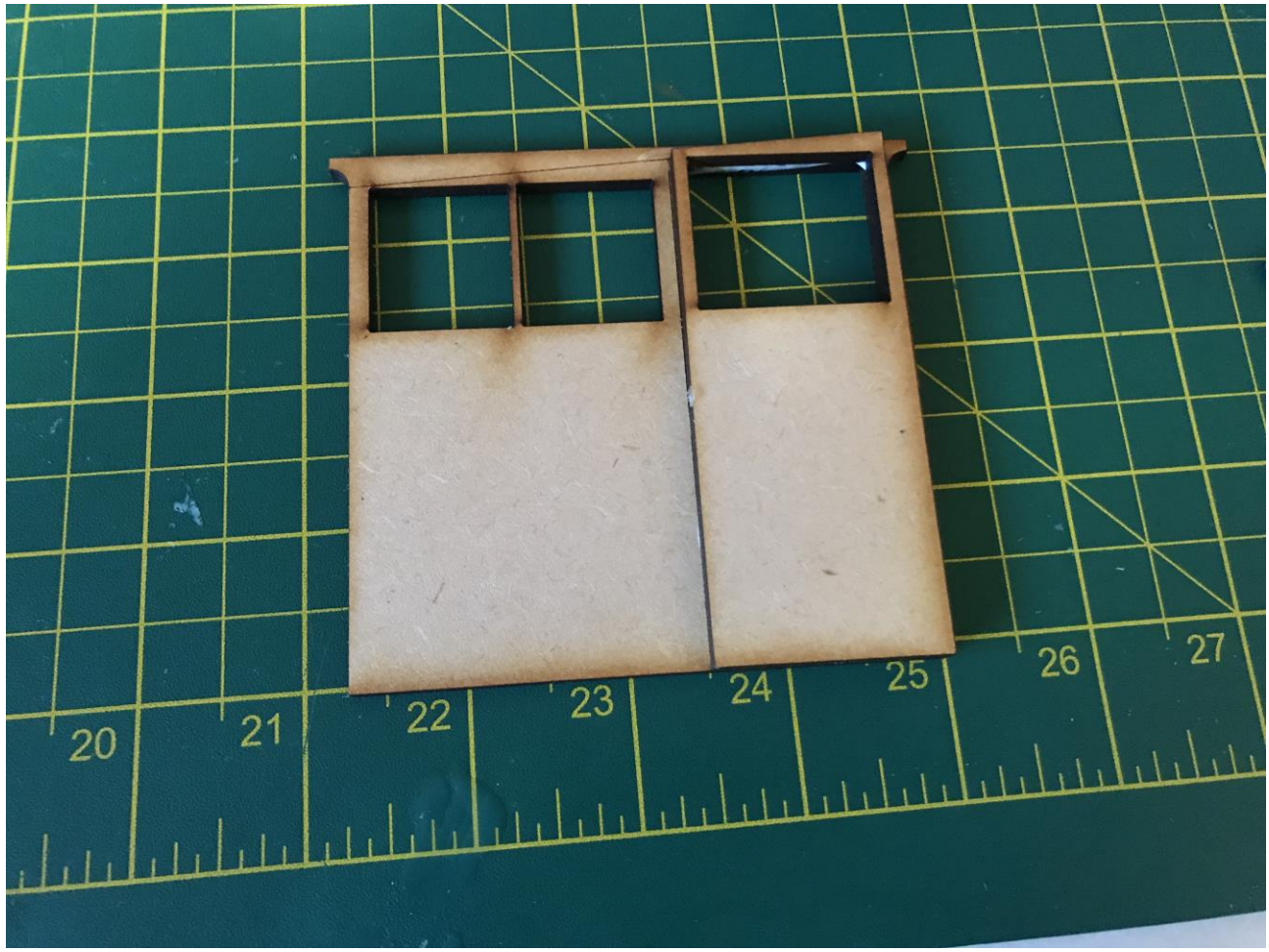
Now it is time to start the cab. Glue the door panel onto the chassis over the gap on the left hand side. This is optional as the engine at one point in its life had access from both sides of the cab.