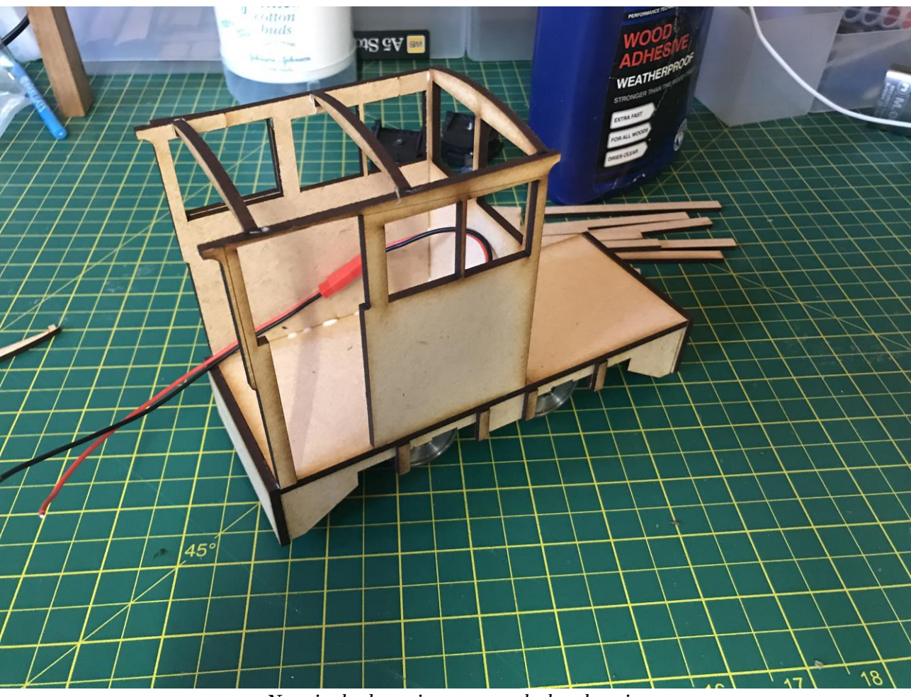
Now is the best time to attach the chassis.