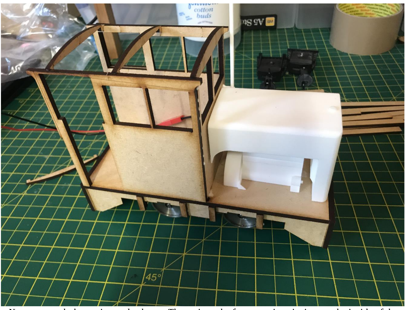
Now we attach the engine and exhaust. These sit so the fan extension sits just on the inside of the radiator and the exhaust attaches to the front of the cab.