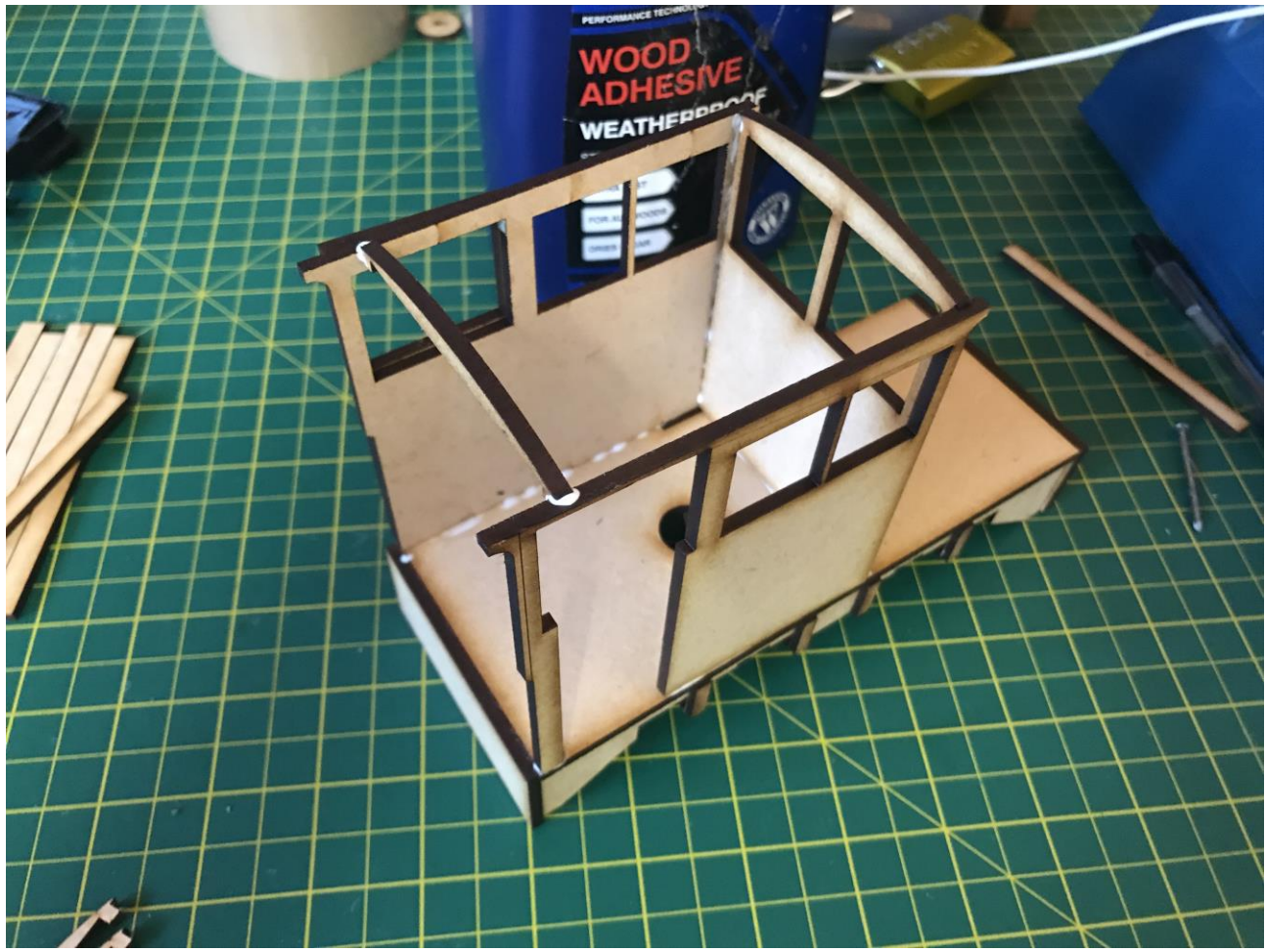
Now is the best time to glue the roof supports in. As the back of the cab is the access to the batteries, these help keep the cab in line. The hole in the floor goes inside the cab.