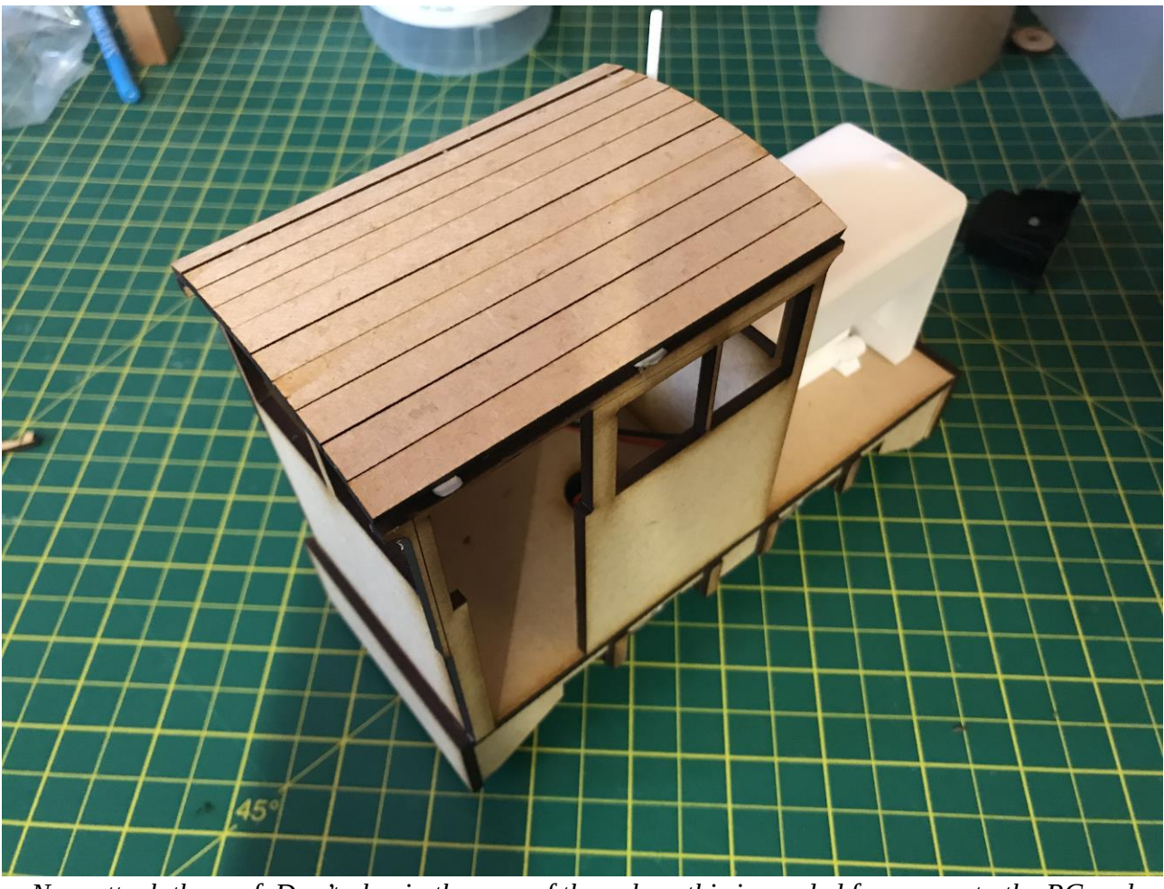
Now attach the roof. Don't glue in the rear of the cab as this is needed for access to the RC and batteries.