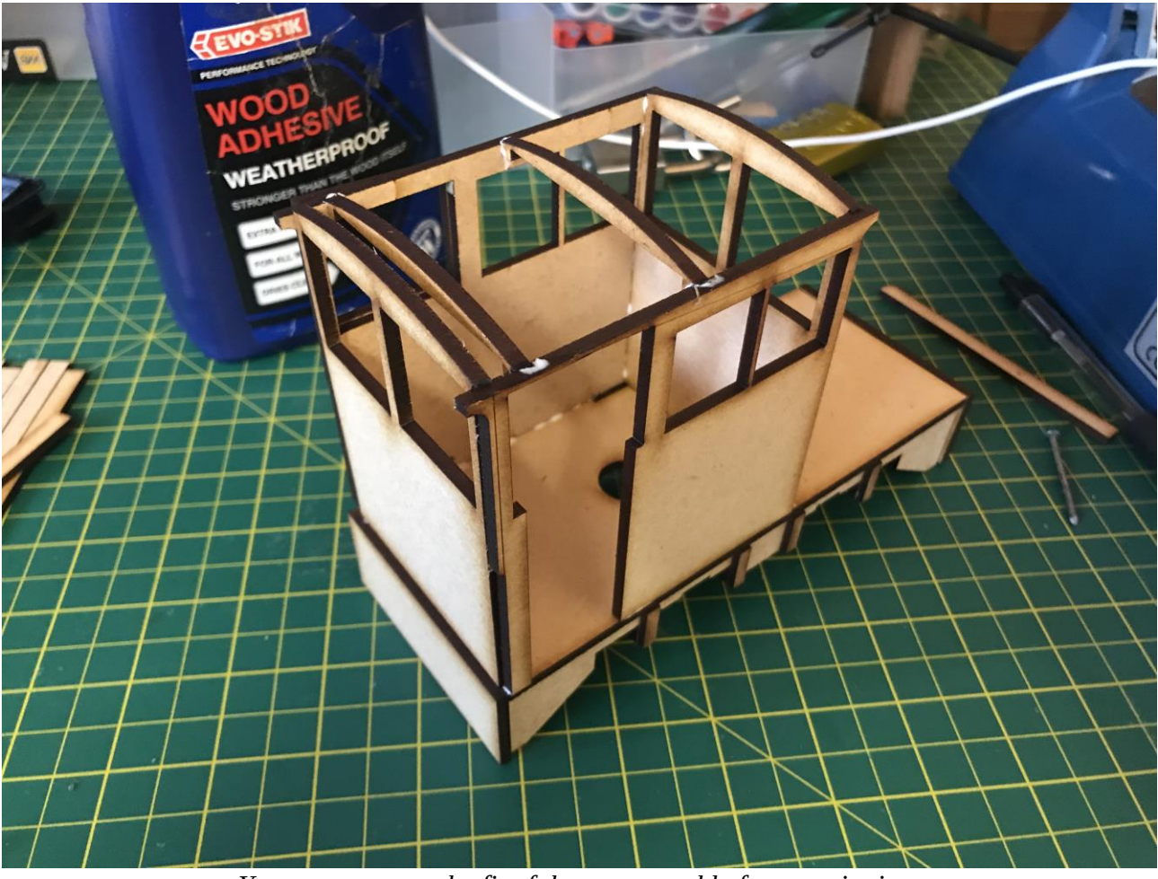
You can now test the fit of the rear panel before continuing.