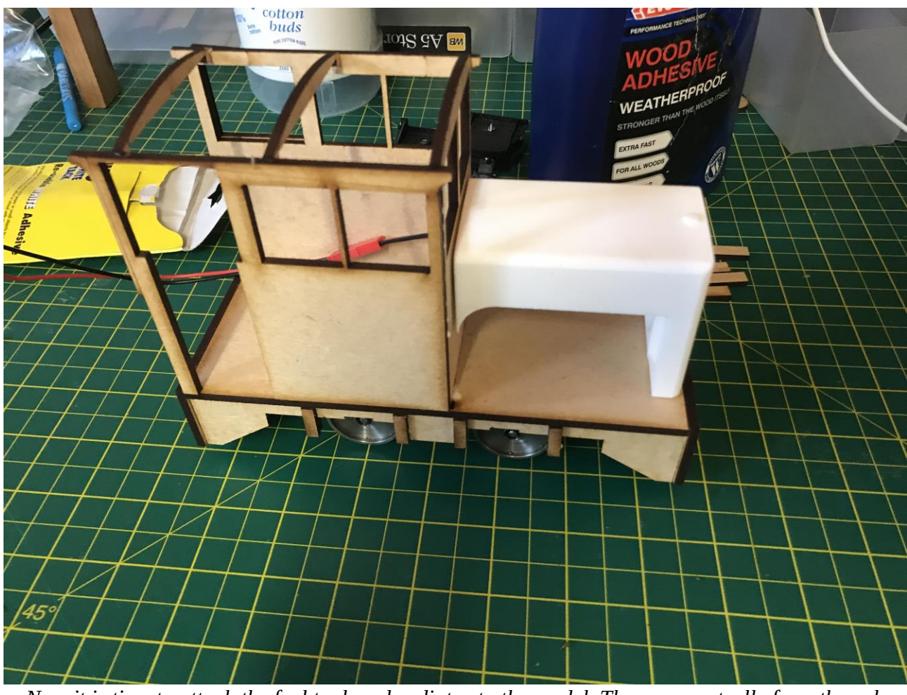
Now it is time to attach the fuel tank and radiator to the model. These go centrally from the cab towards the front.