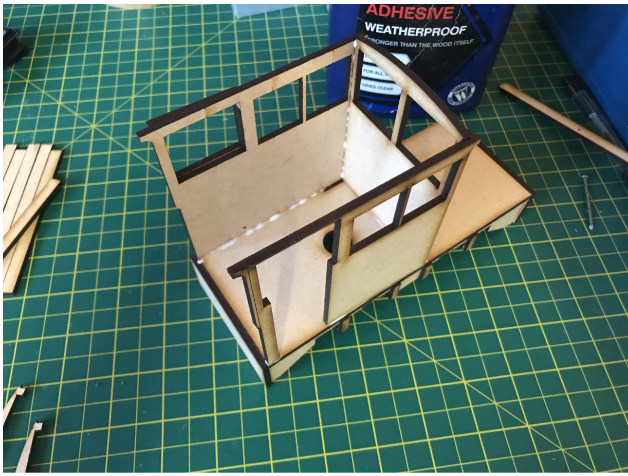
Now its time to start assemble. Glue the front and sides onto the body. The back of the sides sit level with the back of the bufferbeams.