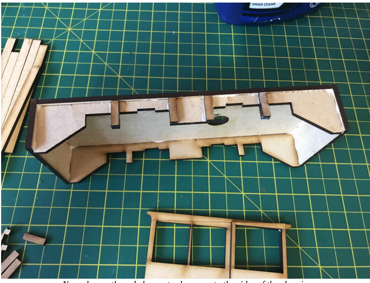
Now glue on the axle box outer layers onto the sides of the chassis.