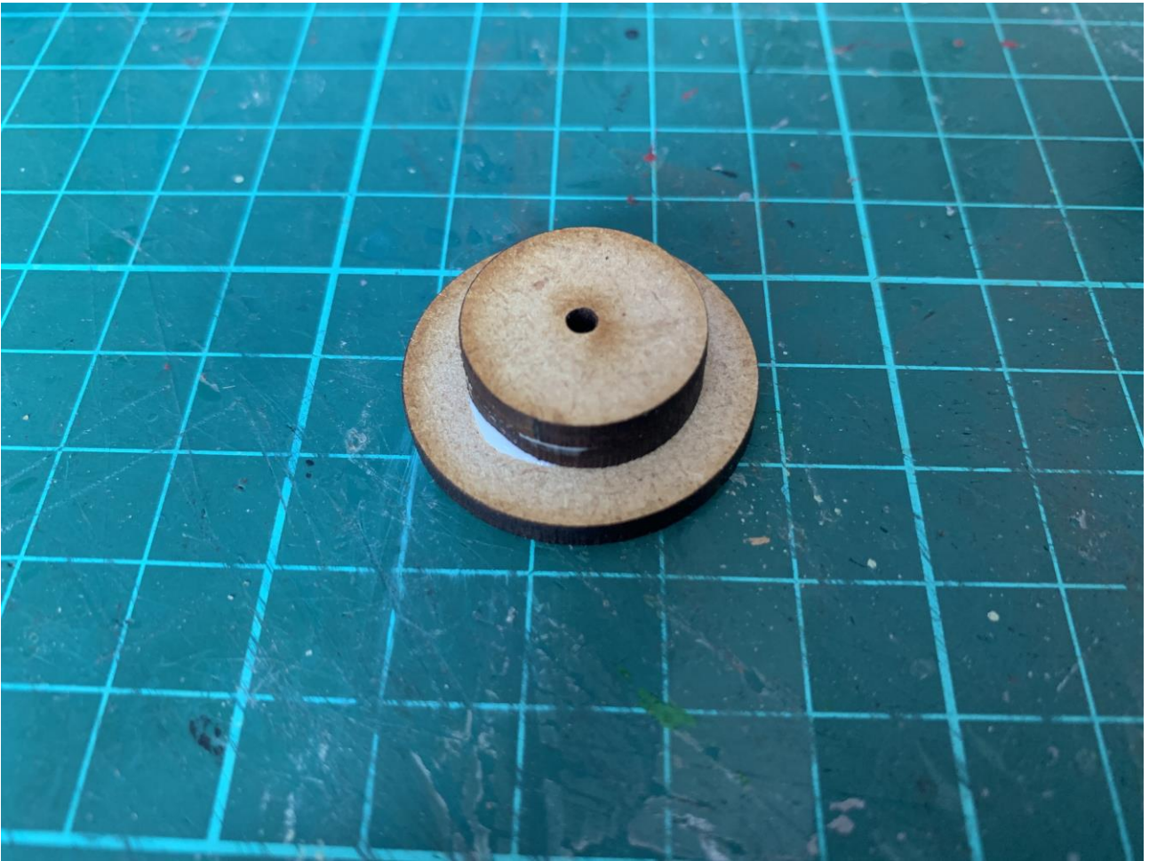
The bogie bolster is formed of 2-3 small disks and a larger disk which is mounted onto the bottom of the rolling stock you are fitting the bogies too.