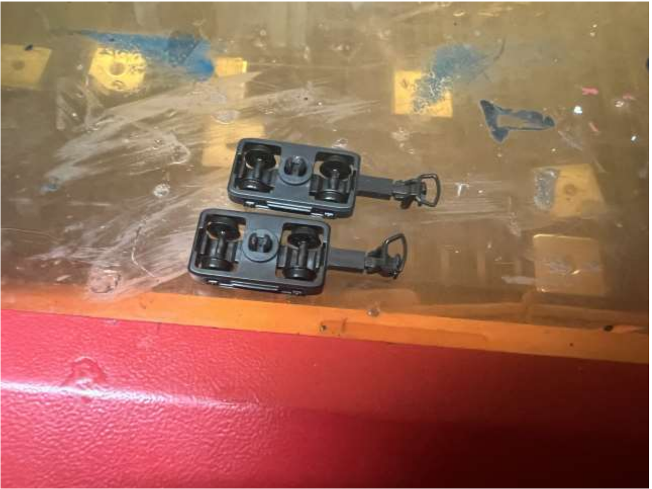
Assemble the Peco bogies as per their instructions.