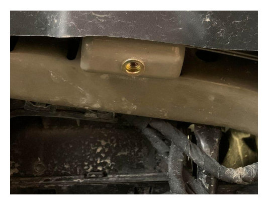
Install the riv nut at existing thru hole, on left and right side forward upper support bracket (Driver side shown)

Install the riv-nuts in four locations, two per side, as shown