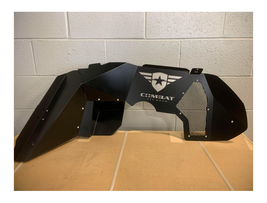
Passenger Side Assembly

Use the supplied bolts, washers and nuts at each location and tighten with the 4 mm Allen key and 10 mm wrench.