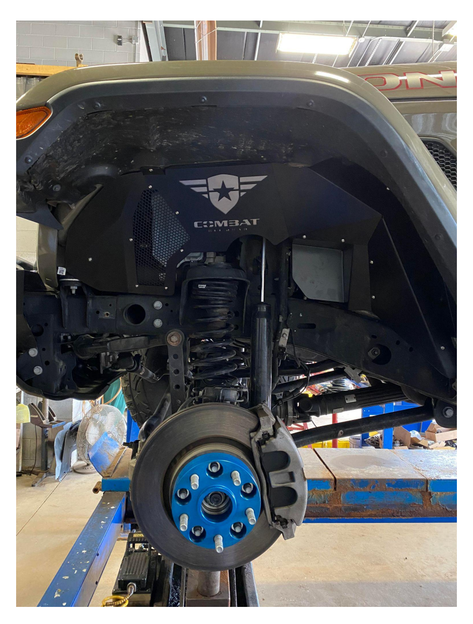
Driver Side Completed