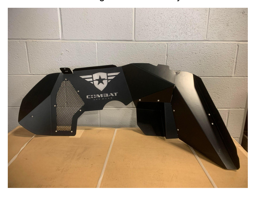
Driver Side Assembly