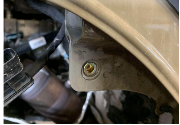
Install the riv nut at existing thru hole, on left and right side upper rear location (Driver side shown)