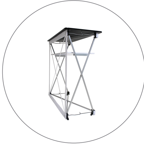
(Qty 1) Frame (Qty 1) Counter Top