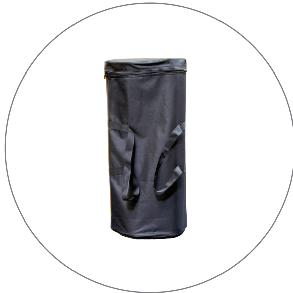
(Qty 1) Padded nylon travel bag