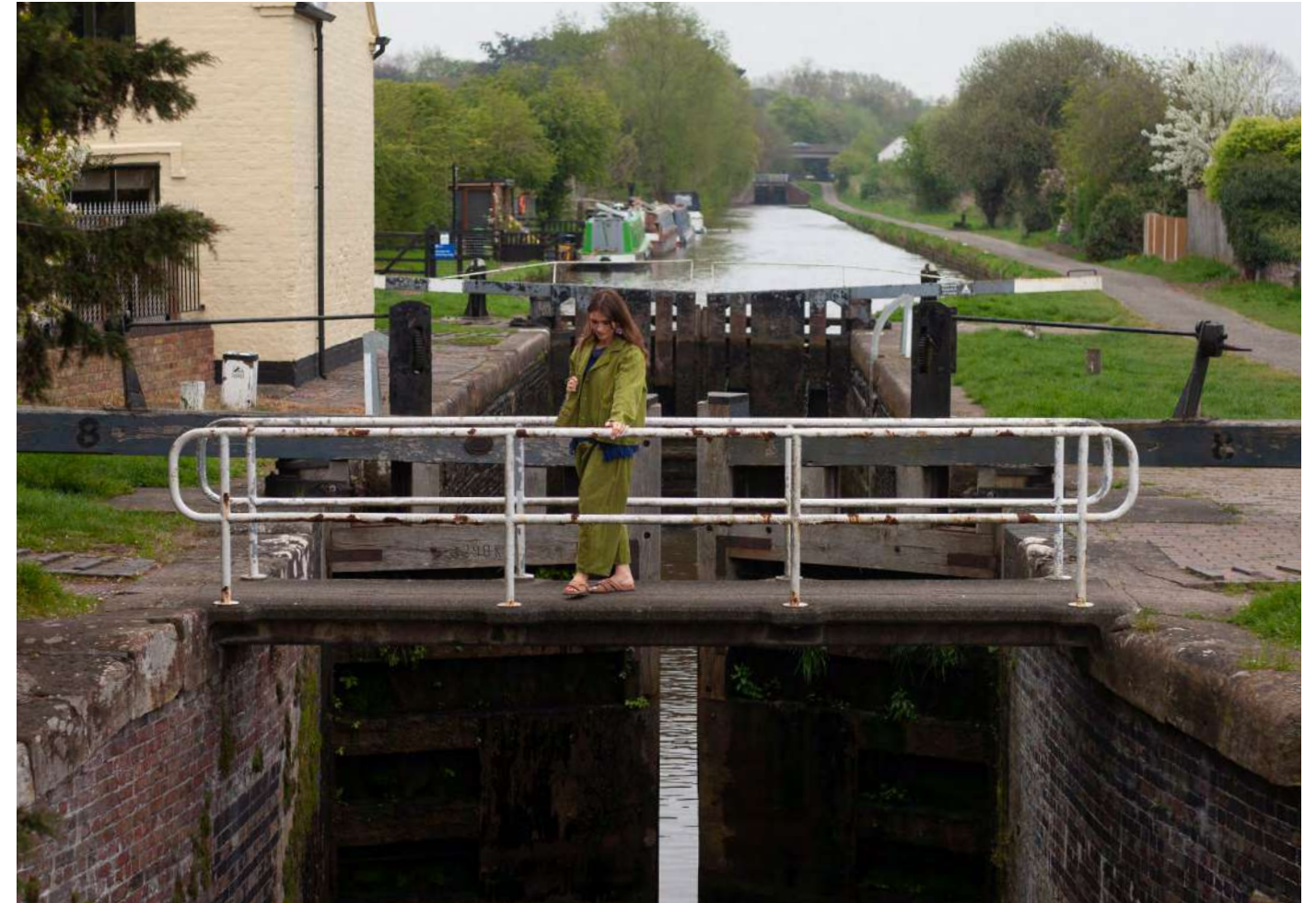
TOP Jacket 41764, Shirt 41861, Top 43018, Trousers 43009. BOTTOM LEFT Scarf 41863, Shirt 41862, Top 28620, Trousers 41724, Boots 42367. BOTTOM RIGHT Shirt 41832, Top 41816, Trousers 41771, Boots 42367.