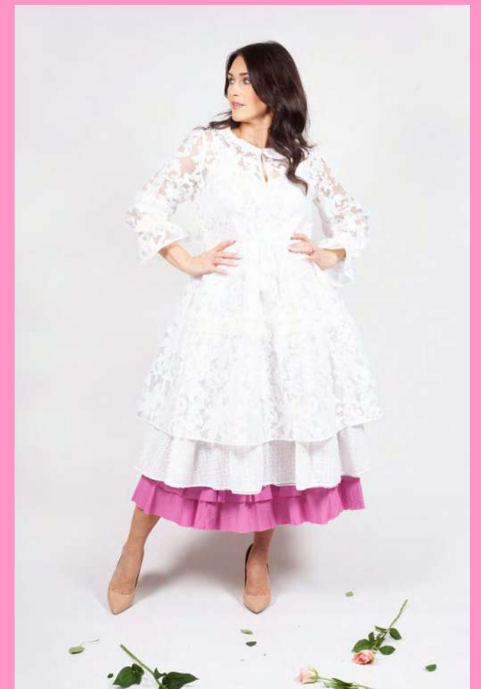
TOP LEFT Dress 27820, Top 27798, Skirt 10713, Shoes Model's Own. TOP RIGHT Dress 41706, Skirt 10713, Skirt 279430S, Shoes Model's Own. BOTTOM LEFT Dress 429870S, Jacket 429830S, Shoes 15204. BOTTOM RIGHT Dress 2841542, Shoes 32389.