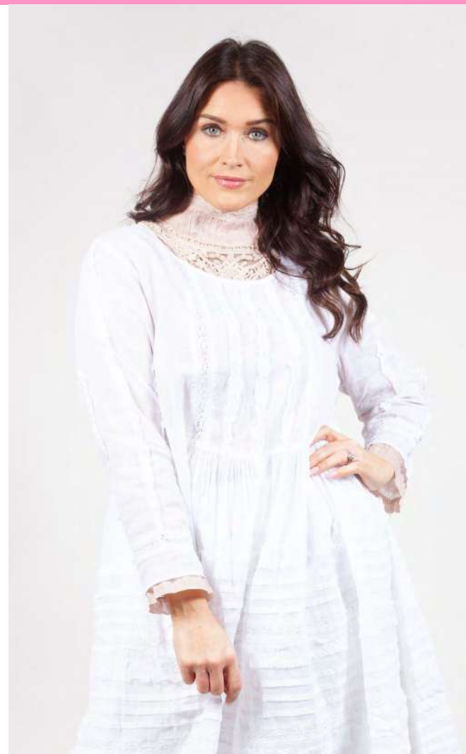
TOP Dress 41704, Shoes Model's Own. BOTTOM LEFT Dress 10681, Skirt 27967, Scarf 277300S, Shoes 15204. BOTTOM RIGHT Dress 27820, Top 27798, Skirt 10713, Shoes Model's Own