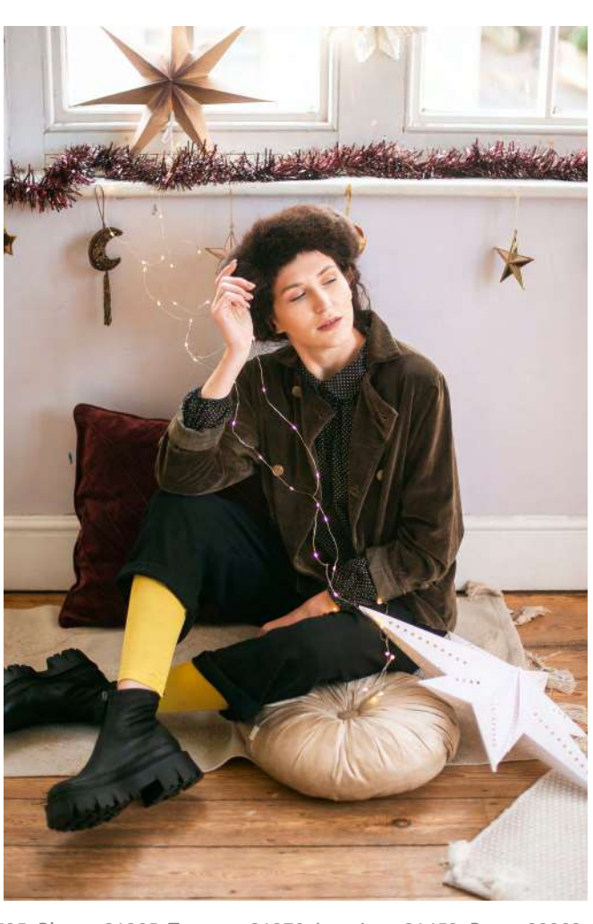
TOP LEFT Dress 31393. Collar 31397OS. Belt 27495. TOP RIGHT Jacket 31525. Blouse 31385. Trousers 31379. Leggings 31453. Boots 32283. BOTTOM LEFT Blouse 31363. Vest 31383. Skirt 31381OS. Brooch 23402. Boots 32283. BOTTOM RIGHT Dress 31355. Vest 31378OS.