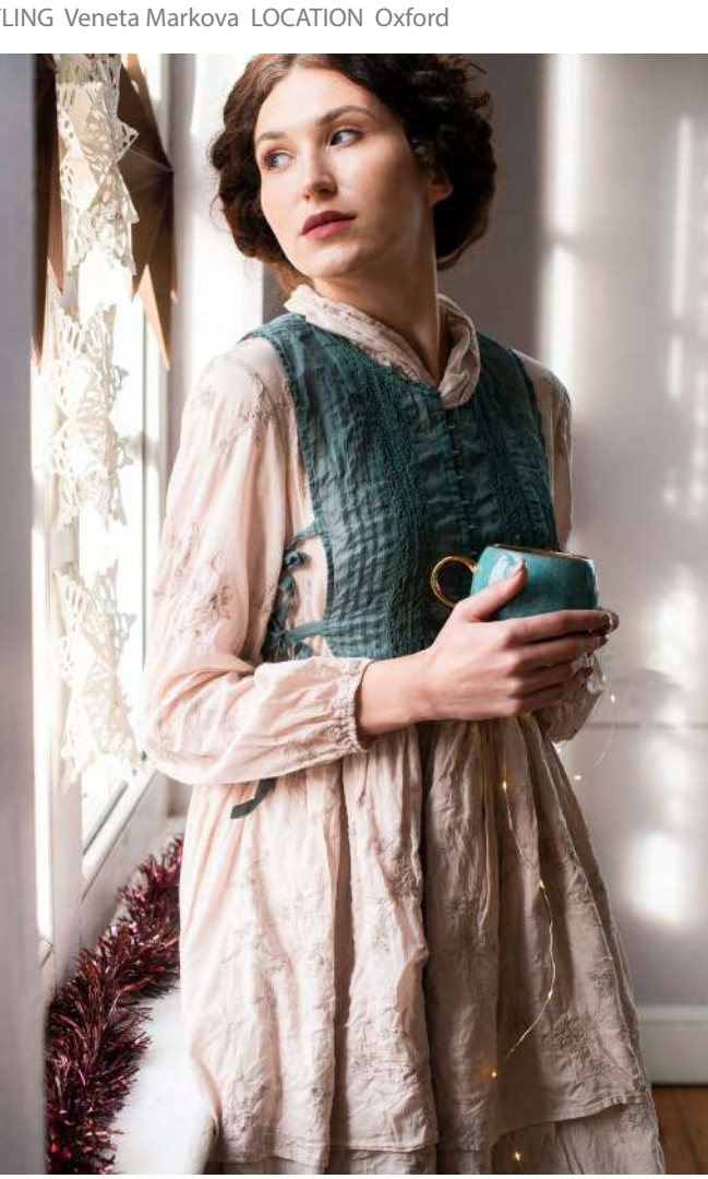
TOP Dress 31374. Blouse 31344. Skirt 31339. Boots 28002. BOTTOM LEFT Dress 31351. Tunic 31361. Belt 12134. BOTTOM RIGHT Dress 31355. Vest 313780S.