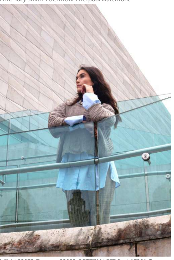
TOP LEFT Coat 12617. Trousers 17300. Bag 24562OS. TOP RIGHT Coat 22477. Shirt 22072. Trousers 22093. BOTTOM LEFT Coat 17301. Trousers 21689. BOTTOM RIGHT Jumper 24527. Shirt 13156. Trousers 17300. Necklace 12363OS.