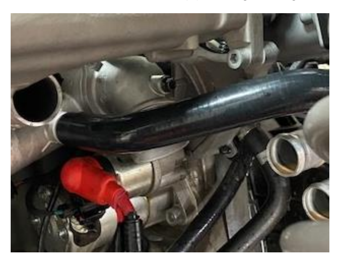
Step 10: Install the supplied hose from the large barb on the coolant tank to the thermostat block. Reuse (2) self-tightening OEM clamps.