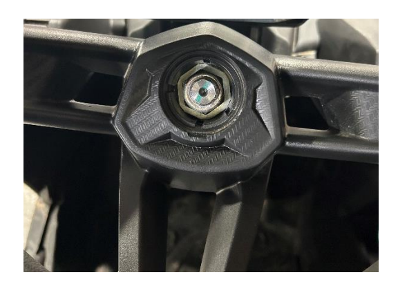
Step 2 - Use a 24mm socket and ratchet to remove the steering wheel nut.