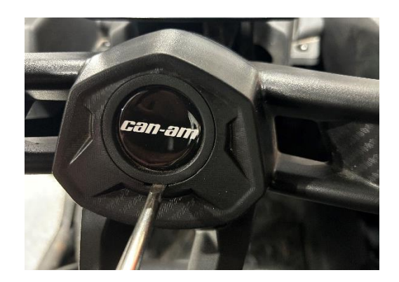
Step 1 - Use a flat blade screwdriver to remove the center steering wheel Cover.