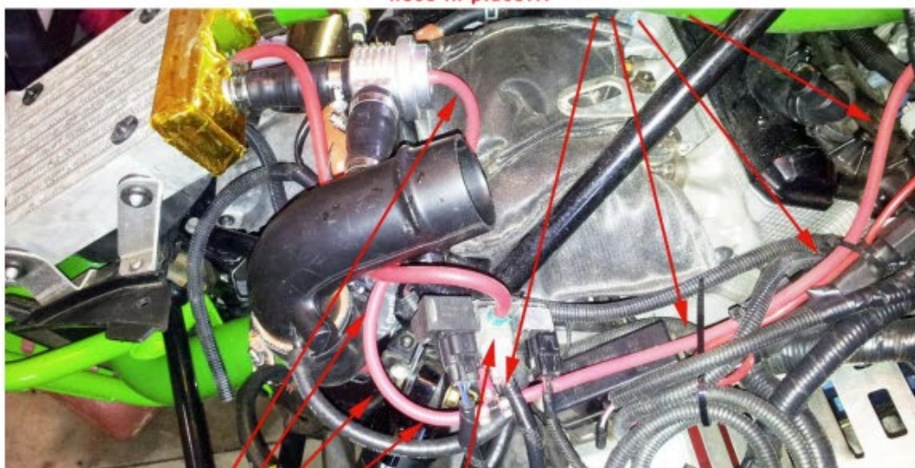
LINE TO BRV BRV Solenoid

Route BRV line the way shown. Secure LOOSELY to the smaller harness (not either of the ecu harnesses, but the small harness that is closer to the engine) DO NOT TIGHTEN ZIP TIES - The Zipties are only to keep the hose in place!!!