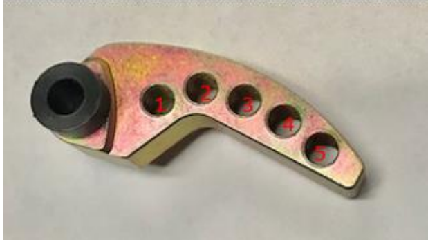
NOTE: Always install a set screw on both sides of the weight arm. Install the screws with the provided blue thread locking agent. Make sure the screws are installed with an equal amount of thread engagement.